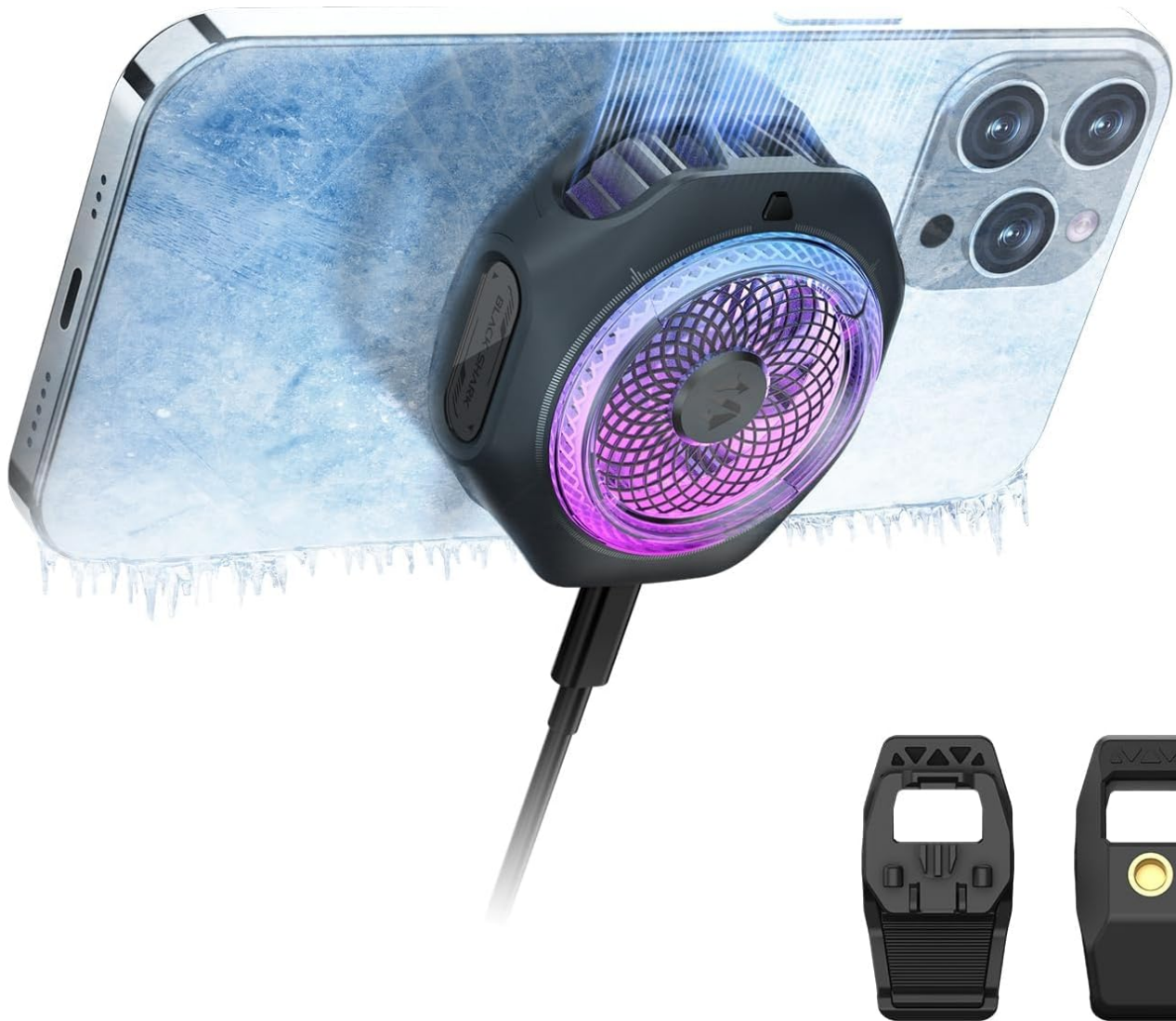
Image: The Black Shark Magnetic Cell Phone Cooler 4Pro attached magnetically to the back of a smartphone, demonstrating the magnetic connection.