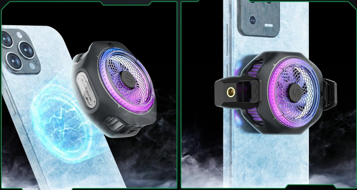
Image: Illustration of the cooler's compatibility, showing magnetic attachment for iPhone 12 and above series, and clip-type attachment for Android phones without magnetic suction (width 66-85mm).