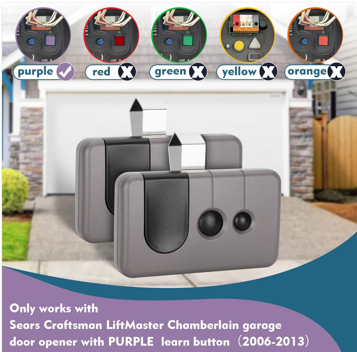
Figure 2.1: Visual guide for compatible purple learn button.