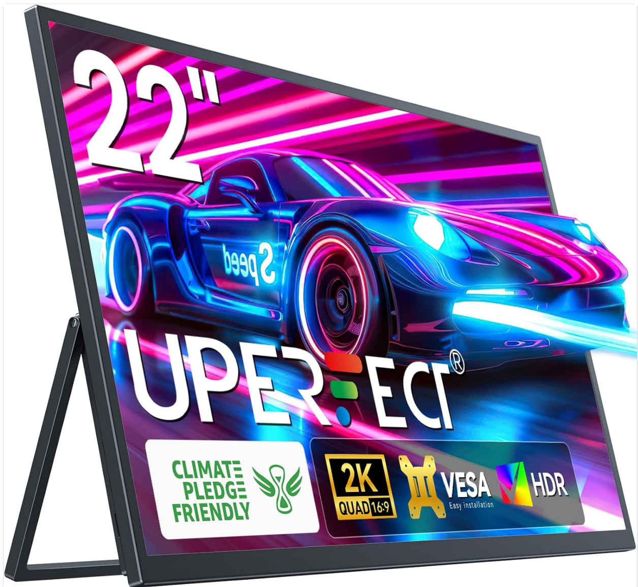
The UPERFECT 22" 2K Portable Monitor, showcasing its sleek design and vibrant display capabilities.