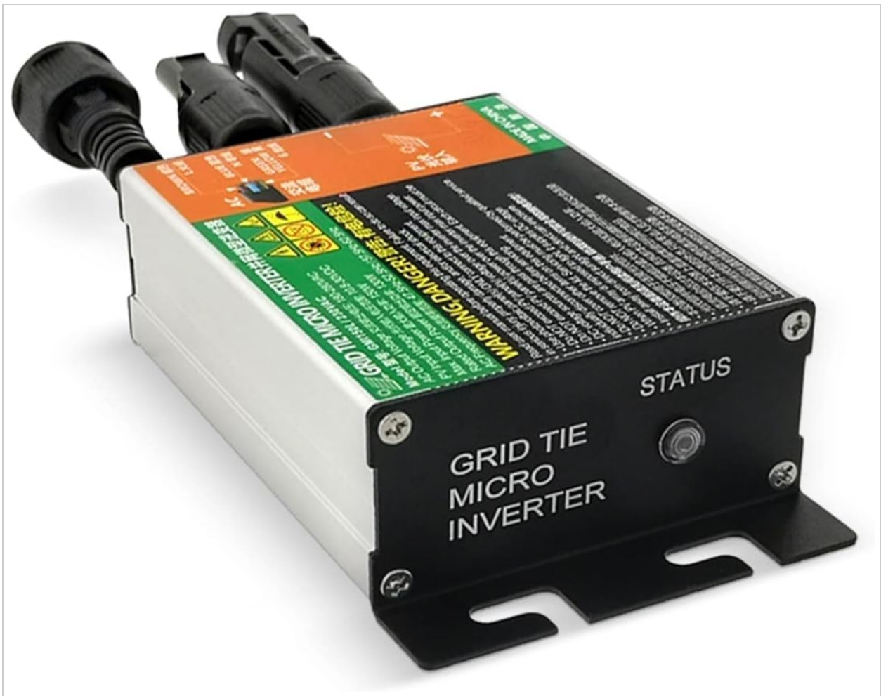
Image 4.1: The 'STATUS' indicator light on the GMI Series Micro Inverter.