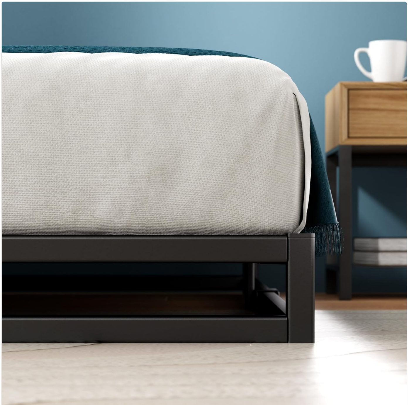
Detail of the heavy-duty steel base and robust connections for enhanced stability.