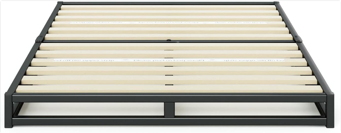
Detailed dimensions for various sizes of the Joseph Platform Bed Frame.

The Zinus Joseph Low Profile 6 Inch Platform Bed Frame comes with a limited 5-year warranty covering any manufacturing defects. For further assistance, missing parts, or warranty claims, please contact Zinus customer support. Safety Warning: Always follow the manufacturer's instructions for safe use. Ensure proper assembly and adhere to weight limits. Use appropriate bedding materials, especially for infants and young children.