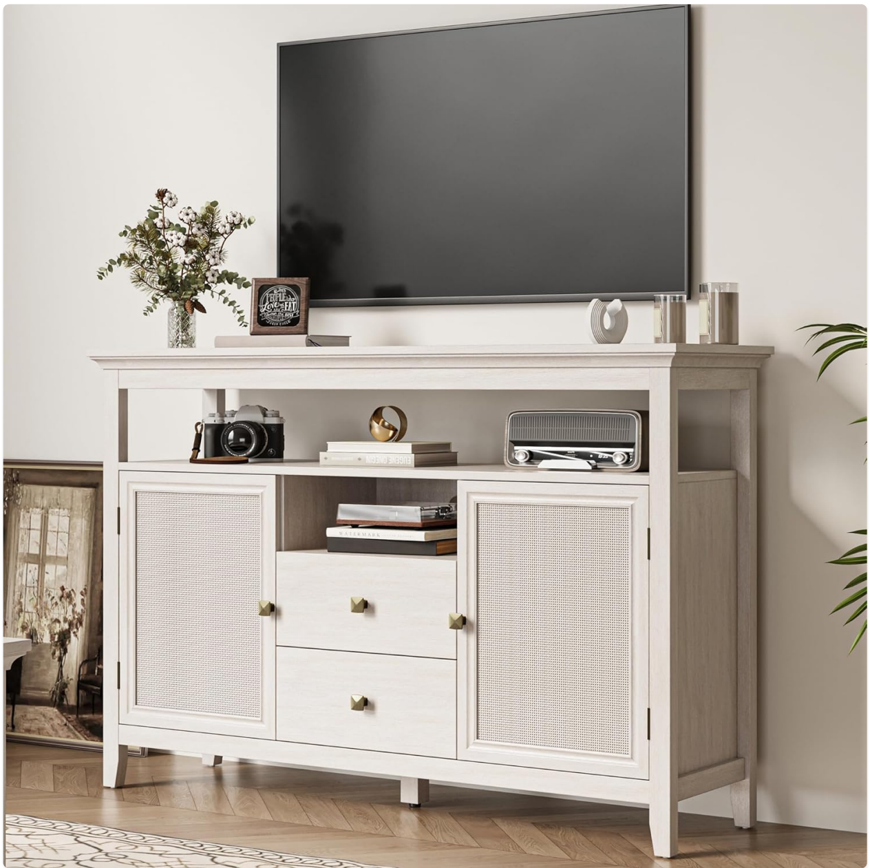
Image 1.1: The HEYNEMO Farmhouse Rattan Storage Cabinet, showcasing its design and functionality in a typical home environment.