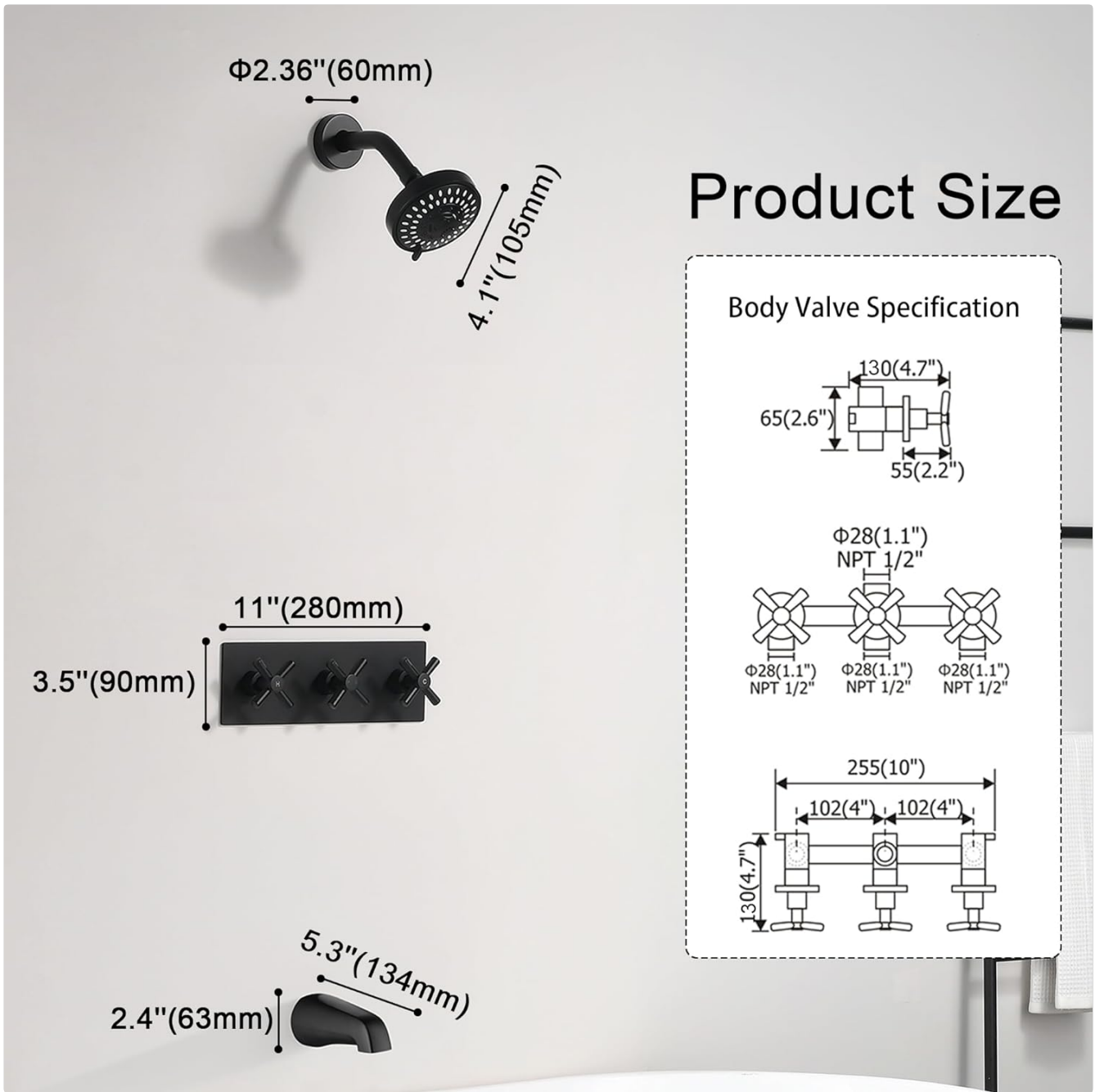
Figure 5: Product Dimensions and Body Valve Specification.