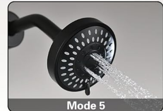
Figure 4: Adjusting Shower Head Spray Modes.

Your browser does not support the video tag.