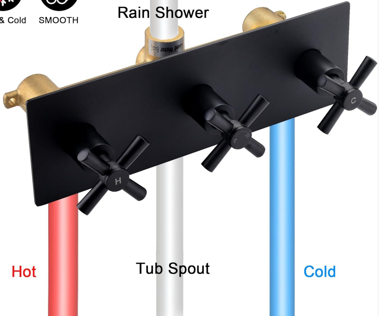
Figure 3: Hot, Cold, and Diverter Handles.