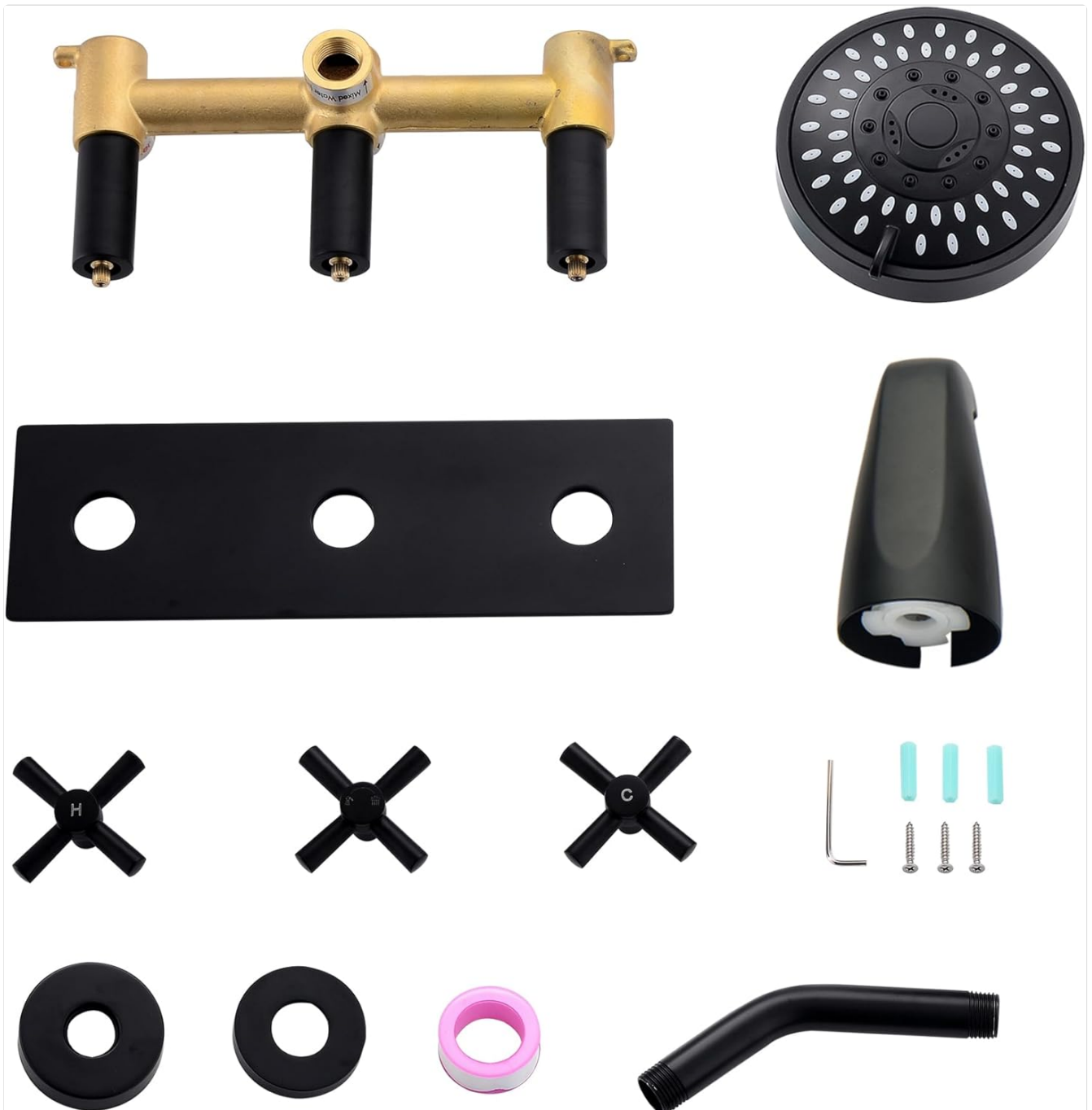
Figure 2: Package Contents.