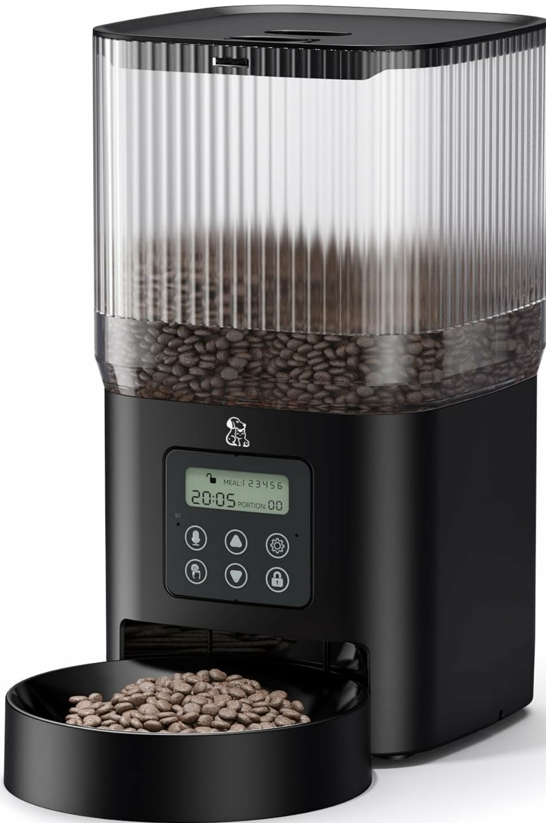
Image 3.1: Front view of the Olelica Automatic Pet Feeder, showing the transparent food hopper, control panel, and food bowl.