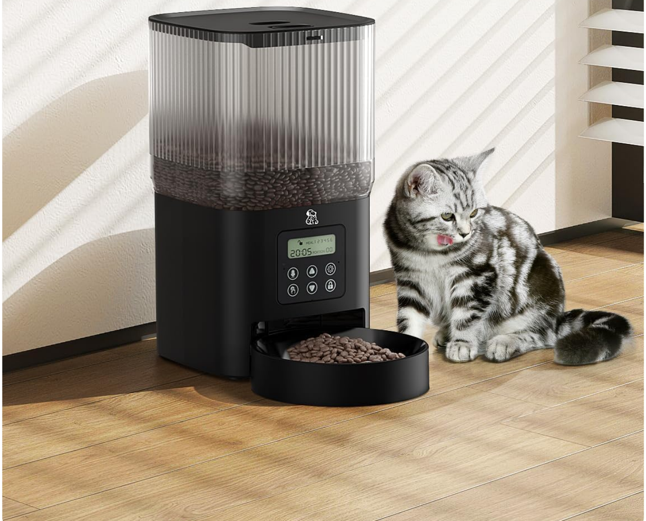
Image 5.1: Visual representation of the feeder's programmable feeding schedule, showing 1-6 meals/day, 0-8 portions/meal, and 5L capacity.