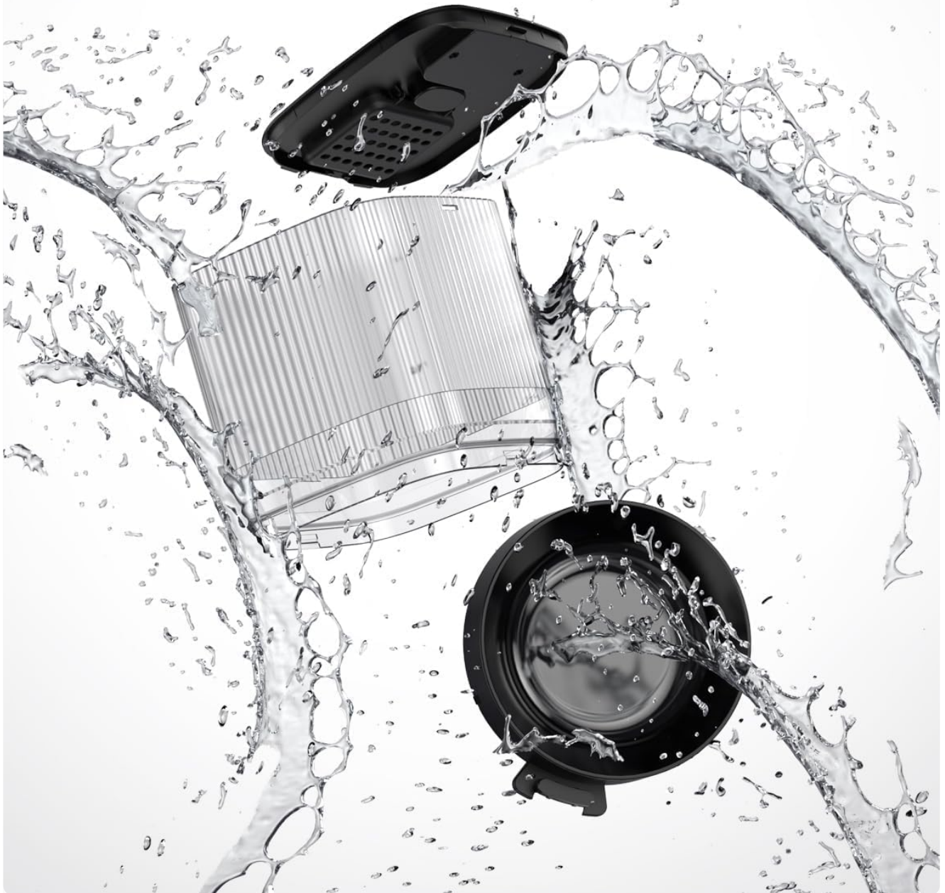
Image 6.1: Detachable components of the feeder, including the hopper and bowl, shown being cleaned.