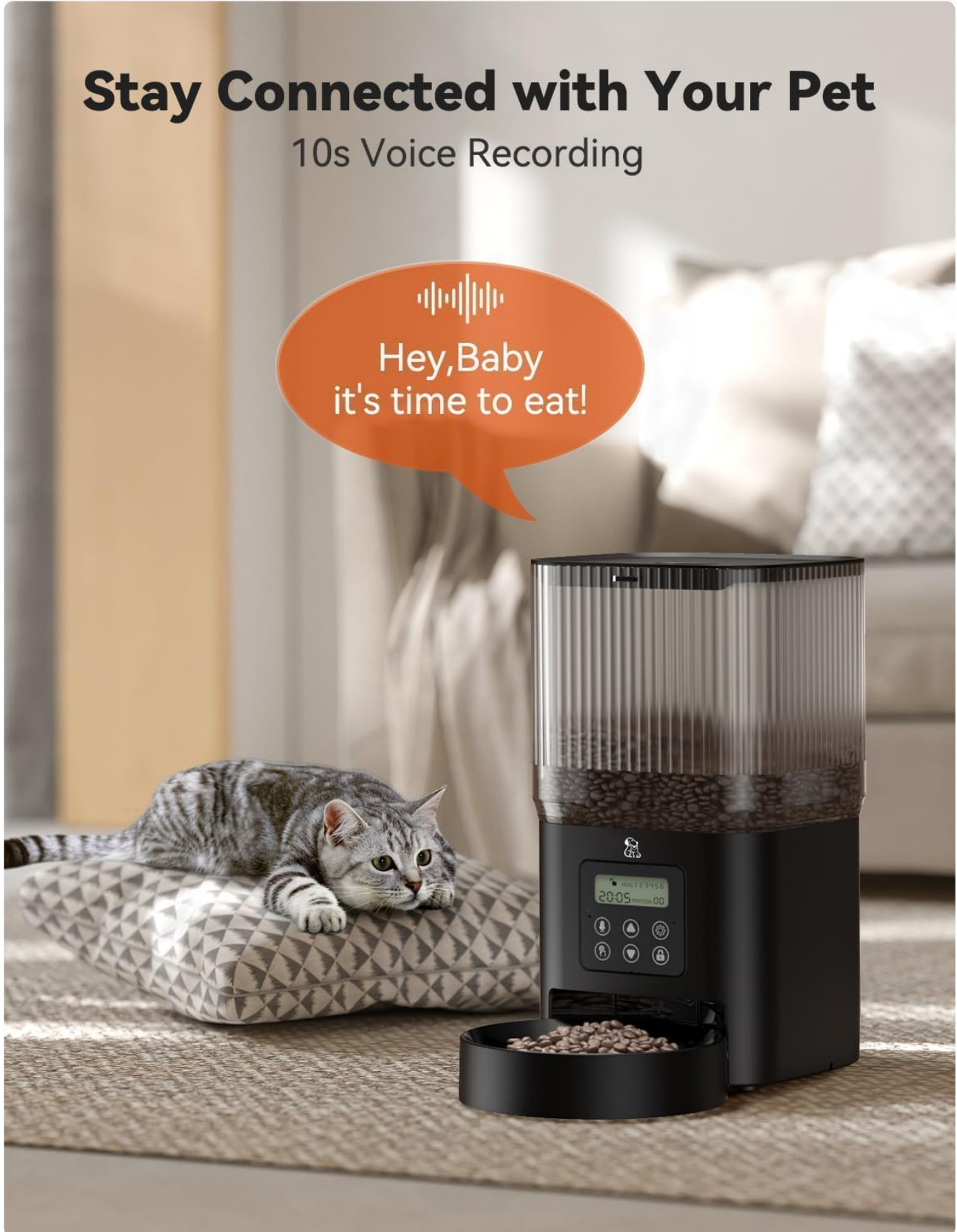
Image 5.2: The feeder with a cat, illustrating the 10-second voice recording feature to call pets for meals.

You can record a 10-second voice message to call your pet at meal times.