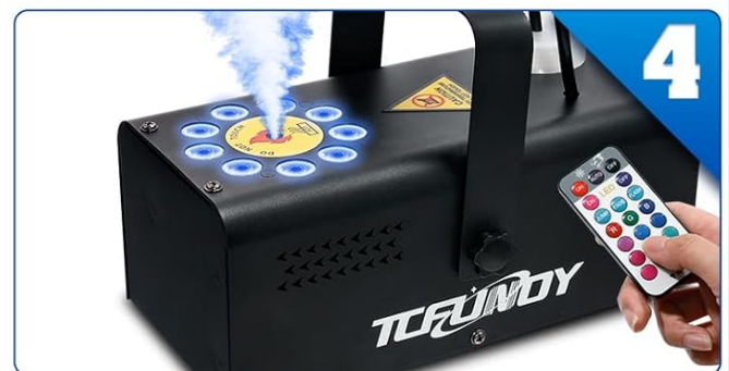
Image: A four-panel image illustrating the operational steps: 1. Pouring fog fluid, 2. Connecting the power cord, 3. Turning on the power switch and waiting for warm-up, 4. Using the remote control to activate fog and lights.

▪Use the remote control to start spraying fog, control the color or effect.