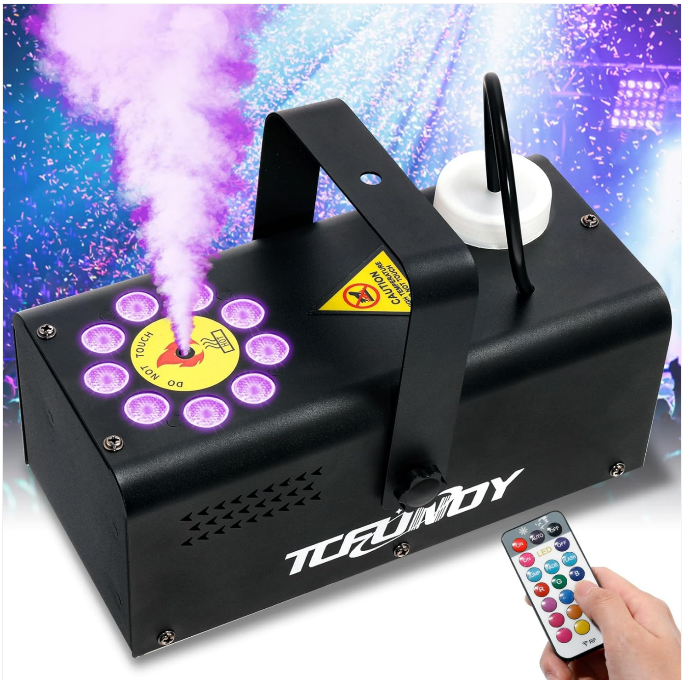
Image: The TCFUNDY 500W Vertical Fog Machine, black in color, with 9 LED lights around the fog outlet, emitting purple fog. A remote control is shown in the foreground.