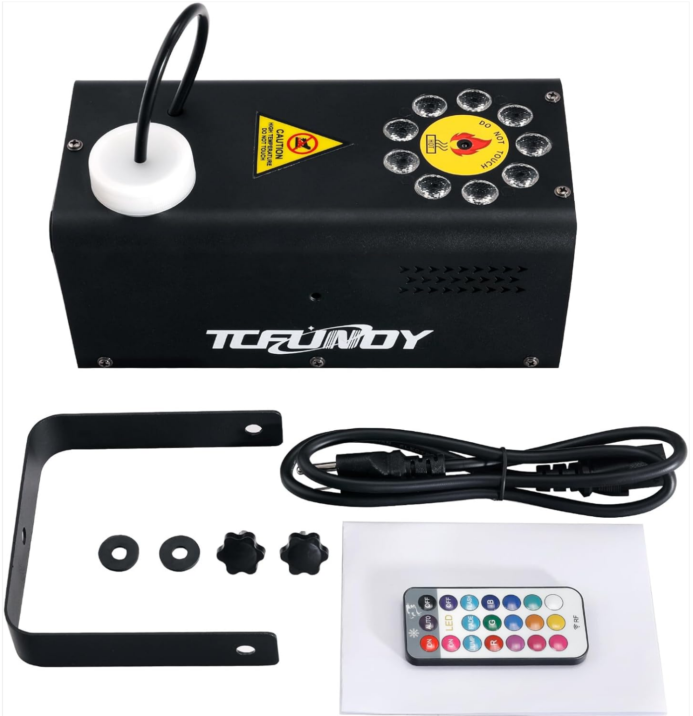
Image: The TCFUNDY 500W Fog Machine and its accessories laid out, including the machine itself, a remote control, a power cord, a handle bracket, and small screws.