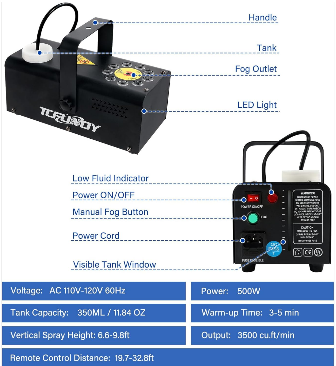
Image: A diagram labeling the key parts of the TCFUNDY 500W Fog Machine, including the handle, fluid tank, fog outlet, LED lights, power switch, manual fog button, power cord, and visible fluid tank window.

Familiarize yourself with the components of the fog machine: