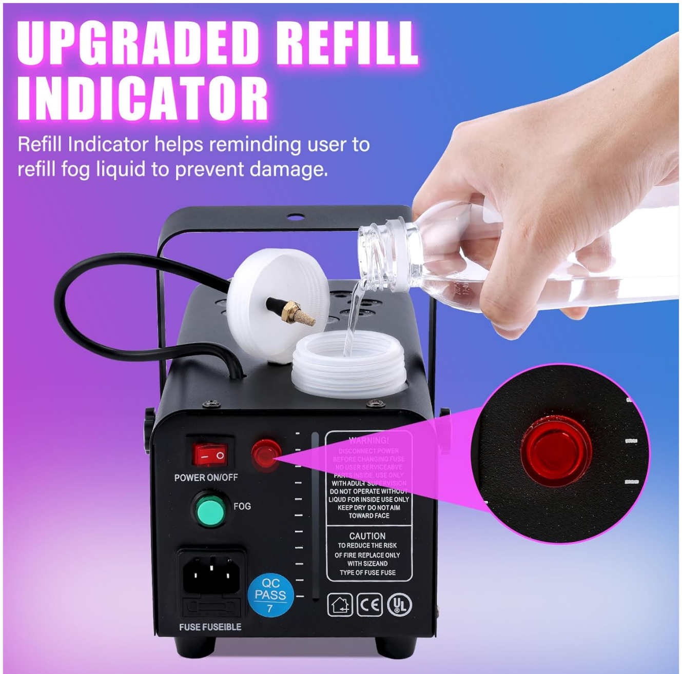
Image: A hand pouring fog liquid into the machine's tank. The "Upgraded Refill Indicator" is highlighted, showing a red light when the fluid is low.