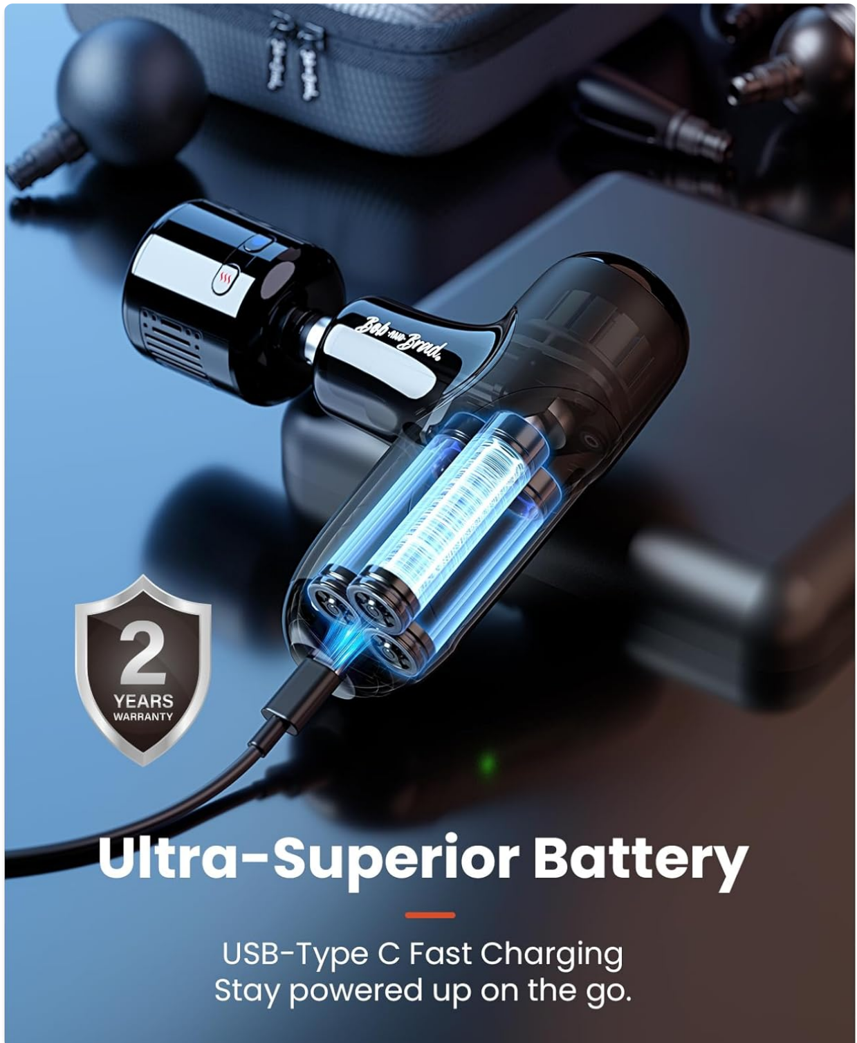
Figure 2: USB-C charging port and internal battery indicator.

Before first use, fully charge your Q2 Pro Mini Massage Gun. The device can be fully charged in just 1.5-2 hours using a fast charger (not included). The multifunctional USB-C port allows for charging with either A-C or C-C cables, making it compatible with any adapter or power bank for convenient fast charging. To maintain optimal battery health, it is recommended to charge the device regularly, even when not in use. If the battery is completely drained for an extended period, it may become difficult to recharge.