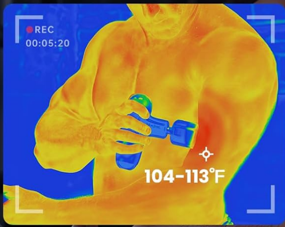
Figure 5: Thermal imaging effect demonstrating hot and cold therapy application.