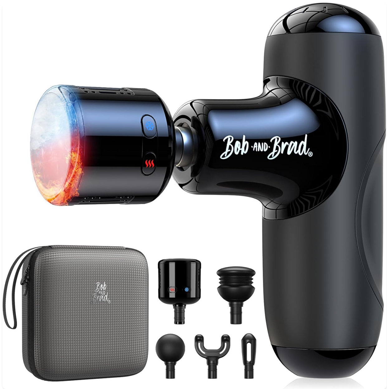
Figure 1: BOB AND BRAD Q2 Pro Mini Massage Gun with accessories.