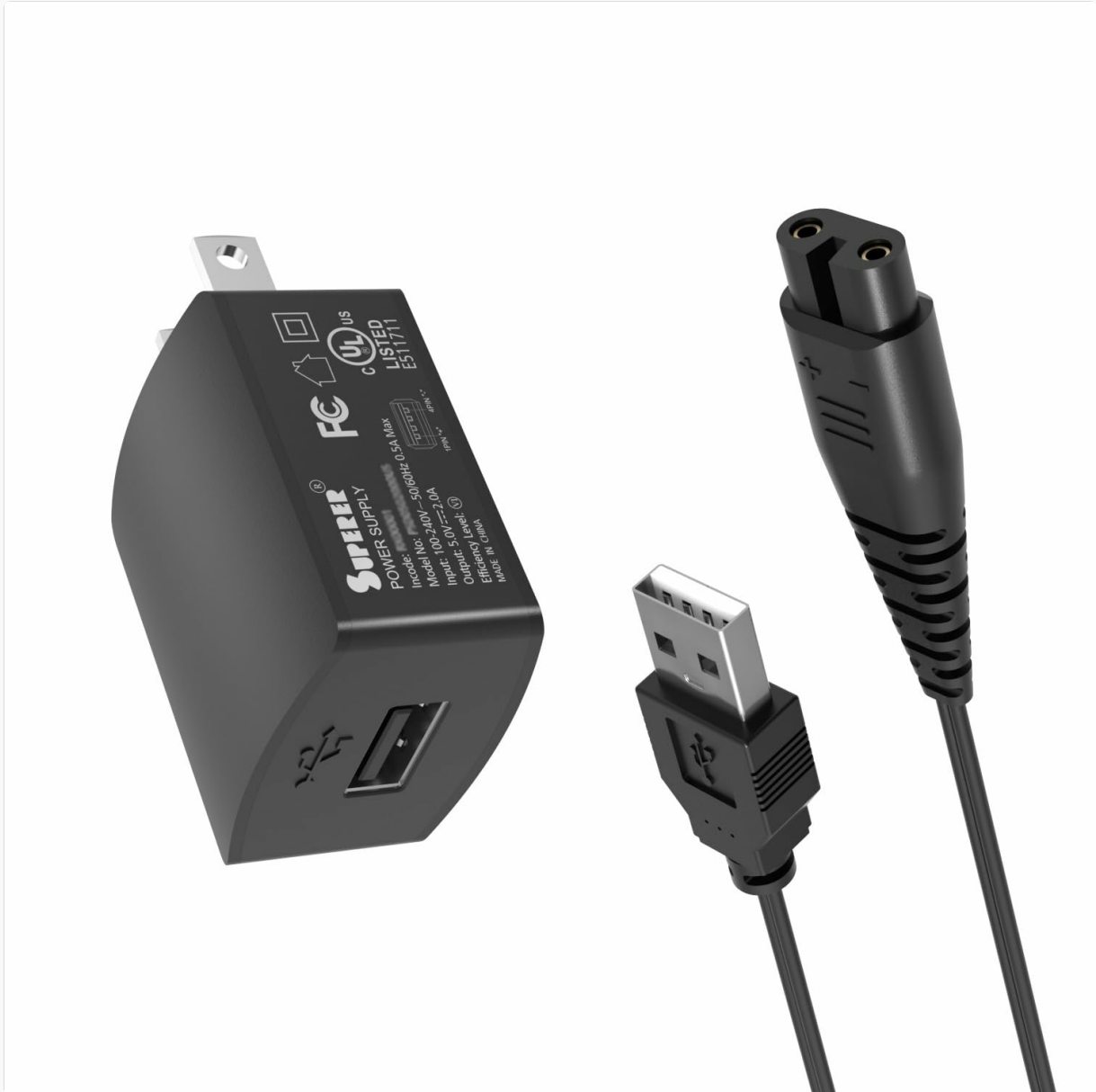
Image 2.1: Safety Certifications. This image displays the UL, FCC, and CE certification logos, indicating the product meets safety and regulatory standards.