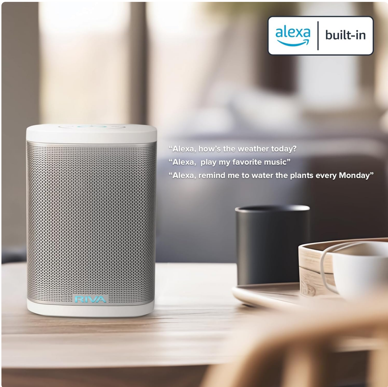
Image: Top view of the RIVA Concert speaker, highlighting the control buttons for volume, playback, and microphone. Text bubbles indicate example Alexa voice commands like "Alexa, how's the weather today?" and "Alexa, play my favorite music."

The top panel of your RIVA Concert speaker features intuitive controls for playback, volume, and voice assistant interaction.