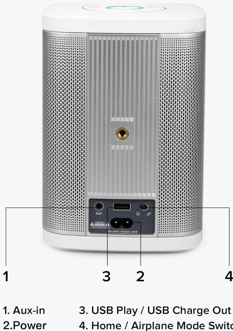
Image: Rear view of the RIVA Concert speaker, clearly showing the Aux-in port, Power input, USB Play / USB Charge Out 5V/2.1A port, and the Home / Airplane Mode Switch. A mounting screw thread is also visible.