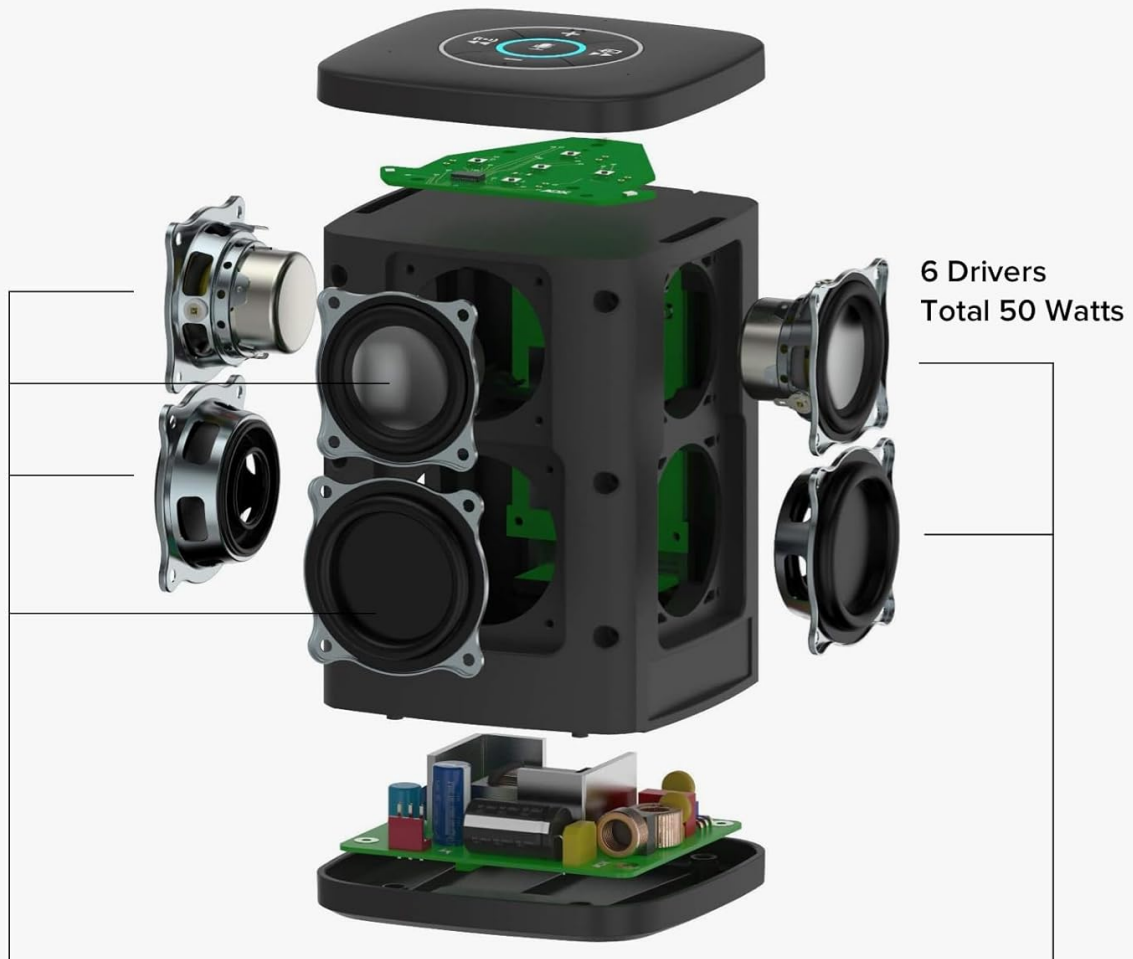
Image: An exploded internal view of the RIVA Concert speaker, illustrating the placement of its 6 drivers and highlighting its patented Trillium Audio Technology, delivering a total of 50 Watts of power.