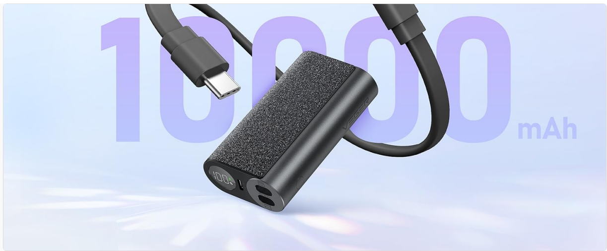
Image: A close-up view of the VEGER portable charger's digital display, clearly showing "100%" indicating a full charge. This display allows users to monitor the power bank's remaining battery life.