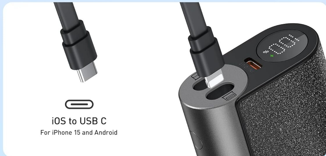
Image: A graphic illustrating the bidirectional nature of the built-in cable, showing how it can be used as a USB-C to iOS (Lightning) cable for older iPhones (up to iPhone 14) and as an iOS (Lightning) to USB-C cable for iPhone 15 and Android devices.