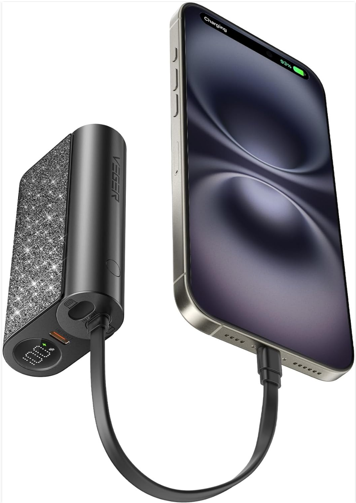
Image: The VEGER V1179 portable charger in black, connected via its built-in cable to a smartphone, displaying a charge percentage. The charger features a sparkling texture on one side and a digital display showing the battery level.

Your browser does not support the video tag.