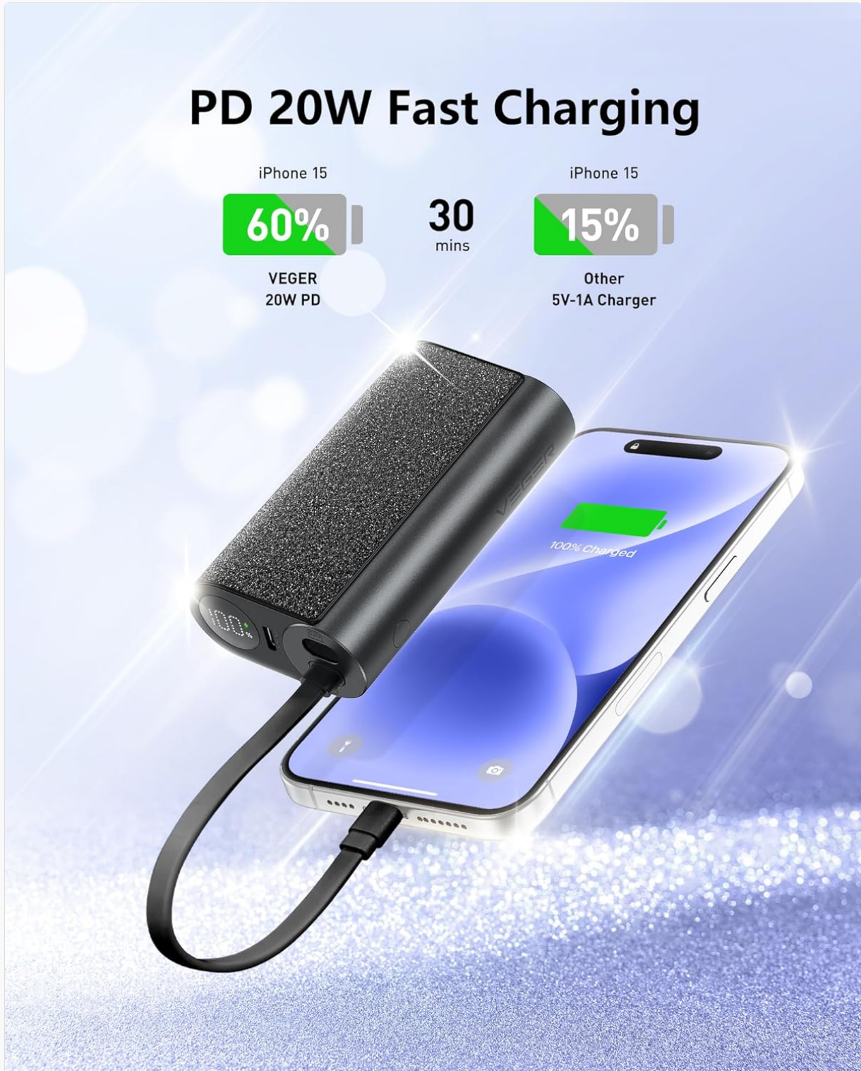
Image: The VEGER portable charger connected to an iPhone 15, illustrating its 20W PD fast charging capability, showing a 60% charge in 30 minutes compared to 15% with a standard 5V-1A charger.

The 20W Power Delivery (PD) fast charging feature allows for rapid charging of compatible devices, such as an iPhone 15 to 60% in approximately 30 minutes.