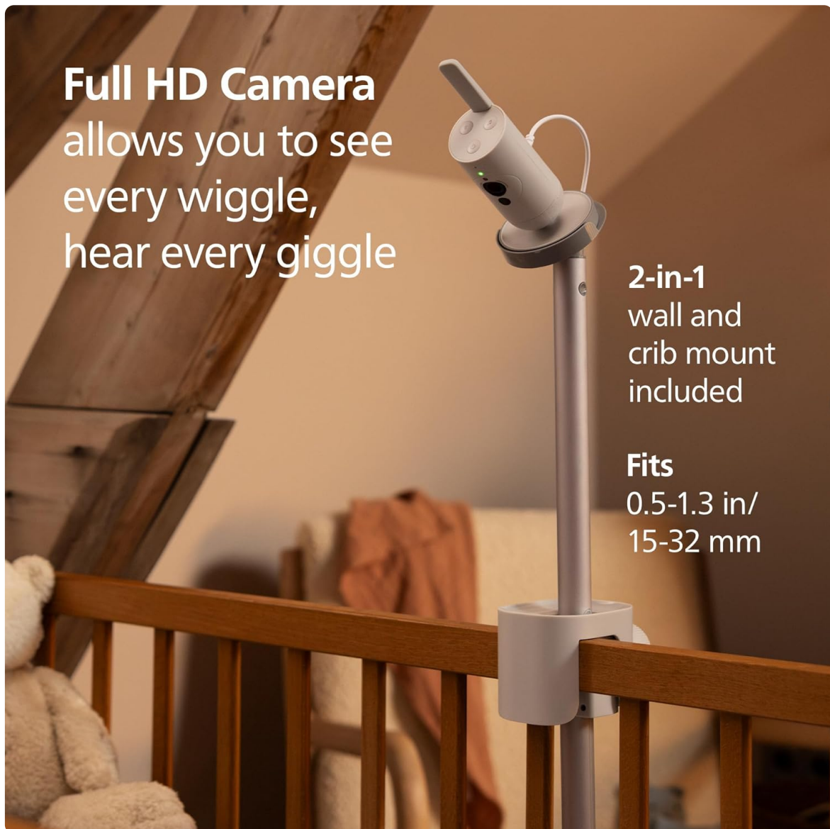
Image: The baby unit camera securely mounted to a crib, providing a clear view of the baby.