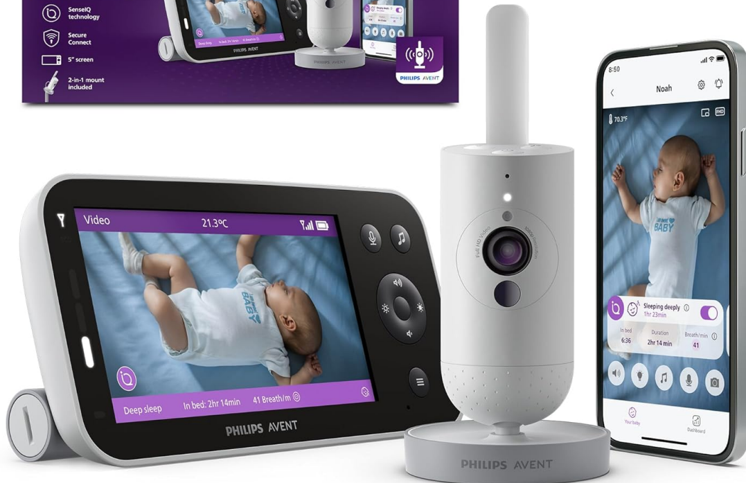
Image: The Philips Avent Premium Connected Baby Monitor system, including the baby unit, parent unit, and a smartphone displaying the companion app.