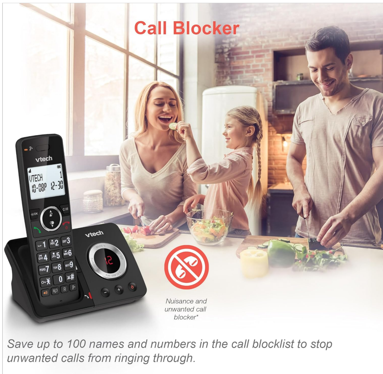
Image: The VTech ES2051 DECT Cordless Phone base unit and handset are shown with a graphic indicating the 'Call Blocker' feature, emphasizing its ability to block nuisance and unwanted calls.