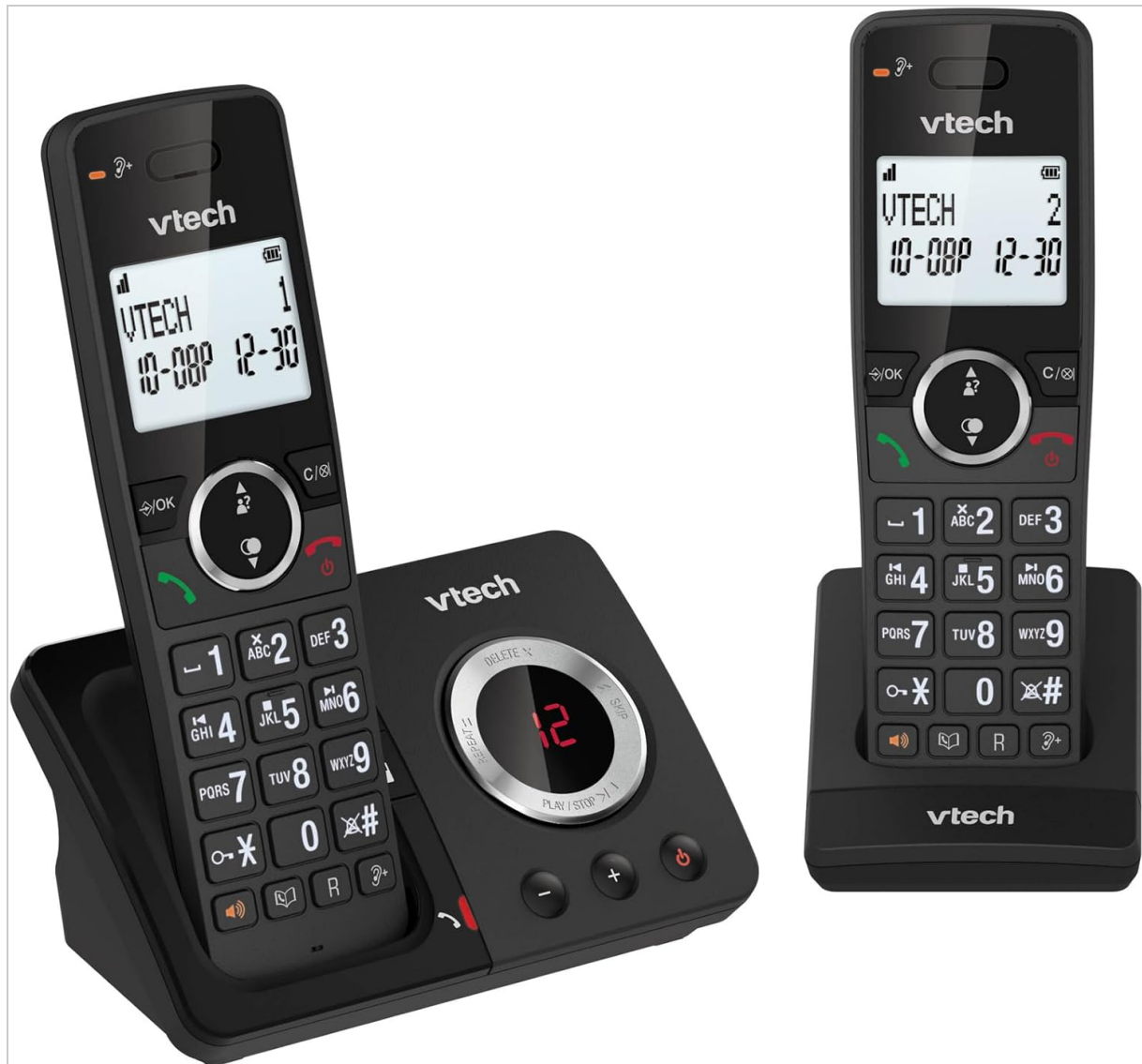
Image: The VTech ES2051 DECT Cordless Phone system, showing the main base unit with one handset docked, and a second handset with its charging cradle. This illustrates the twin handset setup.

illuminate. For optimal battery performance, charge the handsets for at least 16 hours before initial use.