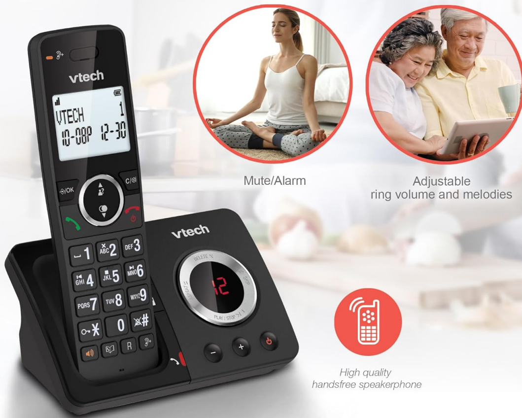
Image: The VTech ES2051 DECT Cordless Phone is shown with icons representing its easy, one-touch features, including Mute/Alarm, adjustable ring volume, and handsfree speakerphone.