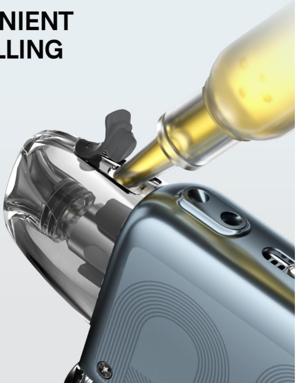
Figure 4: Illustrates the convenient top-filling method for the Argus P2 pod cartridge.