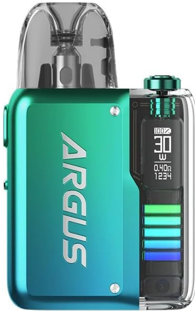
Figure 1: The VOOPOO Argus P2 Pod Kit in Neon Blue, showcasing its compact design and integrated pod.