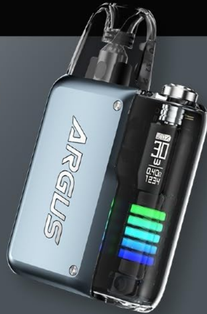
Figure 5: Display illustrating the Power Mode interface for precise wattage adjustment.