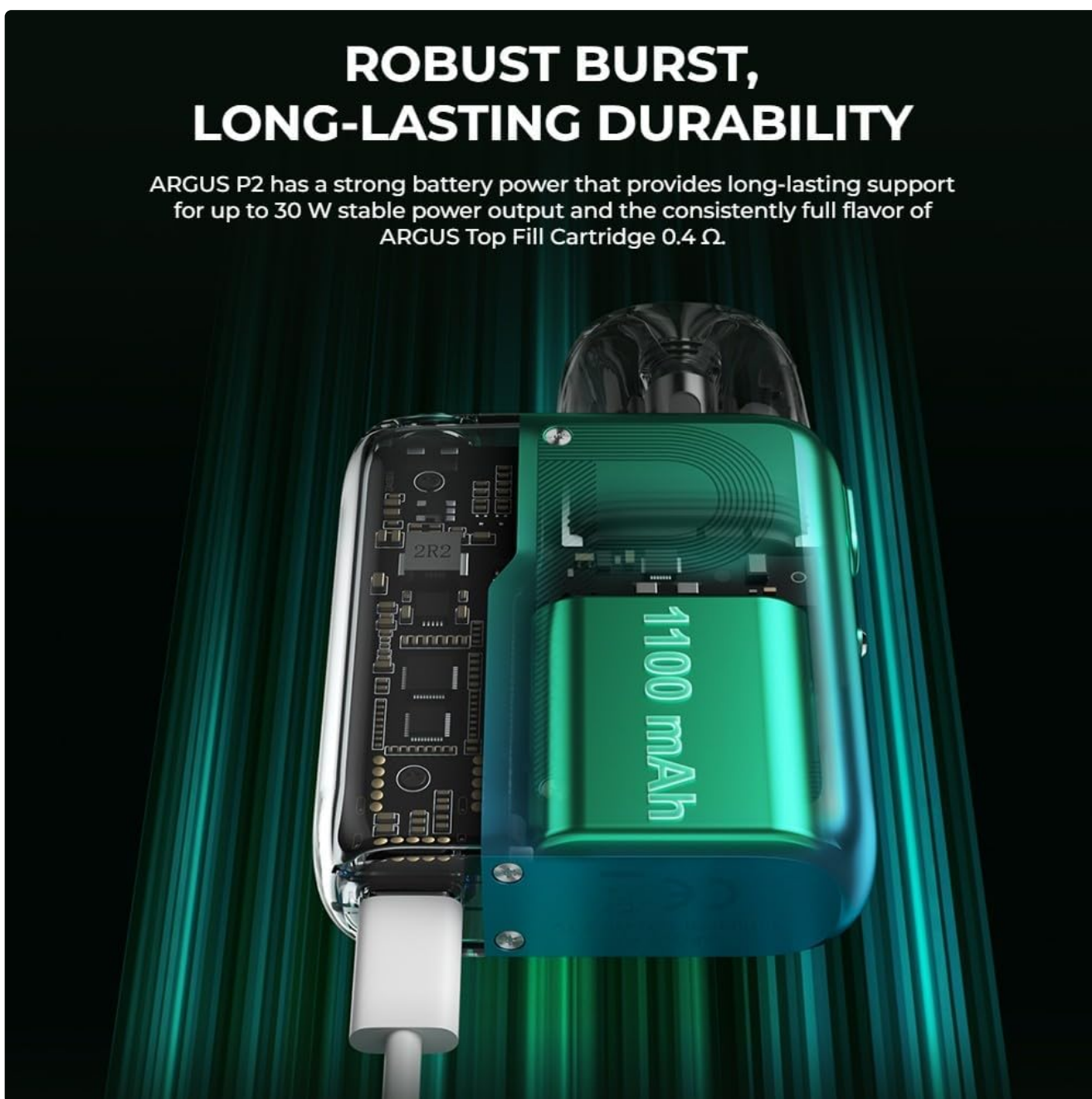
Figure 3: Internal view of the Argus P2 highlighting the 1100mAh battery and USB-C charging port.

Before first use, fully charge the Argus P2 device. Connect the USB-C cable to the device's charging port and the other end to a suitable USB power source (e.g., computer, wall adapter). The OLED screen will indicate charging status. The 1100mAh battery ensures long-lasting use.