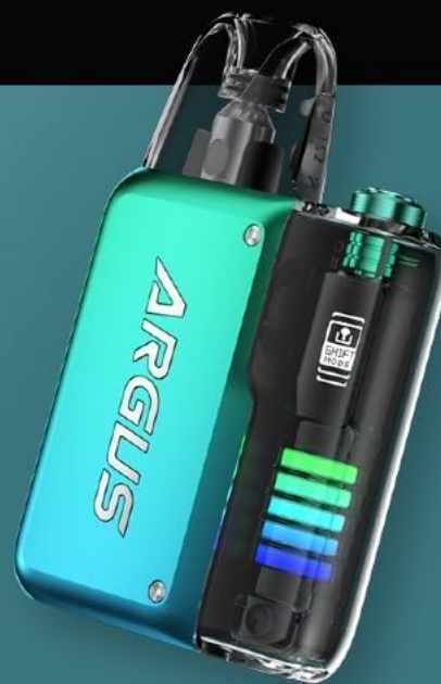
Figure 6: Display illustrating the Shift Mode interface with SPT, NOR, and ECO options.

ECO: Reducing power and e-liquid consumption