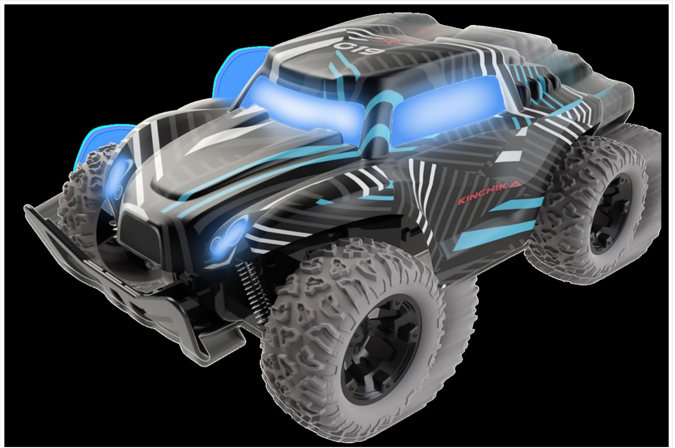
Image: The KOO Be Blip Kinchika RC car with its distinctive LED lights glowing, highlighting its design and operational feature.