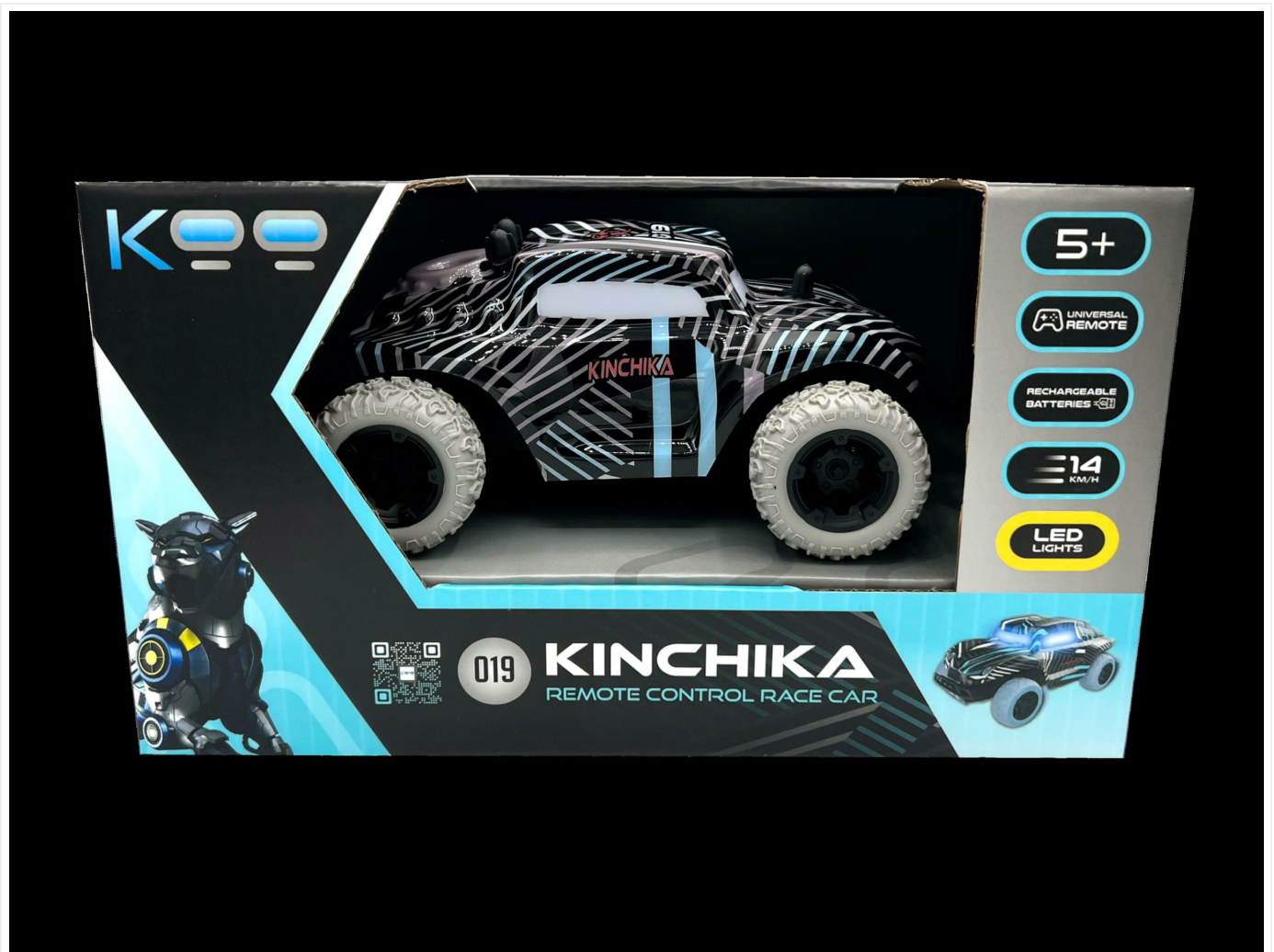
Image: The KOO Be Blip Kinchika Remote Control Car displayed in its retail box, showing the car's design and key features on the packaging.