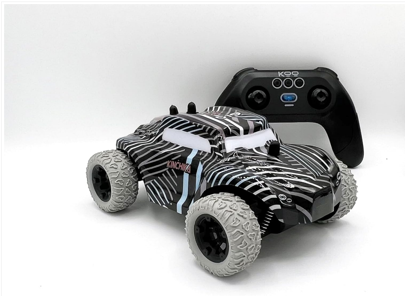
Image: The KOO Be Blip Kinchika RC car positioned next to its remote control, illustrating the two main components of the product.