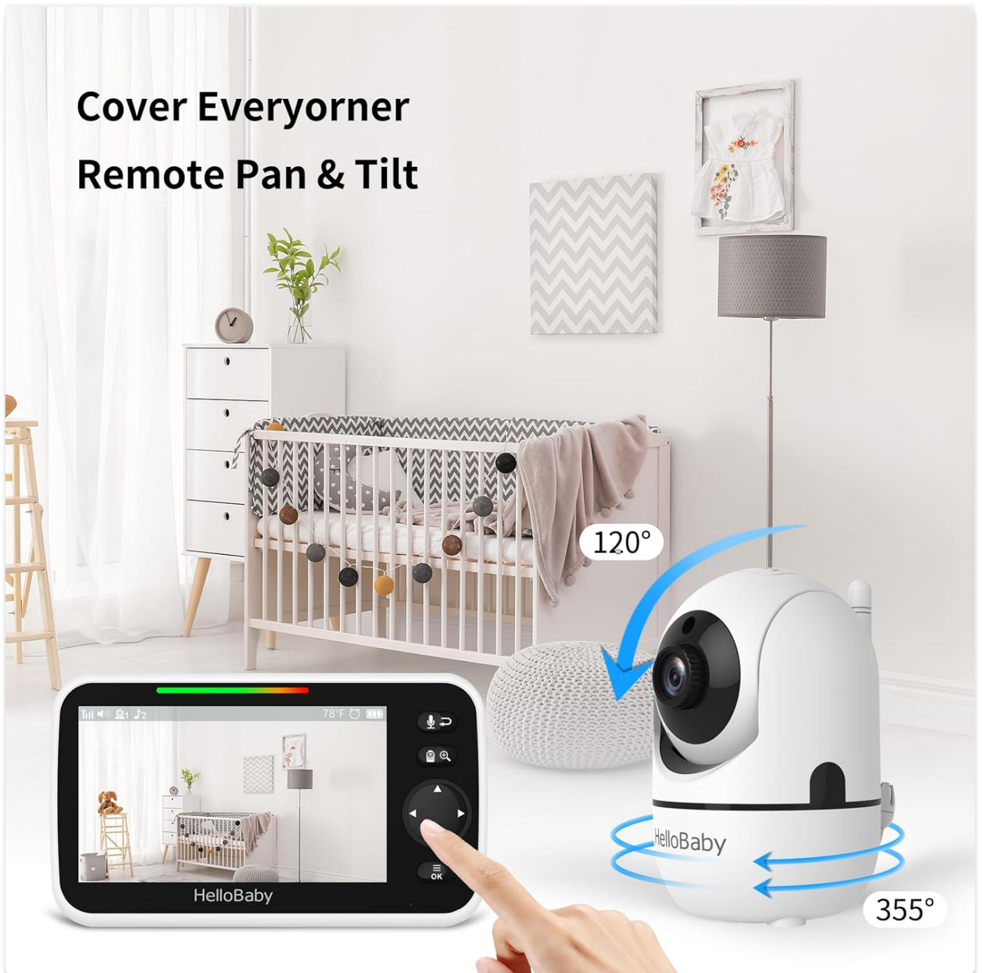
Figure 4: Remote Pan & Tilt functionality, enabling comprehensive room coverage.