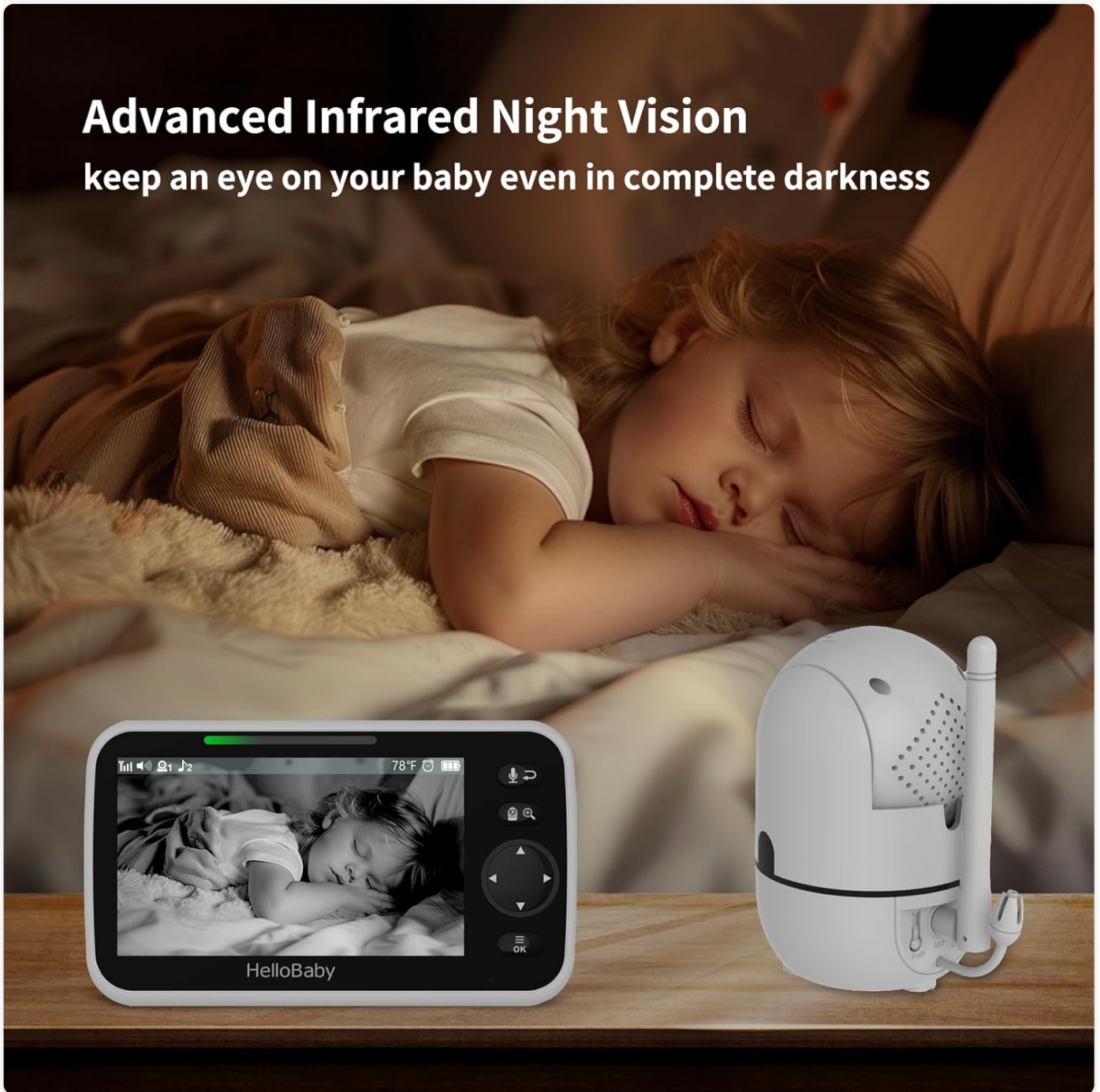
Figure 6: Advanced Infrared Night Vision ensures clear monitoring in dark environments.