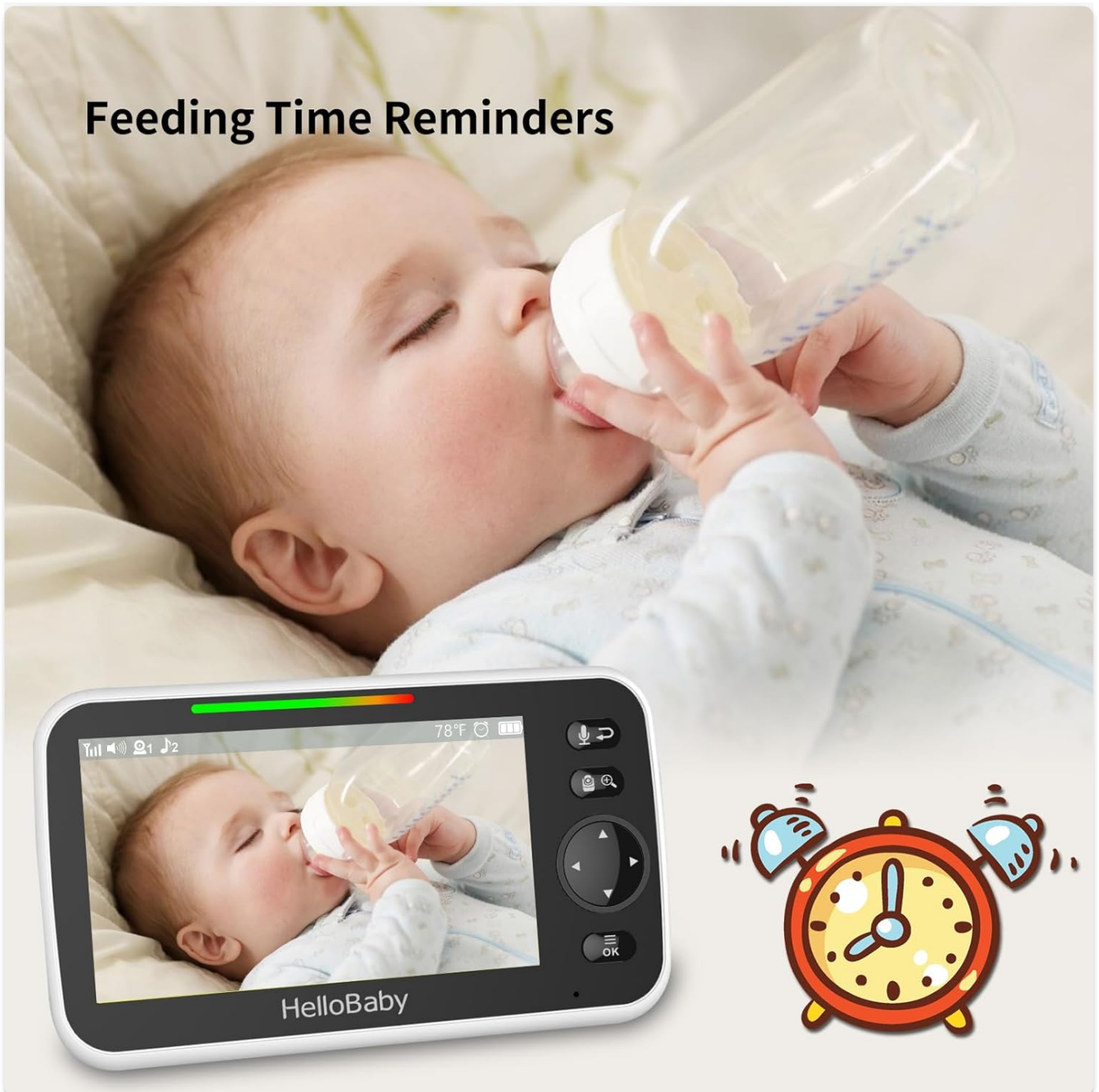
Figure 7: Feeding Time Reminders feature to assist with baby's schedule.