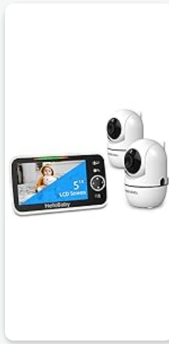
Figure 2: Illustration of connecting the camera and monitor to power sources.