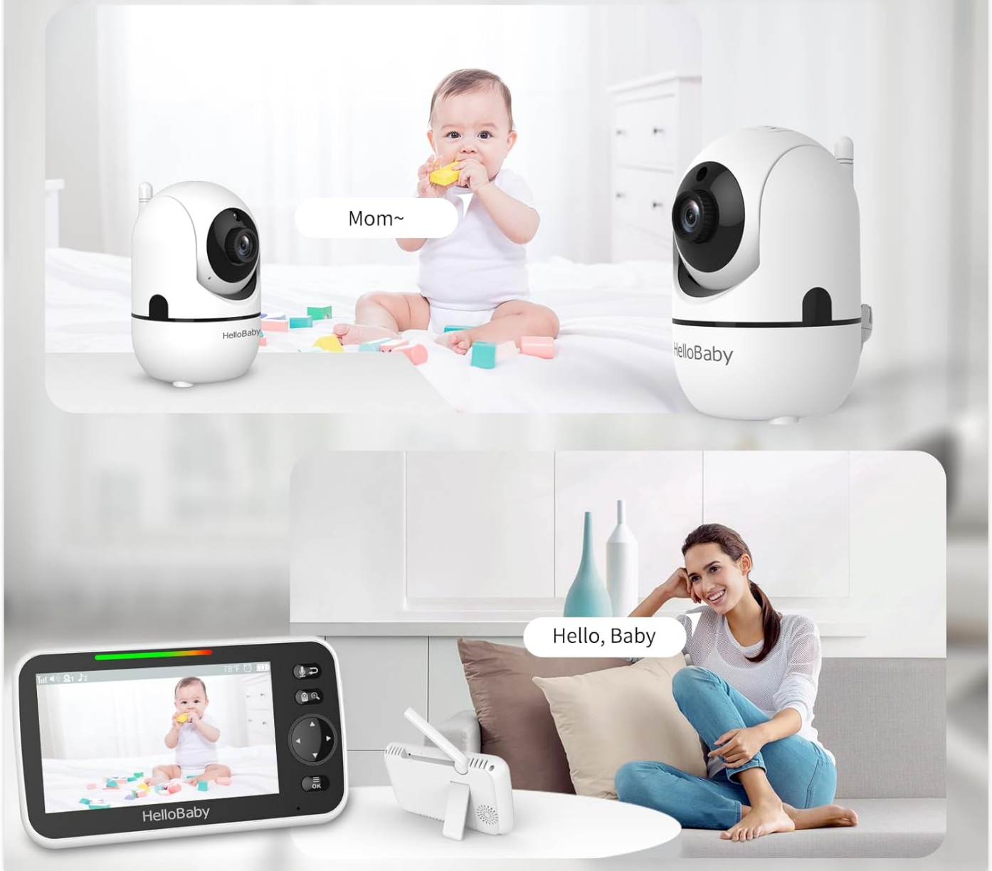
Figure 5: Clear Two-way Audio feature, allowing parents to talk to their baby.