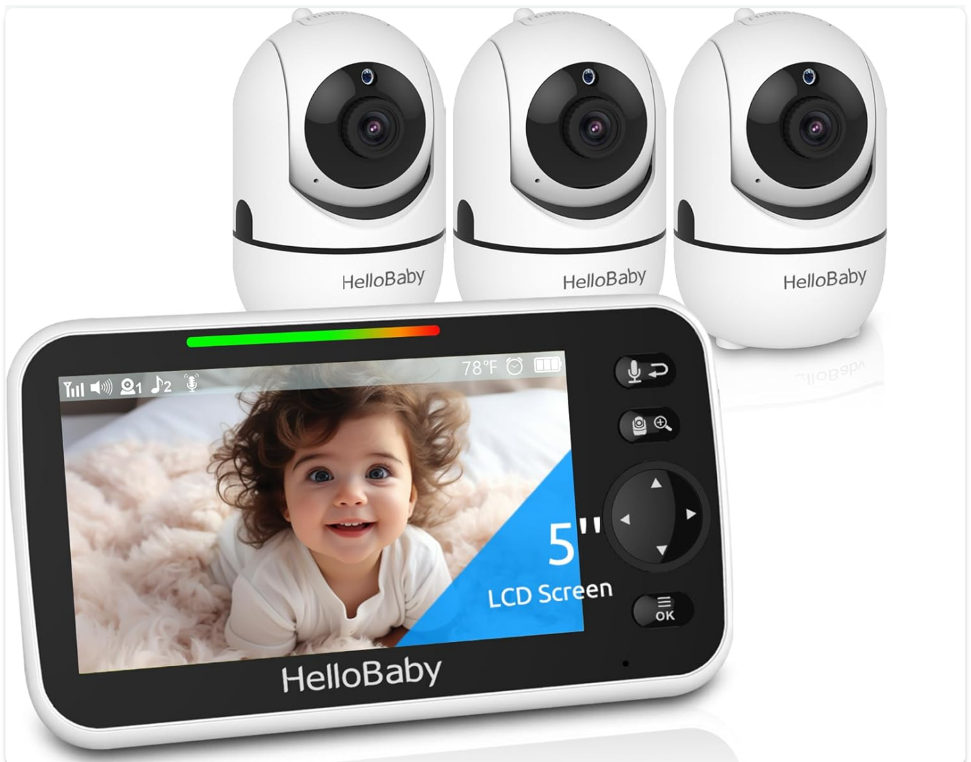
Figure 1: HelloBaby HB6550 Baby Monitor system, showing the parent unit and three camera units.