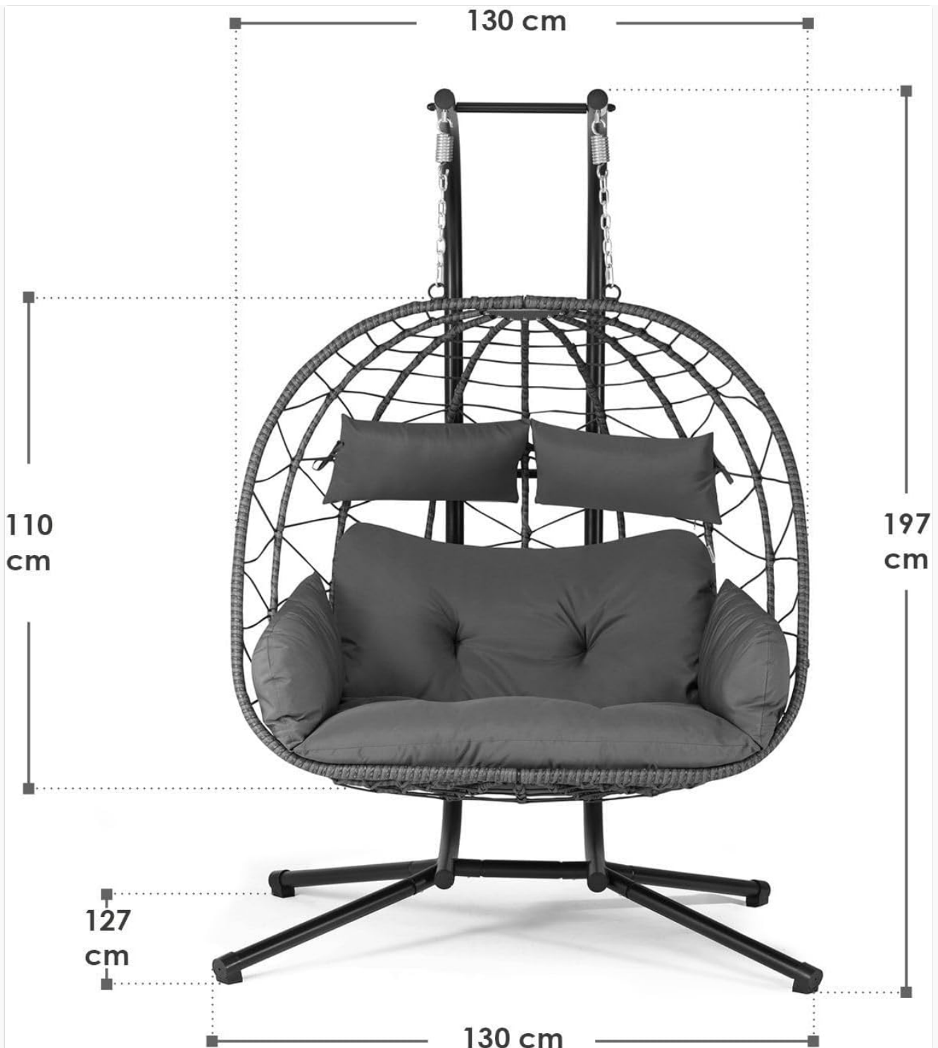
Image: Detailed dimensions of the Juskys Aria Double Hanging Chair, showing width, depth, and height measurements.