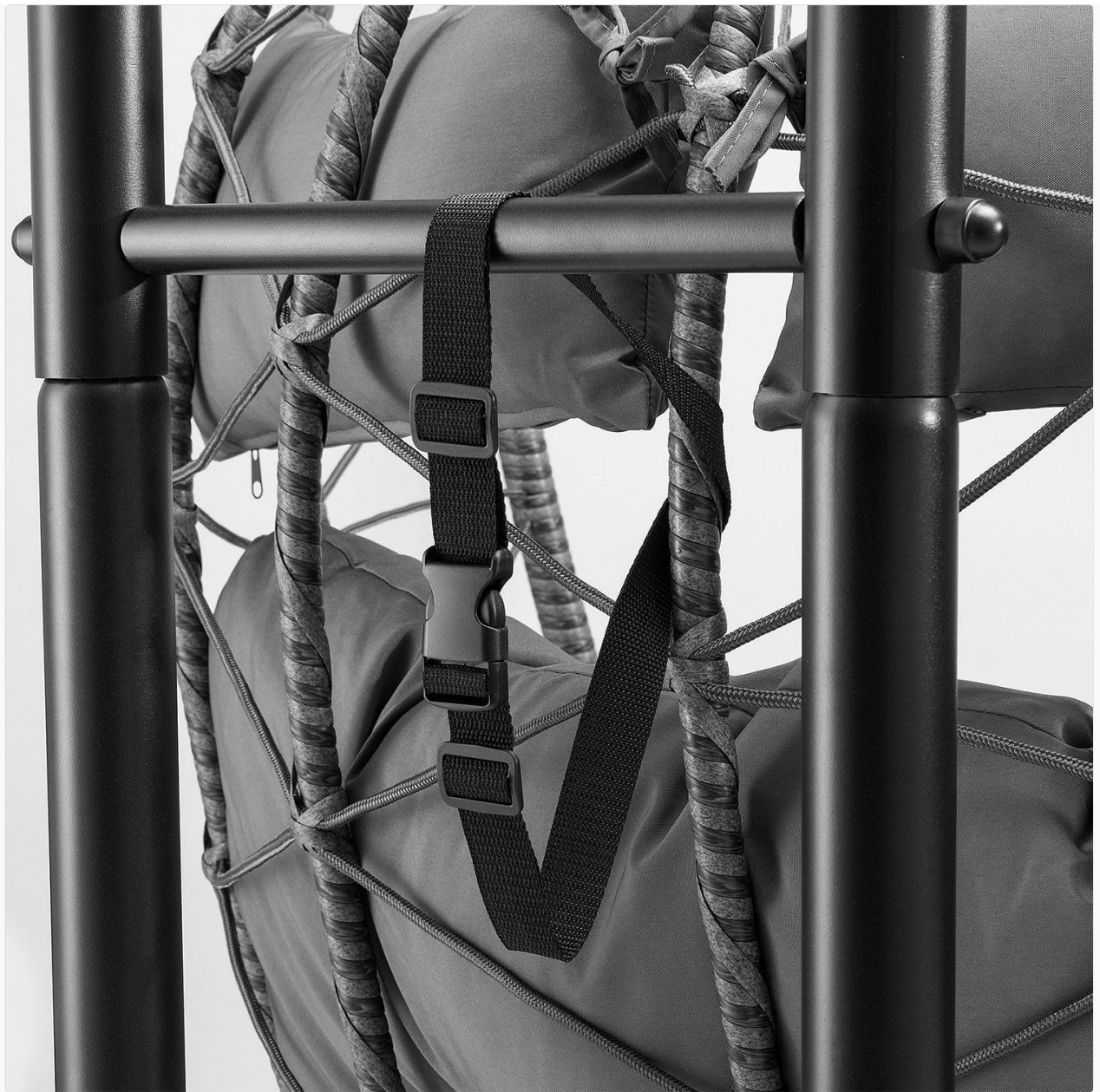
Image: Detail of the cushion attachment strap for securing cushions within the basket.