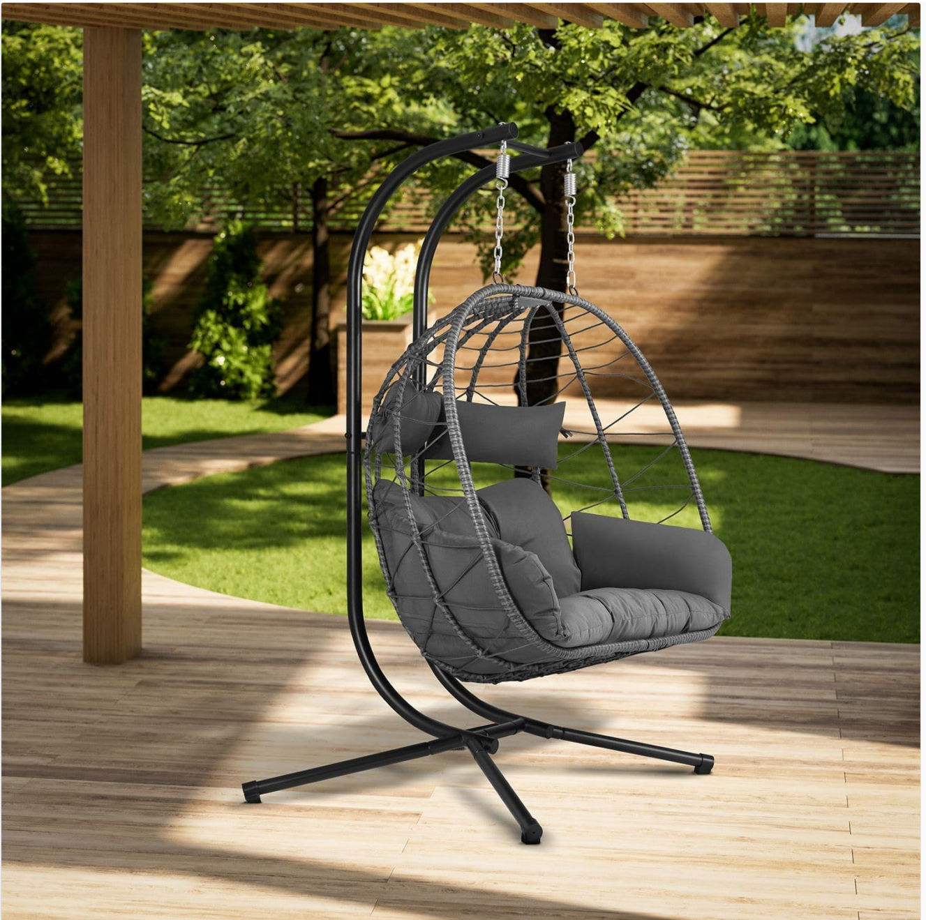
Image: The Juskys Aria Double Polyrattan Hanging Chair fully assembled in an outdoor environment.