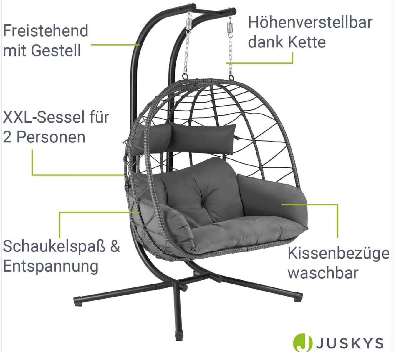
Image: Diagram illustrating key features such as freestanding design, XXL size for two, comfortable swinging, washable cushion covers, and height adjustability.