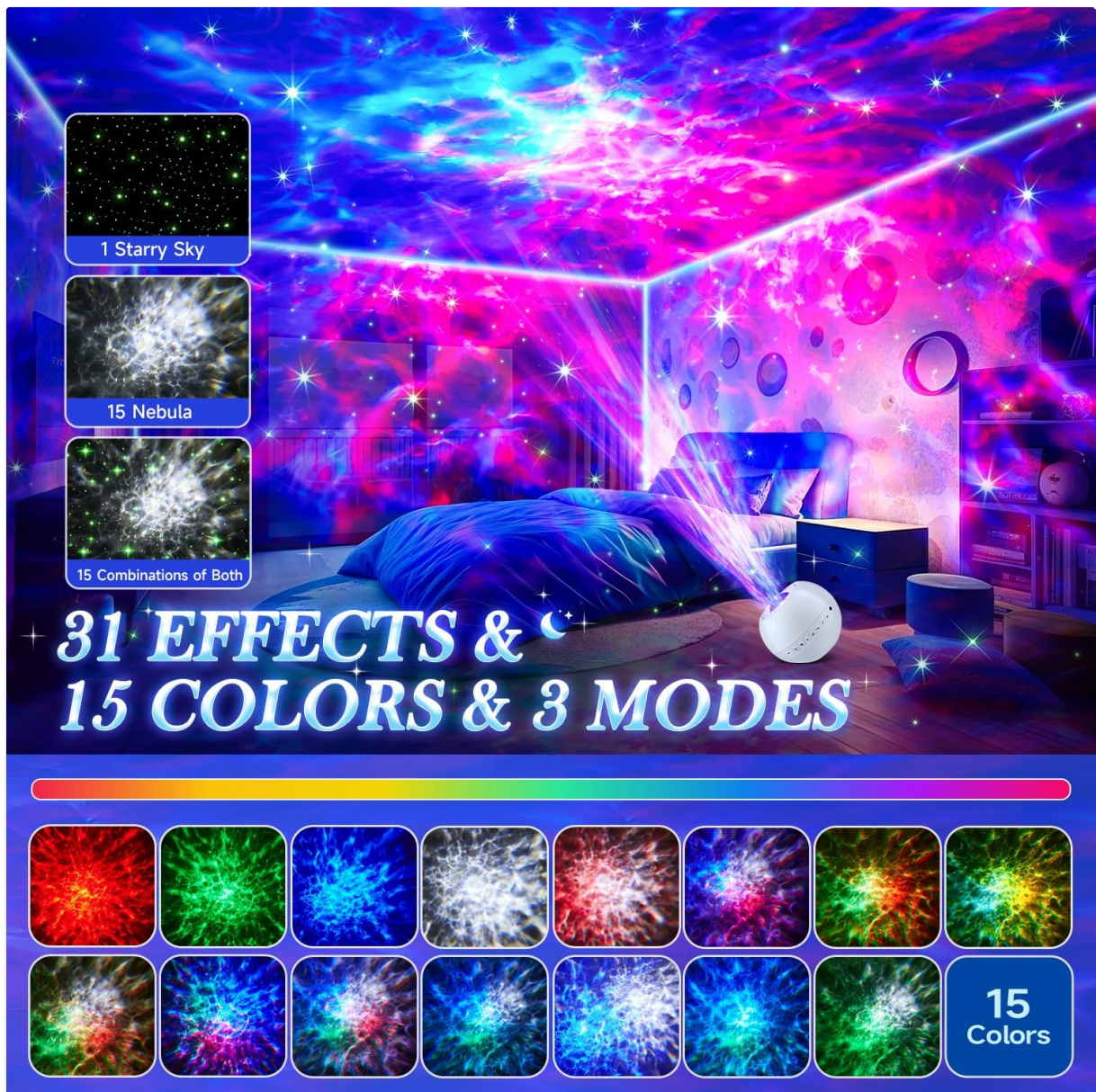
Image: Example of galaxy and star projection in a room.

Video: Demonstration of 15 colors and 15 white noise options for the galaxy projector.