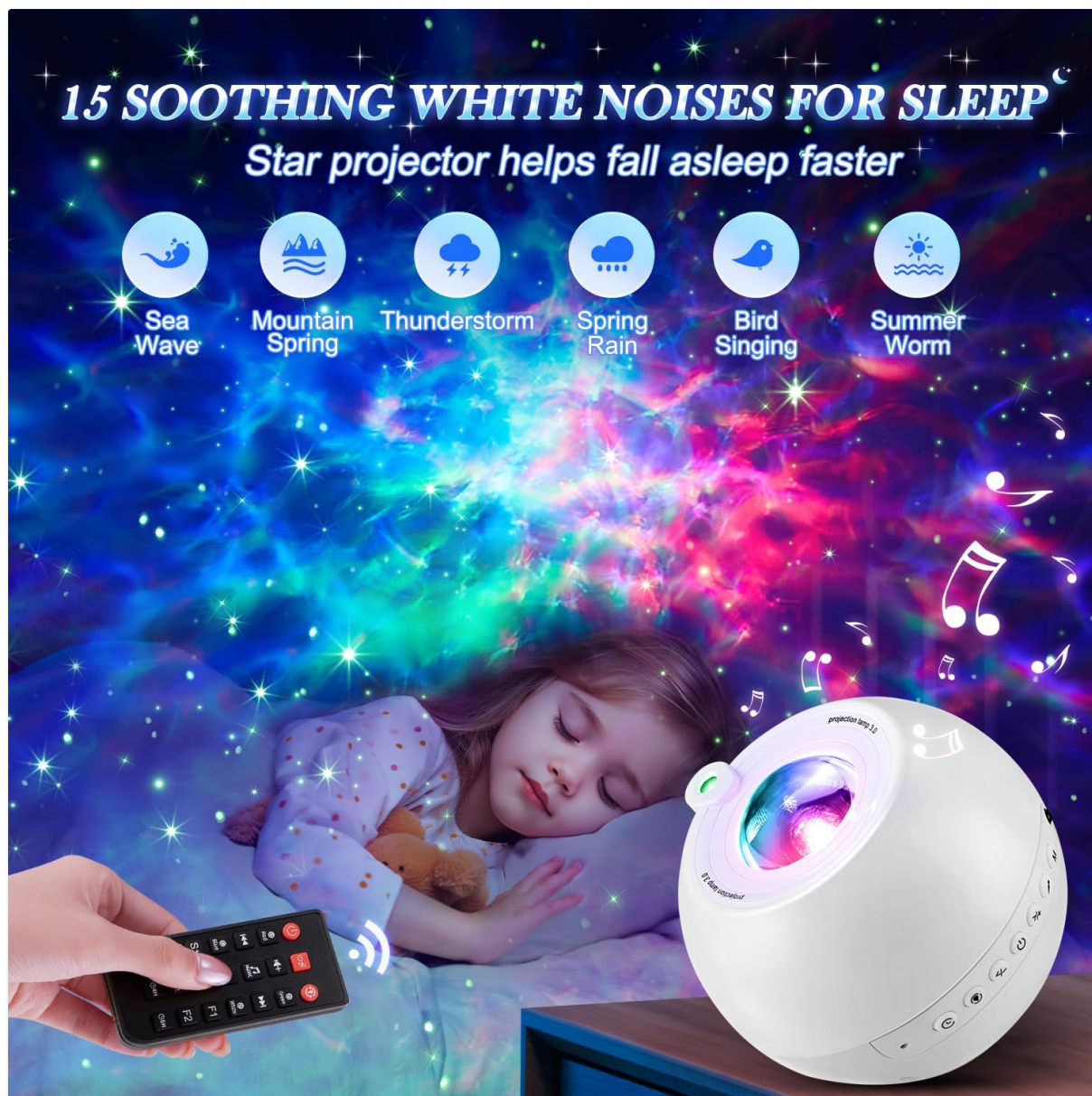
Image: White noise feature for sleep and relaxation.