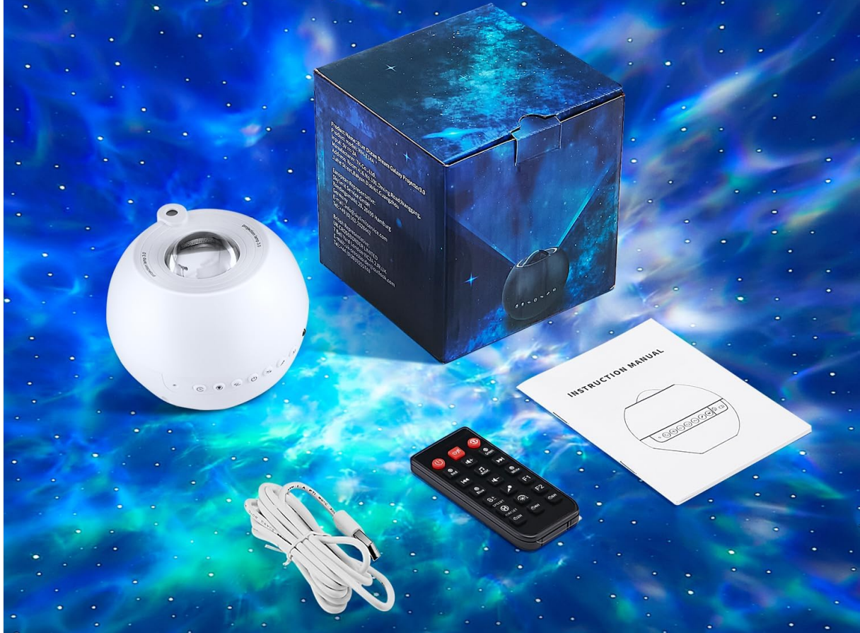
Image: Package contents including the projector, remote, USB cable, and manual.