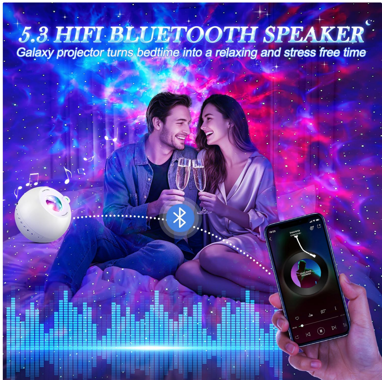
Image: Bluetooth speaker function in use with music playback.