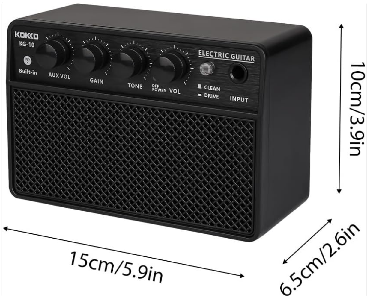
The summina KG-10 Guitar Amplifier with its physical dimensions indicated.