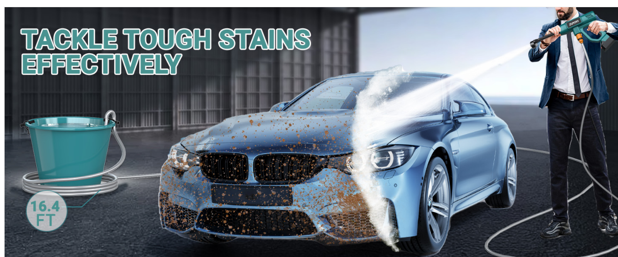
Image: Cordless pressure washer tackling tough stains on a car.

Video: Demonstration of how to use the cordless pressure washer for various cleaning tasks.