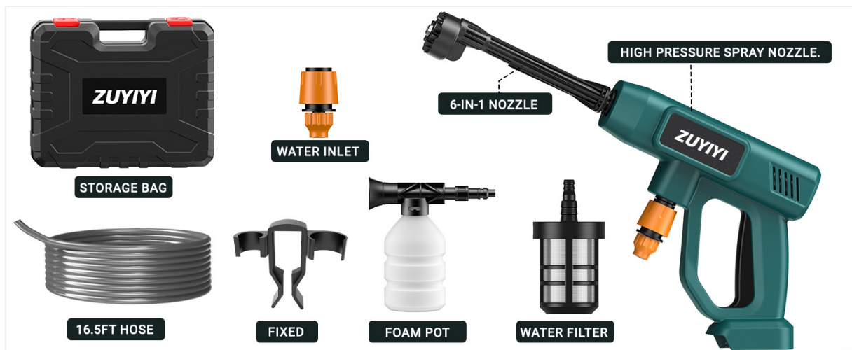
Image: All components included in the package.

Note: Batteries are not included with the bare tool package.