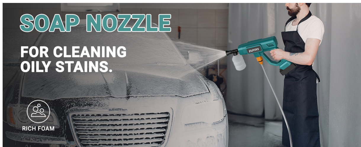
Image: Using the soap nozzle for cleaning.