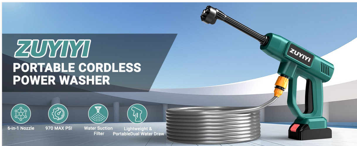
Image: ZUYIYI Portable Cordless Power Washer overview.

Thank you for choosing the ZUYIYI Cordless Pressure Washer. This portable power cleaner is designed for efficient and convenient cleaning tasks, compatible with Makita 18V lithium-ion batteries (not included). It offers a maximum water pressure of 970 PSI and a 32.8-foot spray distance, making it suitable for various applications without the need for cords or outlets.