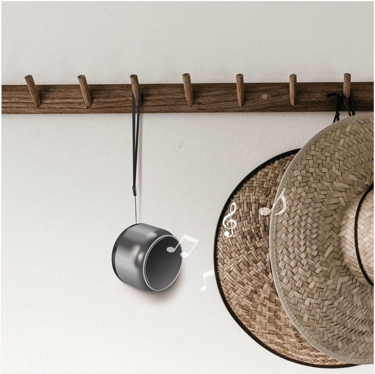
Image: The speaker hanging by its wrist strap, demonstrating its portability.