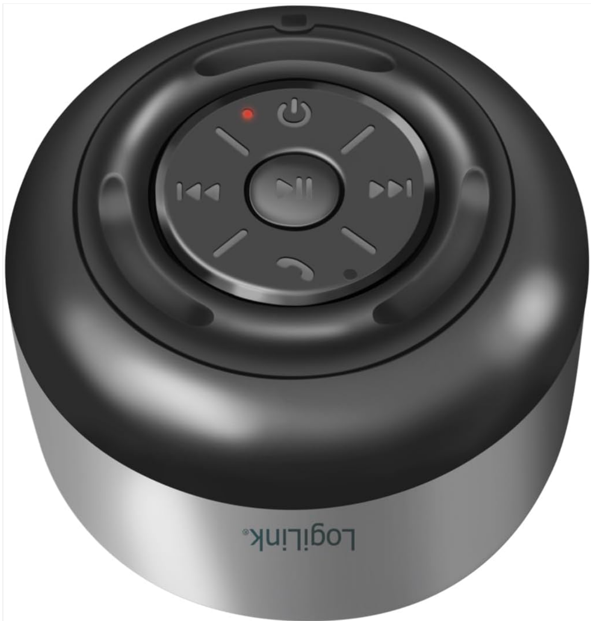
Image: Top view of the speaker showing the control buttons. These buttons allow you to manage power, playback, and calls.