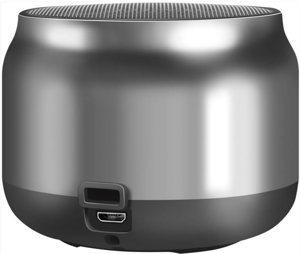
Image: Back view of the speaker, highlighting the Micro USB charging port.