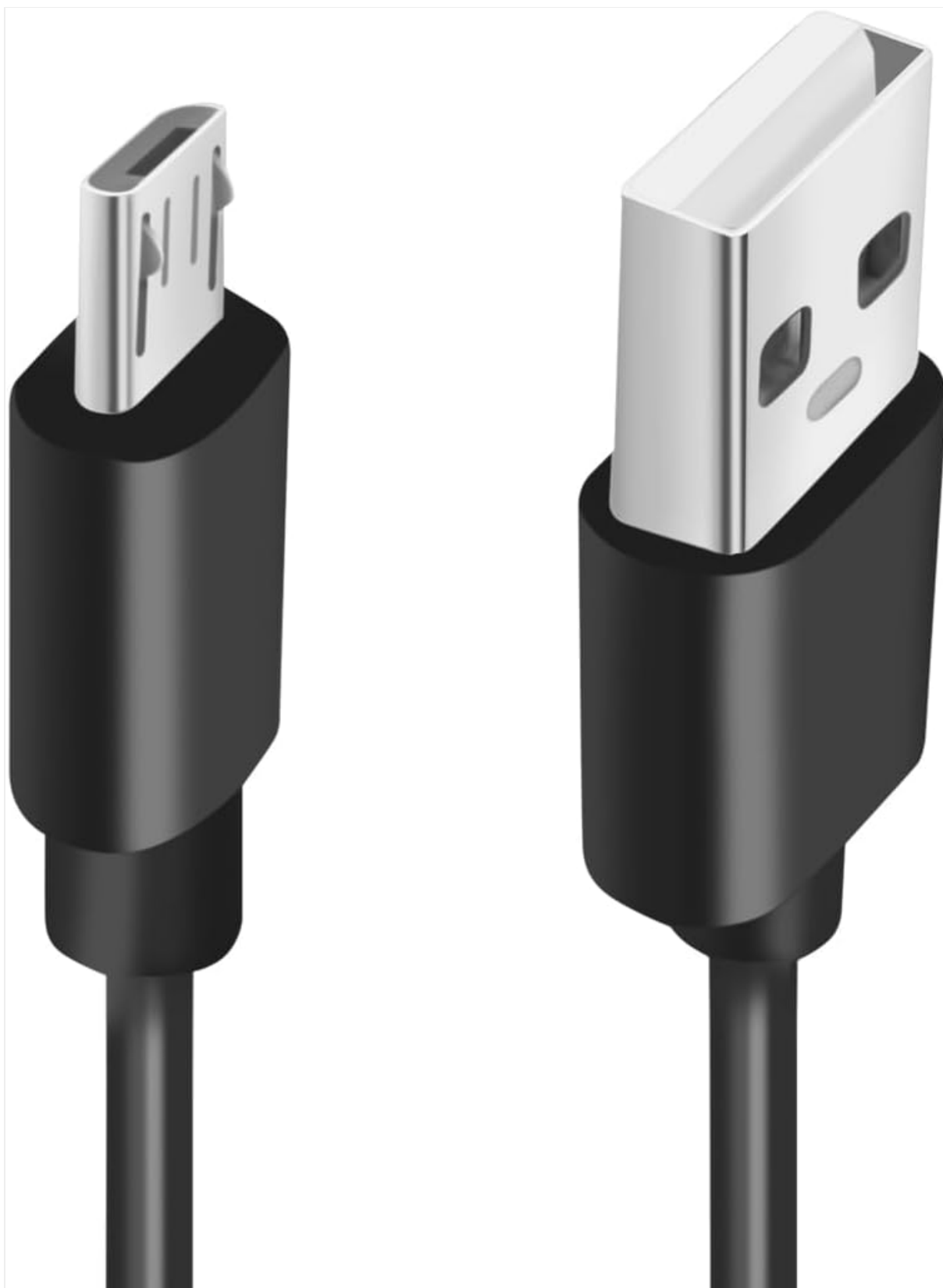
Image: Micro USB Charging Cable for charging the speaker.