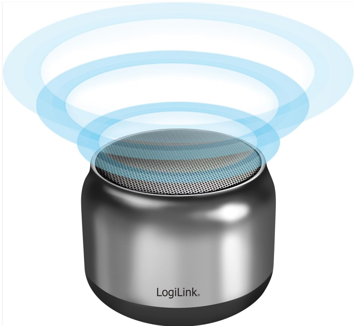
Image: The LogiLink SP0063 speaker actively playing music, indicated by sound waves.