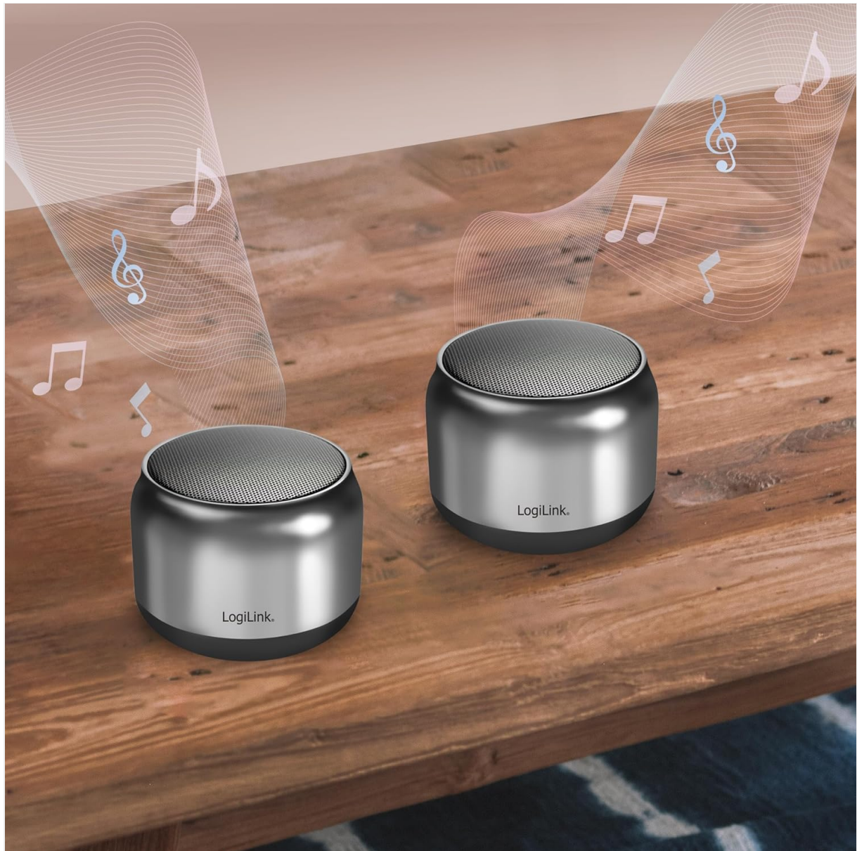
Image: Two LogiLink SP0063 speakers connected via True Wireless Stereo (TWS) for a richer audio experience.

To pair two LogiLink SP0063 speakers for a stereo sound experience: