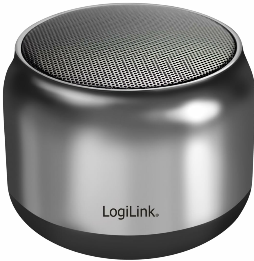
Image: The LogiLink SP0063 Bluetooth speaker on a table, emitting sound waves.