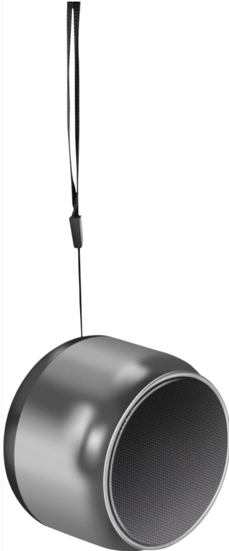
Image: The included wrist strap for easy portability.