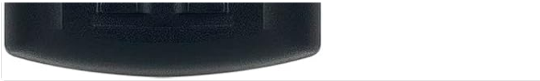
Figure 2.3: Back view of the VINABTY AKB36097101 remote control with the battery compartment cover removed, showing the two AAA battery slots.