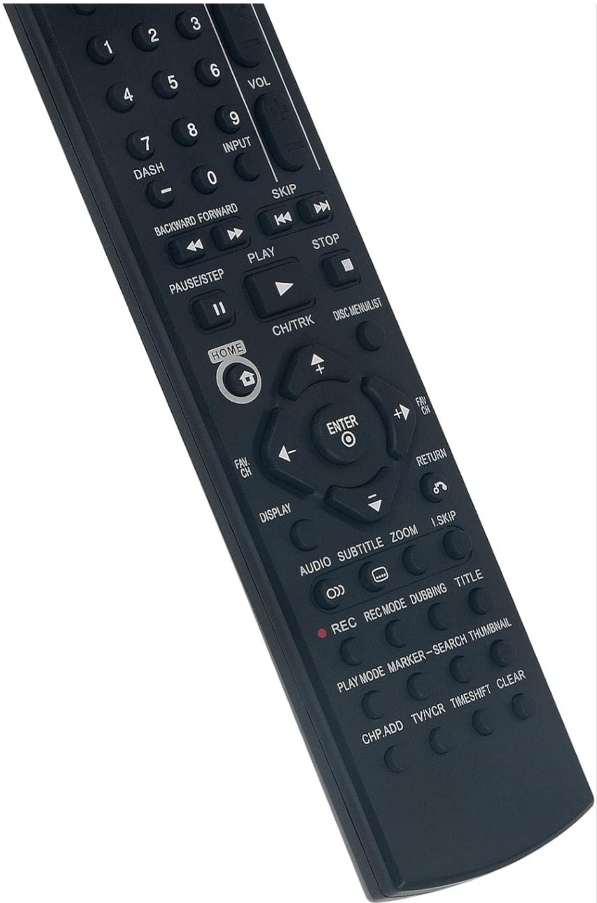
Figure 2.2: Angled view of the VINABTY AKB36097101 remote control, highlighting its ergonomic design and button placement.