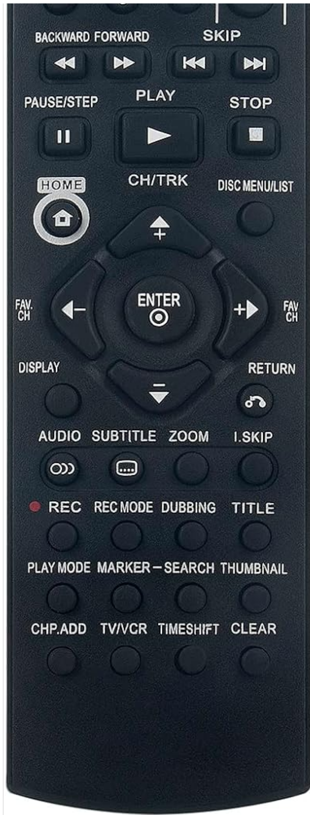
Figure 2.1: Front view of the VINABTY AKB36097101 remote control, showing all buttons and their labels. The remote is black with white and blue text.