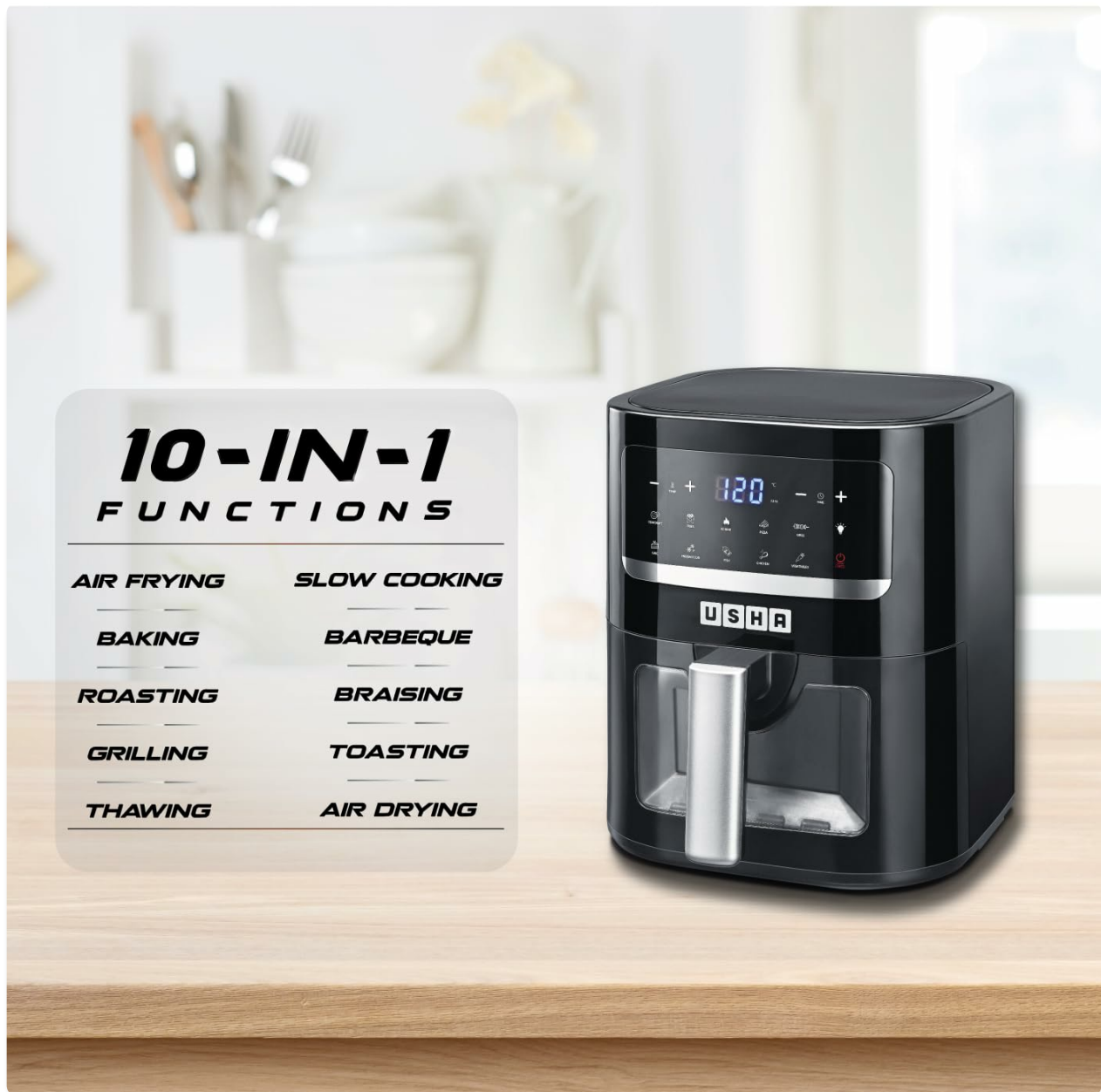
Image 4.1: Visual representation of the 10-in-1 functions available on the air fryer.