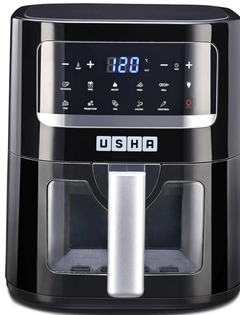
Image 3.1: Front view of the USHA Ichef Smart Air Fryer 4.5L, showcasing its sleek black design, digital display, and transparent window.

The USHA Ichef Smart Air Fryer is designed for versatile cooking with ease. Familiarize yourself with its main components: