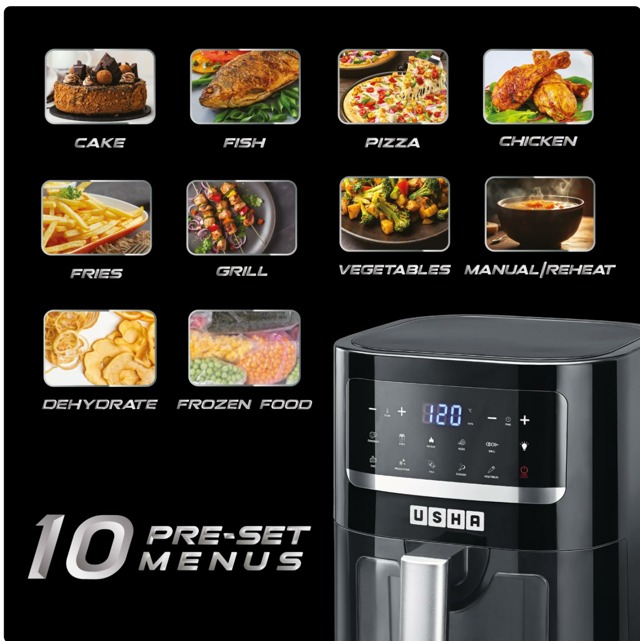
Image 4.2: Display of the 10 pre-set menus for various food types.