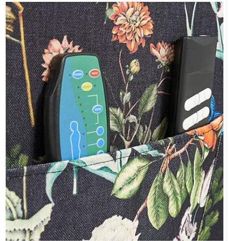
Storage Pockets on Both Sides