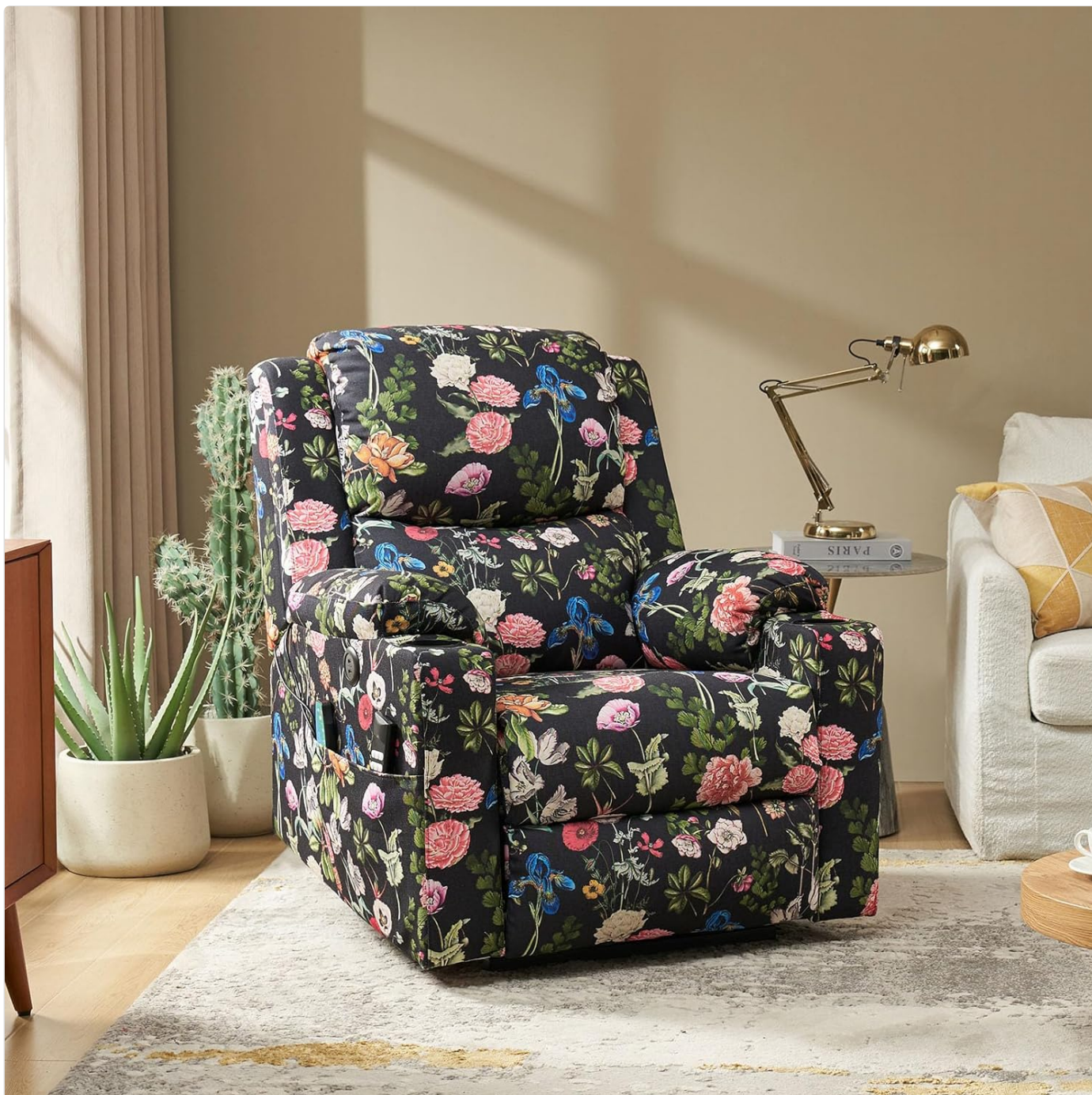
Image: Depicts the chair's massage zones and the remote used to control massage modes and lumbar heating.