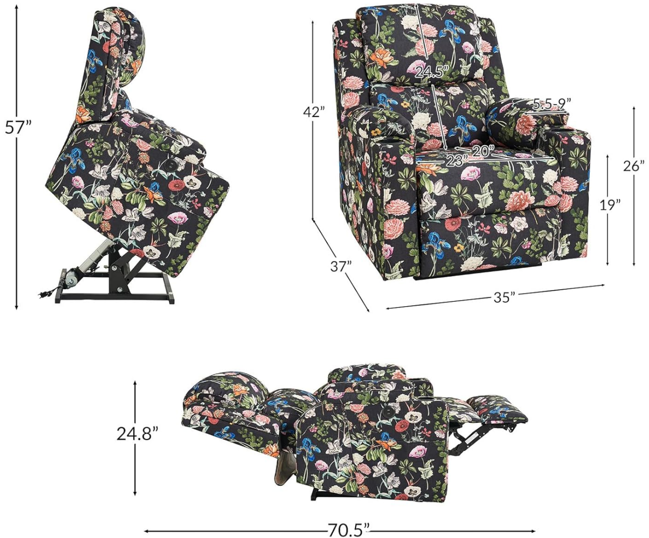
Image: Detailed product dimensions including height, width, depth, and seat measurements.