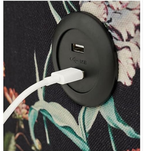
Built-in USB Ports