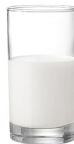
Keep drinks warmer