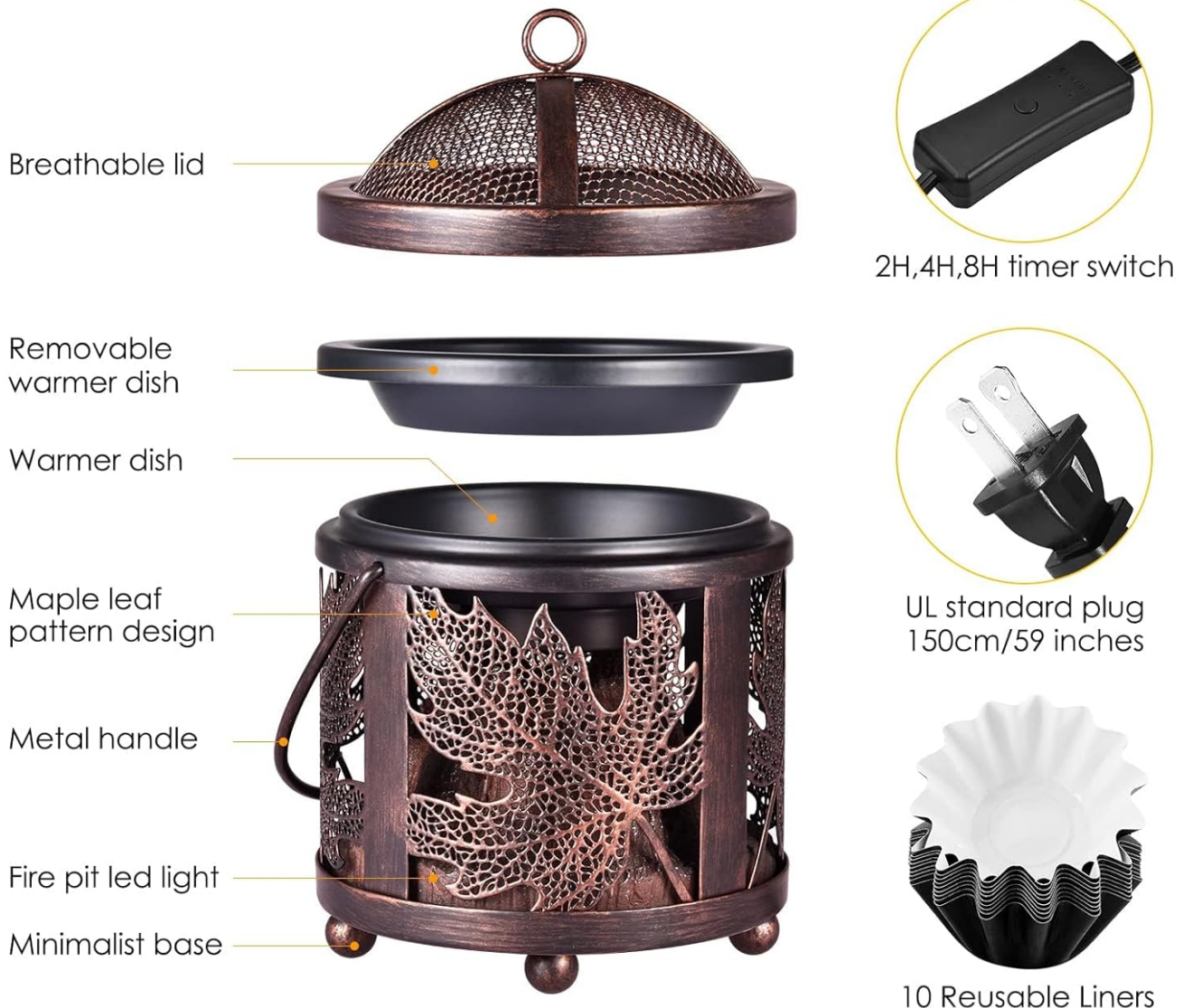
Image Description: An exploded view diagram showing the various components of the airnasa Electric Wax Melt Warmer. From top to bottom, it displays the breathable lid, a removable warmer dish, the main warmer base with a maple leaf pattern and a fire pit LED light, a metal handle, and a minimalist base. To the right, the power cord with a 2/4/8H timer switch and a UL standard plug are shown, along with a stack of 10 reusable wax melt liners.

Add 10 reusable Liners Removable warmer dish