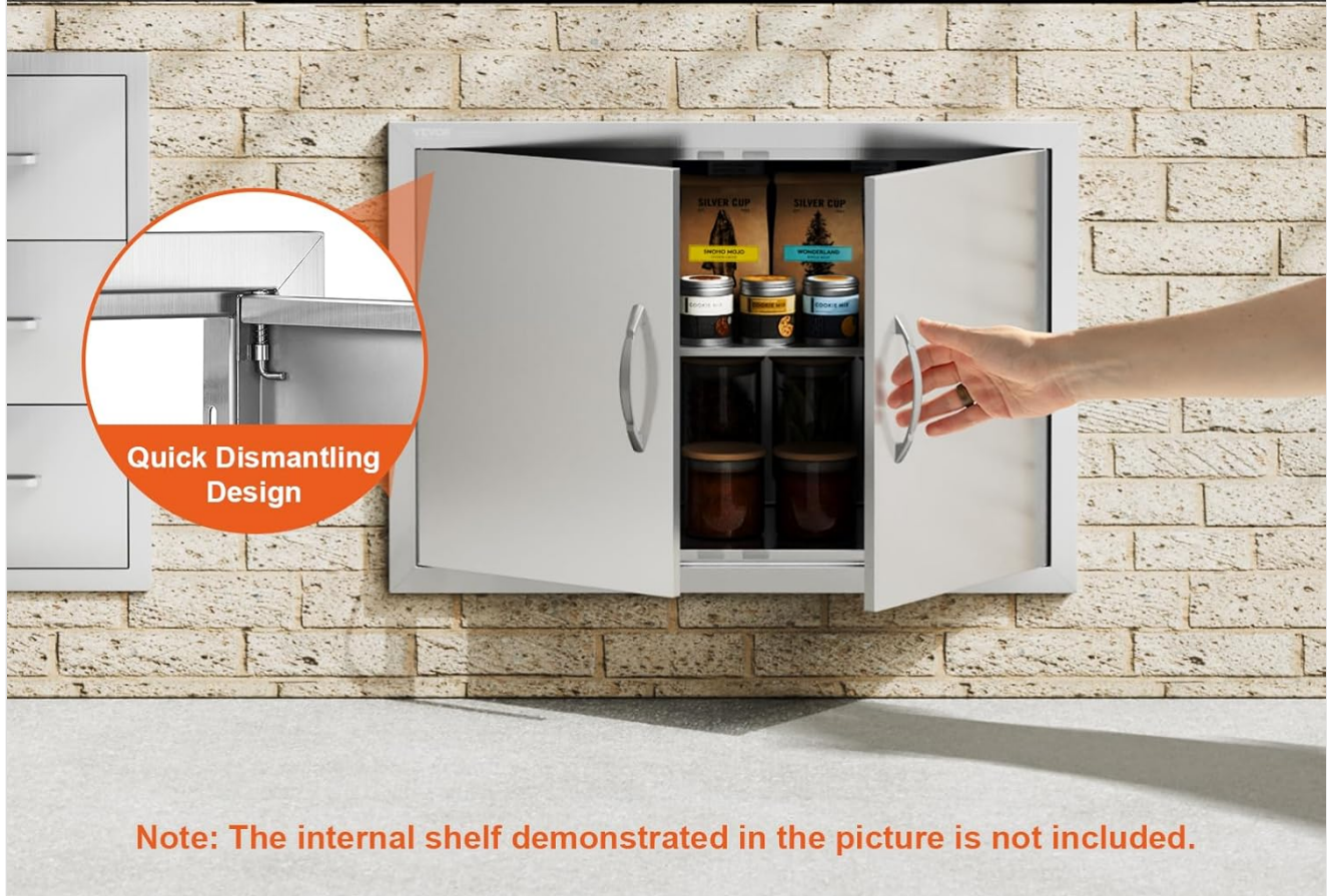
Image 6.1: The detachable door panel structure, highlighting the quick dismantling design for easy maintenance or replacement.

L-shaped insert quick disassembly structure, easy to replace