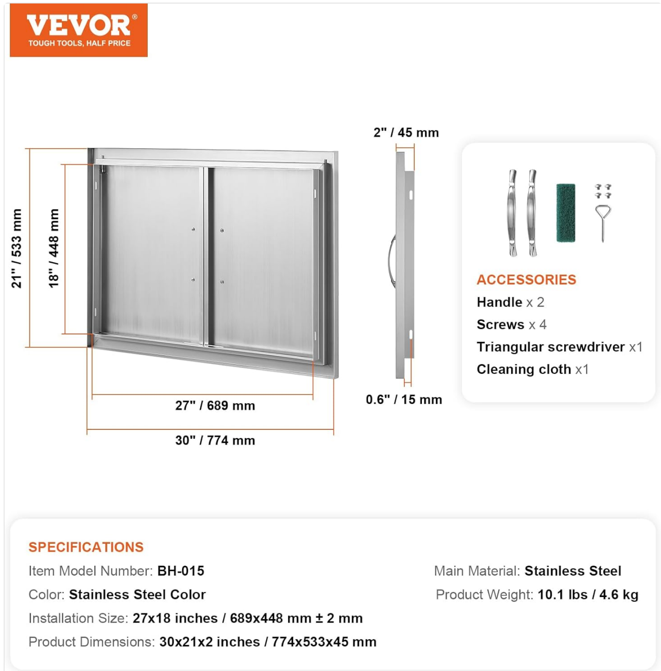
Image 3.1: Overview of product dimensions and included accessories.