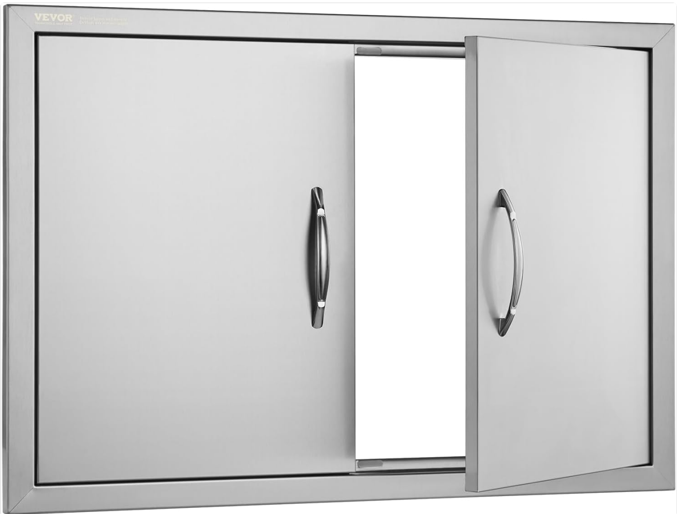
Image 5.1: The VEVOR BBQ Access Door with one panel open, demonstrating ease of access.