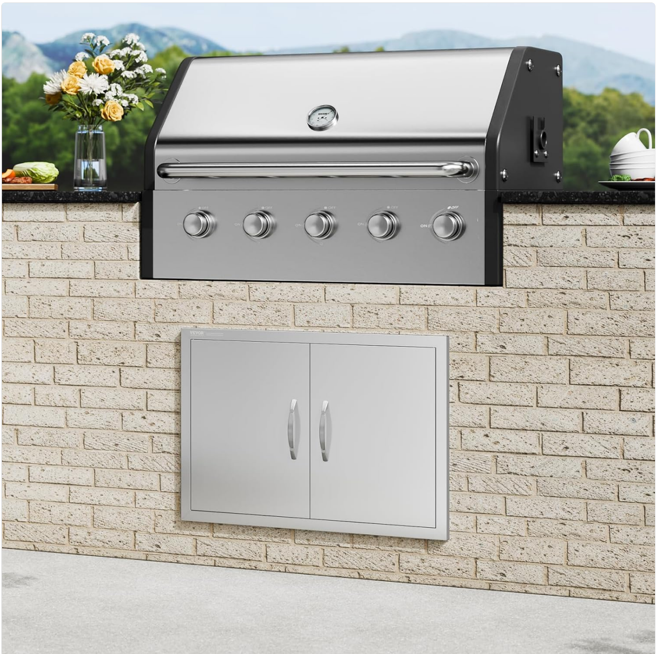
Image 1.1: The VEVOR BBQ Access Door seamlessly integrated into an outdoor grill island.