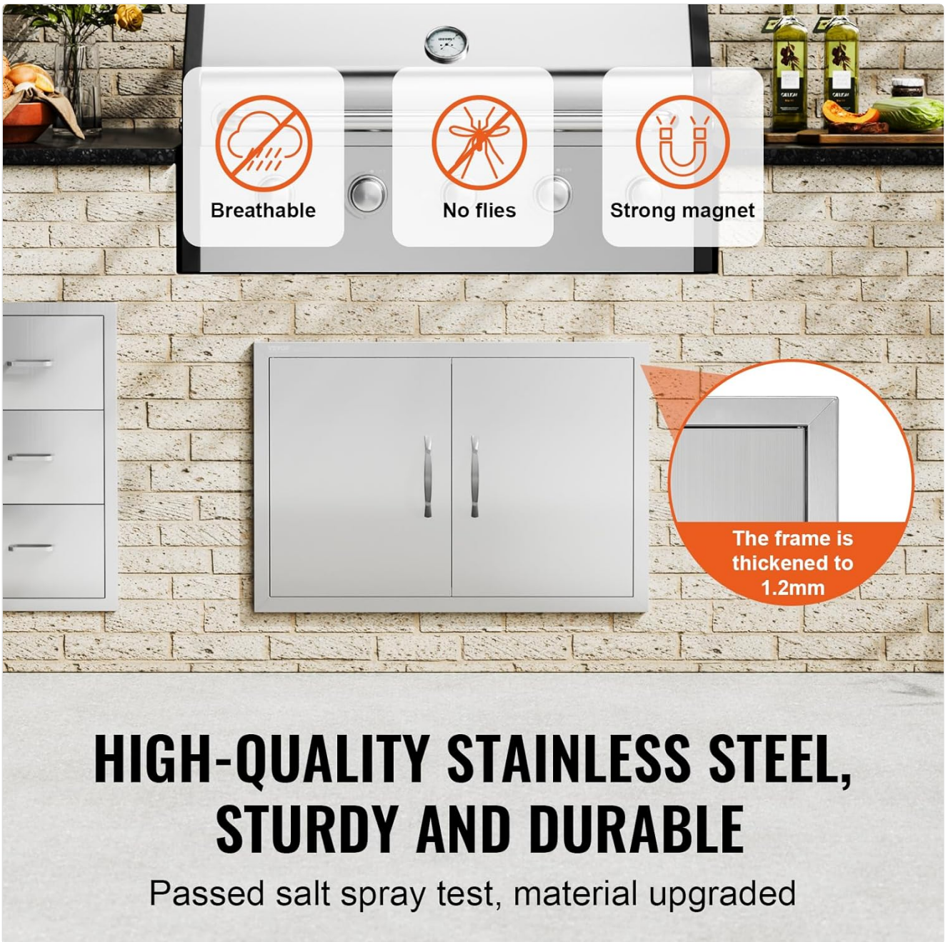
Image 1.2: Highlights of the VEVOR BBQ Access Door, emphasizing material quality and secure closure.