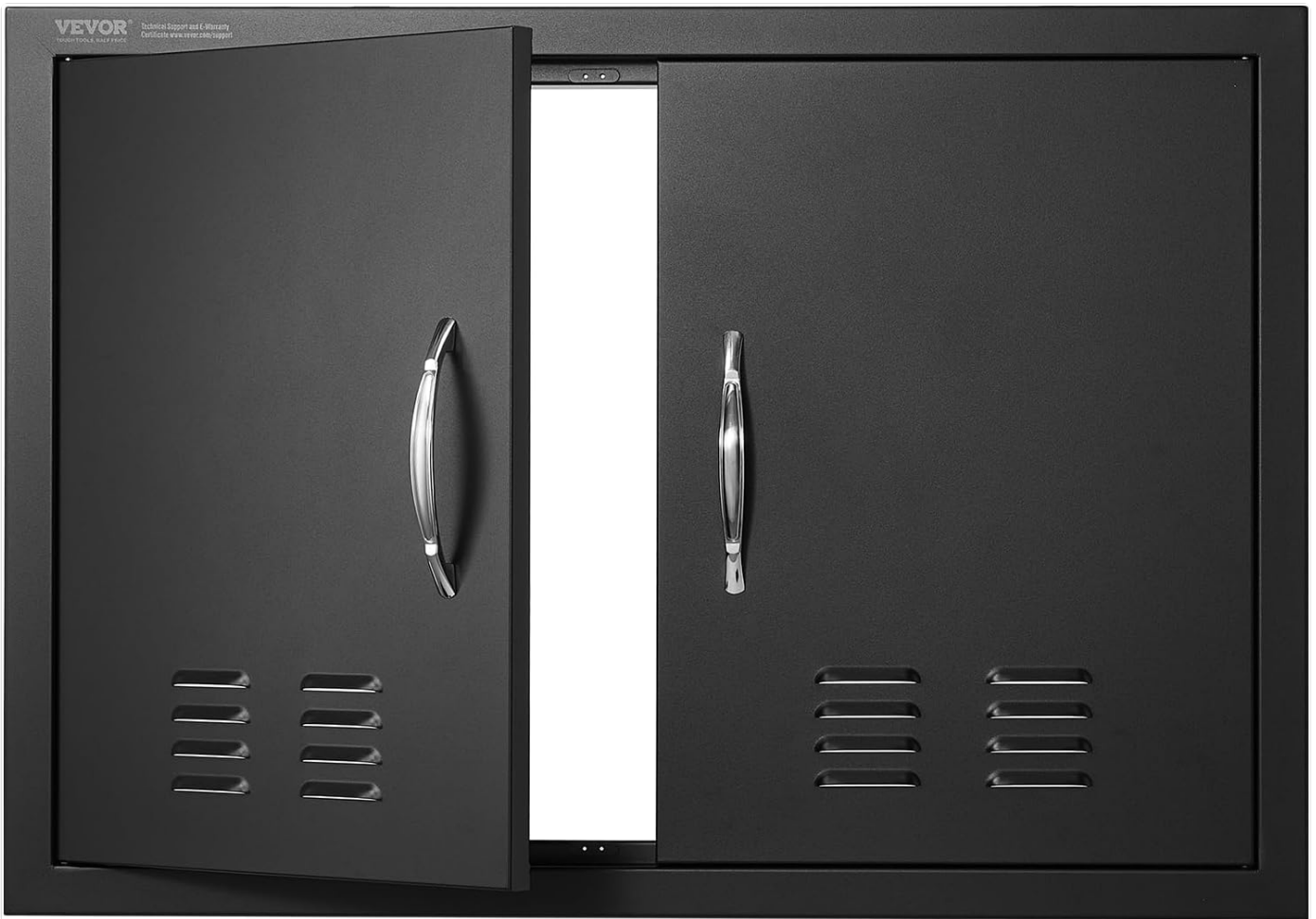
Figure 1: VEVOR BBQ Access Door (30W x 21H Inch) with handles and vents.