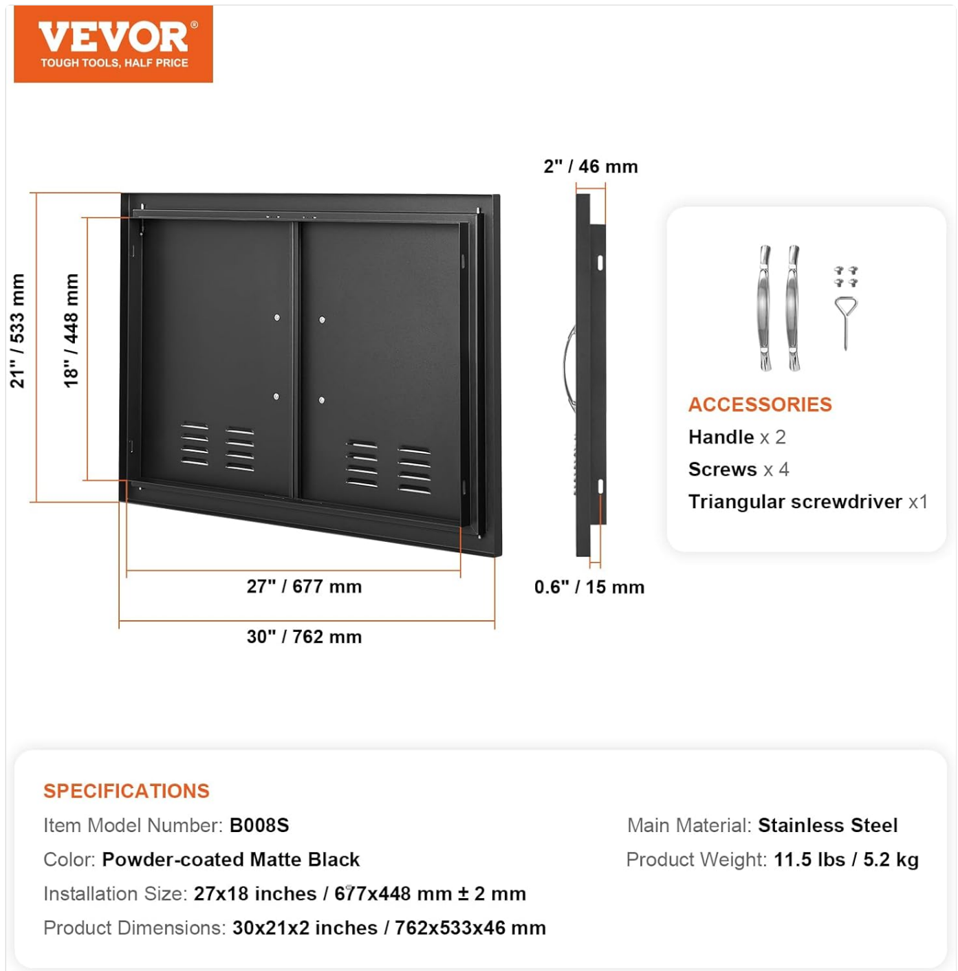
Figure 2: Product dimensions and included accessories.