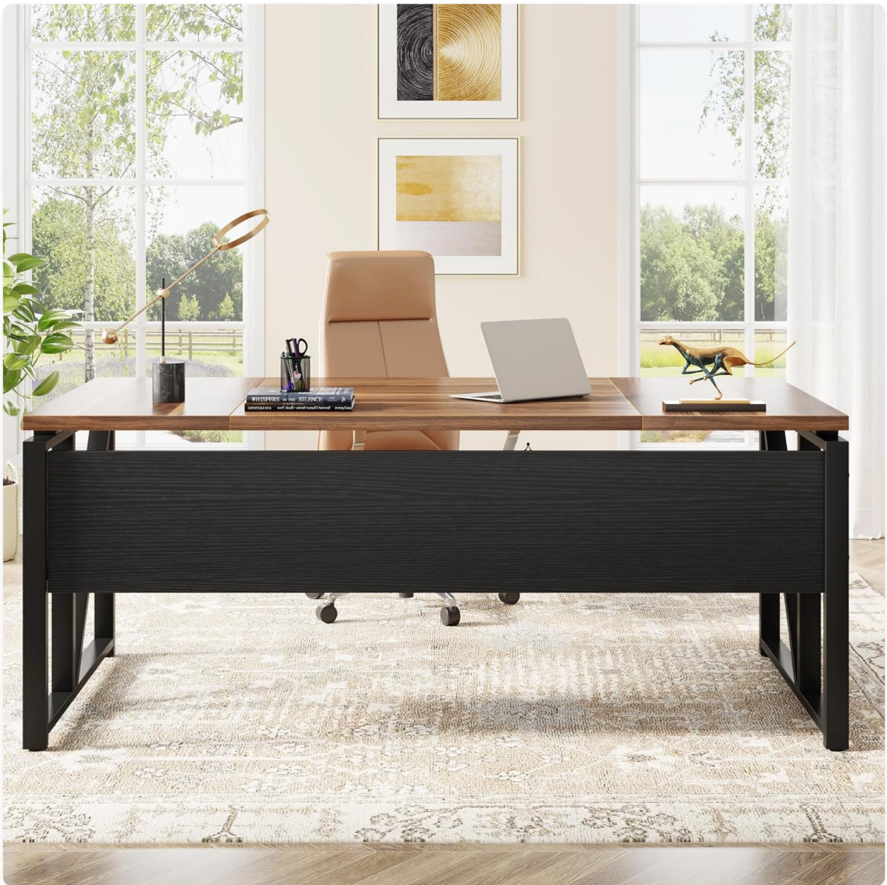
Figure 4.2: Details of the desk's construction materials and adjustable features.