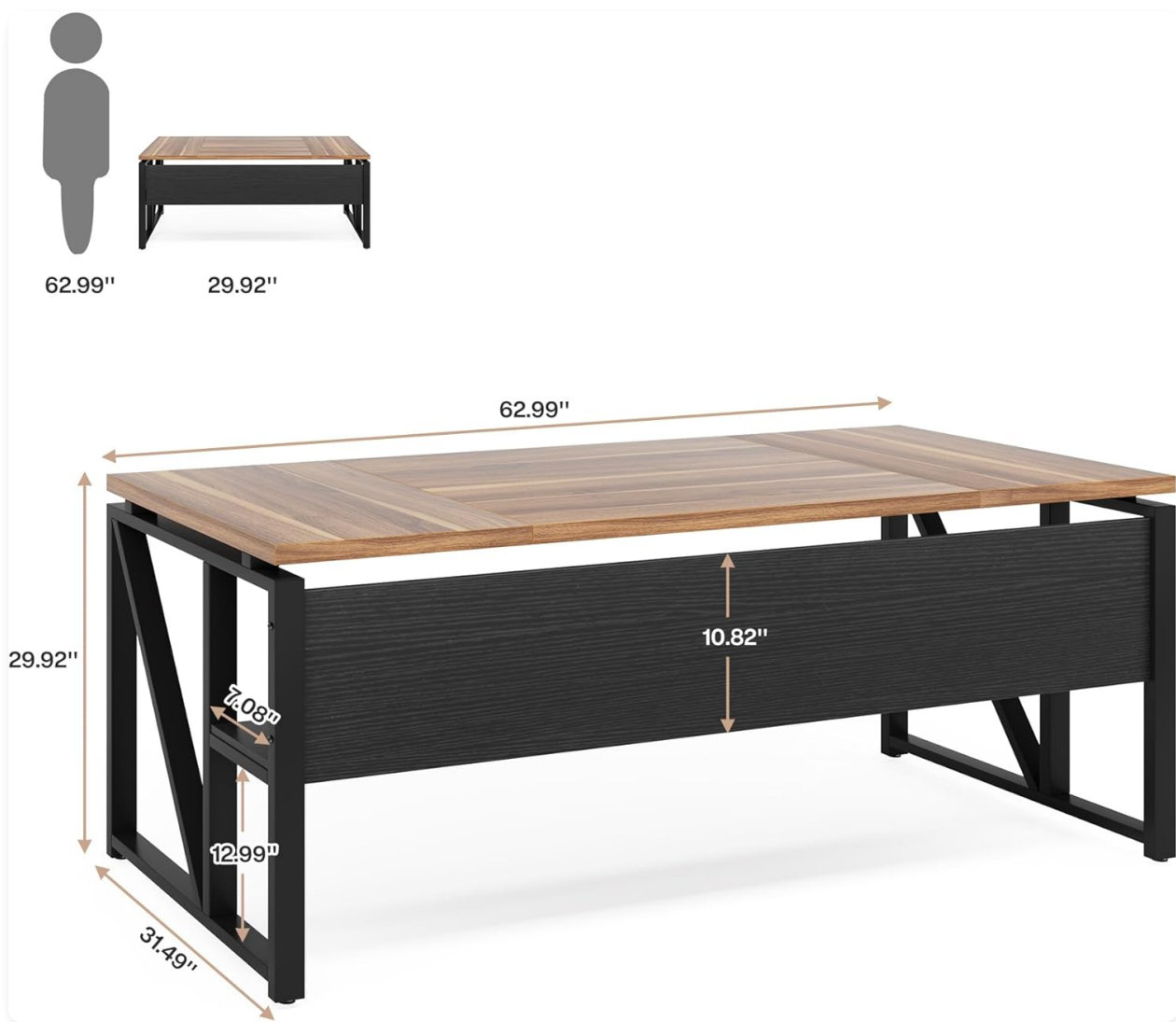
Figure 4.1: Key dimensions of the desk, important for planning your space and assembly.