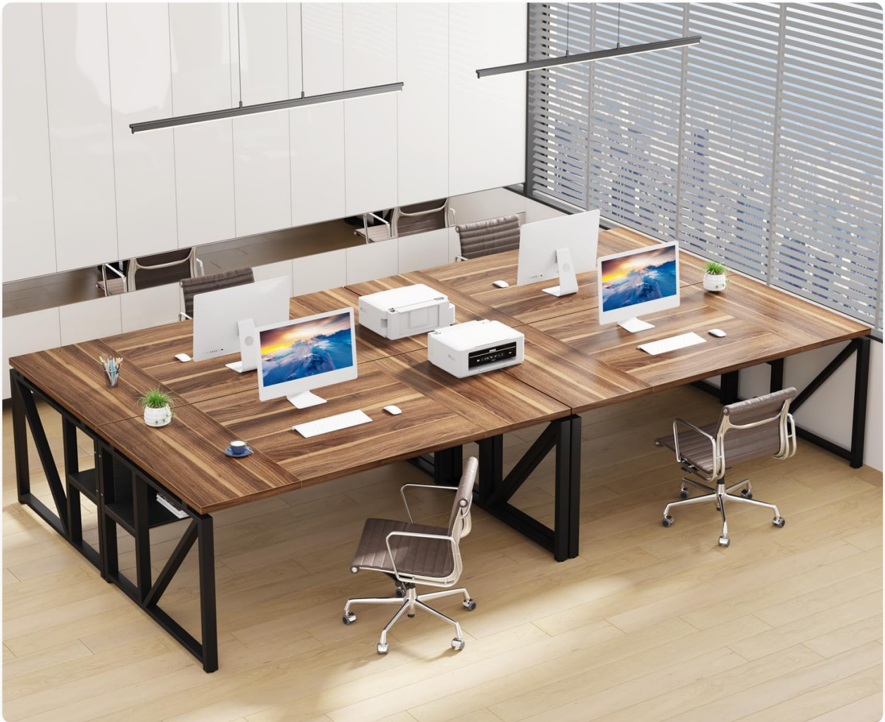
Figure 1.1: Overview of the Tribesigns Office Desk Set in a collaborative workspace.