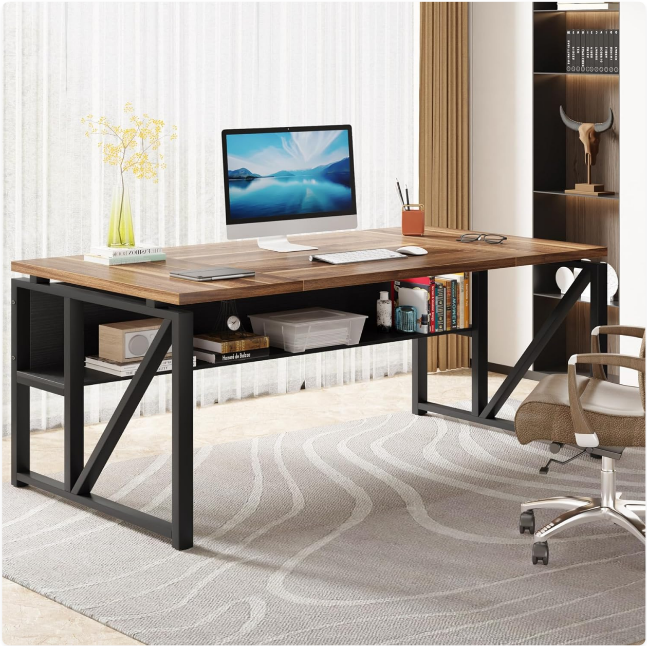
Figure 5.1: Example of desk setup demonstrating effective use of workspace and storage.