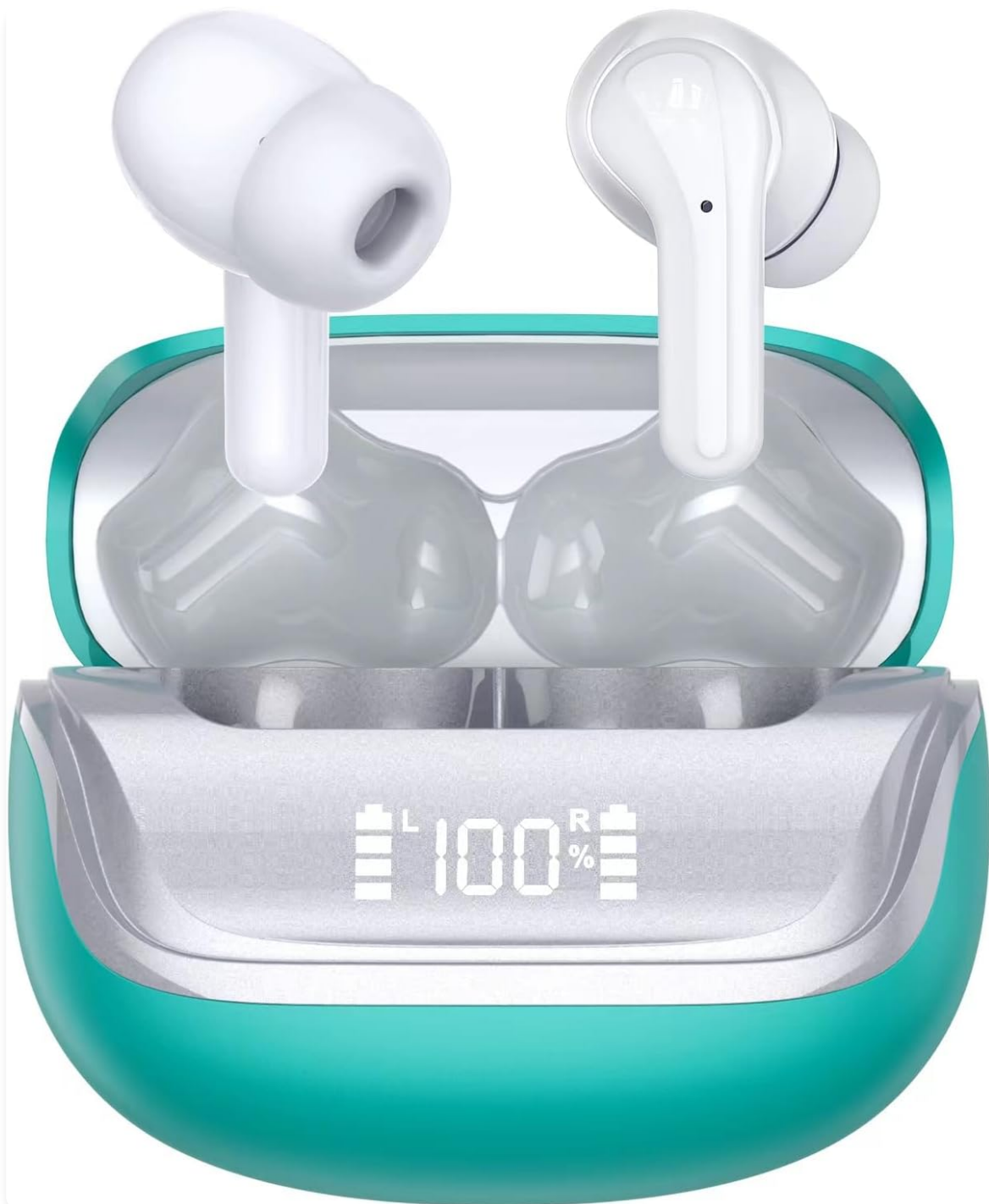
Image: Donerton Wireless Earbuds in their charging case, displaying 100% battery life for both earbuds and the case.