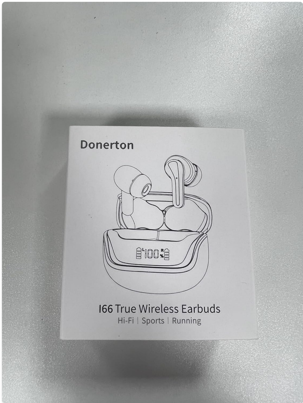
Image: The Donerton Wireless Earbuds, charging case, charging cable, and extra ear tips, along with the product packaging.