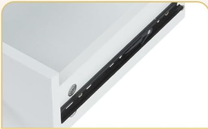
Smooth Sliding Rails