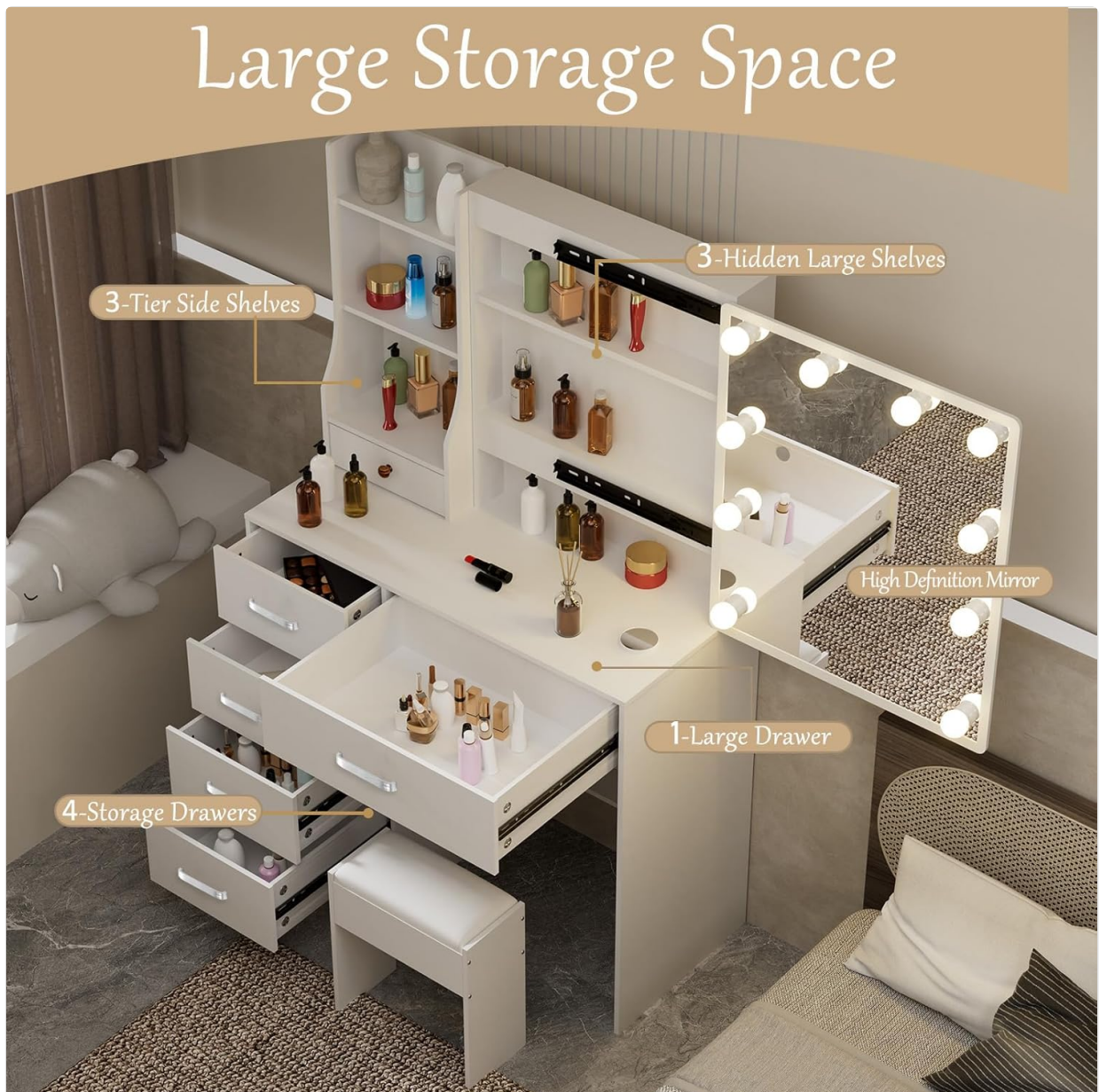
Image: Overview of the vanity desk with various storage compartments and the lighted mirror.