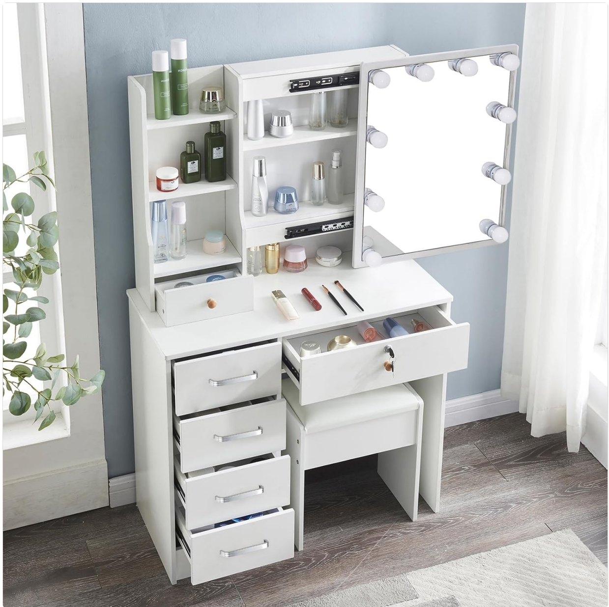
Image: Detailed view of the vanity desk's storage, including the large central drawer and side drawers.