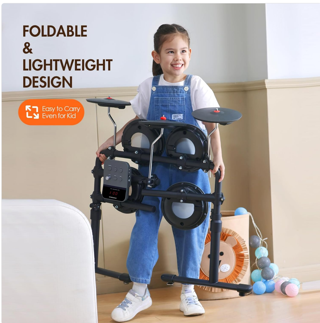
Figure 2.1: The foldable and lightweight design of the drum set for easy transport.

The drum rack features a foldable design for easy portability and storage. Unfold the main frame and secure the locking mechanisms. Ensure the rack is stable on a flat surface.