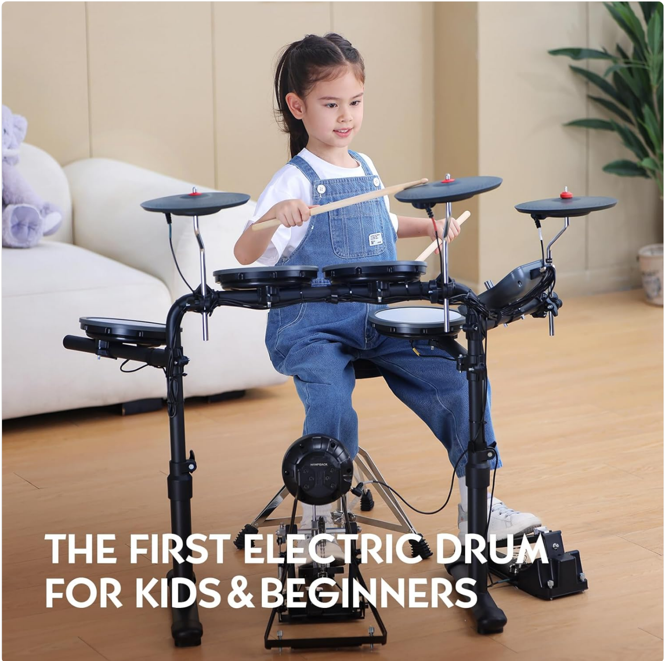
Figure 2.2: The drum set fully assembled and ready for use.

Attach the mesh drum pads and full rubber cymbals to the designated points on the drum rack. Use the provided screws and tools to secure them firmly. Ensure all connections are snug to prevent movement during play.