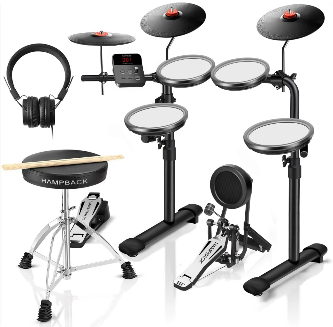
Figure 1.1: Complete HAMPBACK MK-0 PRO Electric Drum Set package contents.