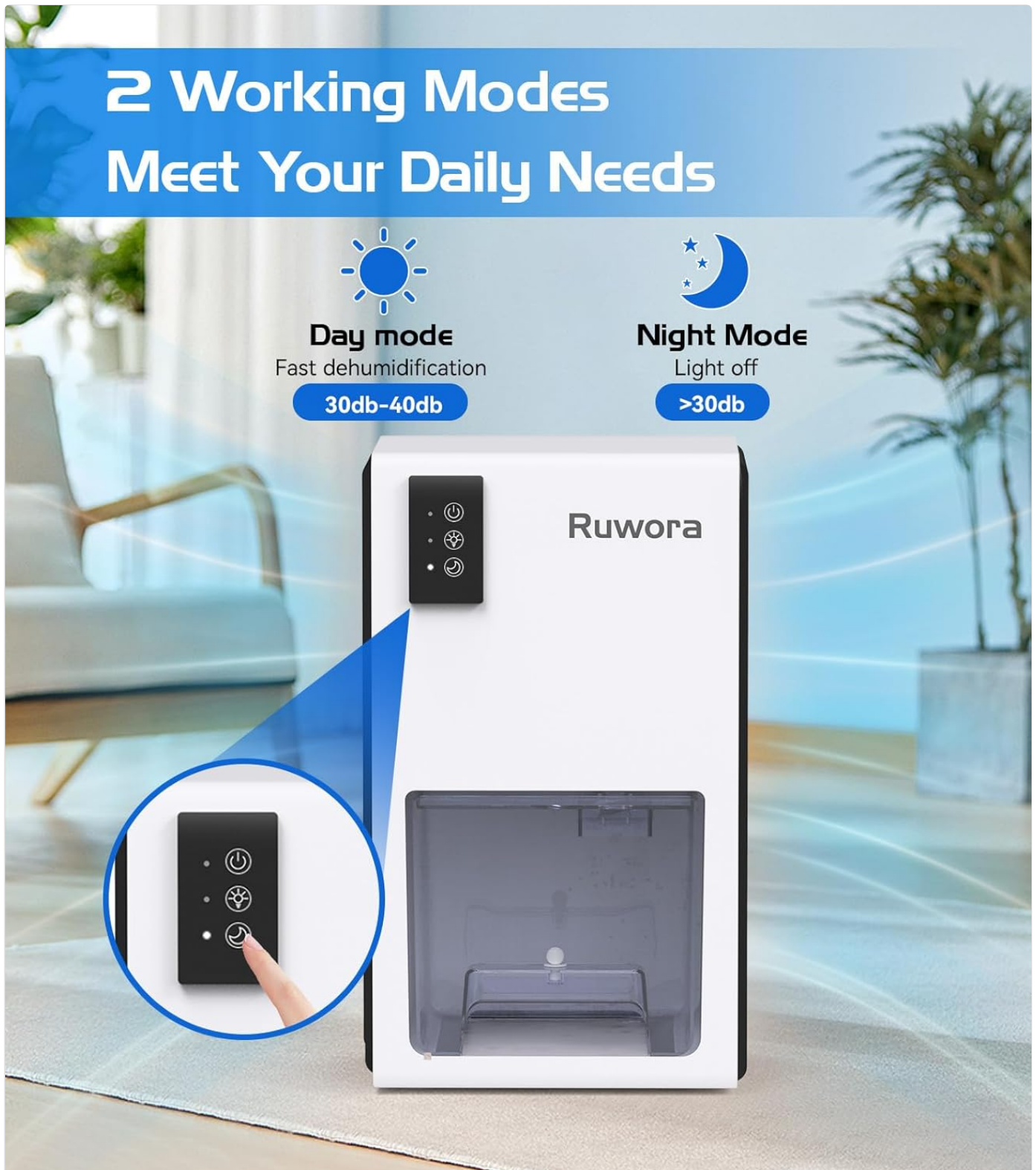
Figure 5.2: Illustration of the two working modes: Day Mode for fast dehumidification and Night Mode for quiet operation.