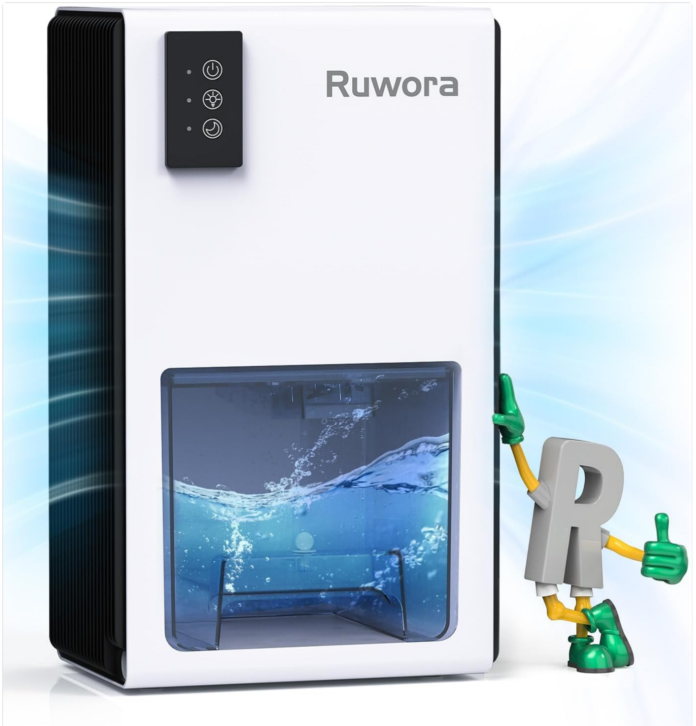
Figure 3.1: Front view of the RUWORA Dehumidifier, showing the control panel and water tank.