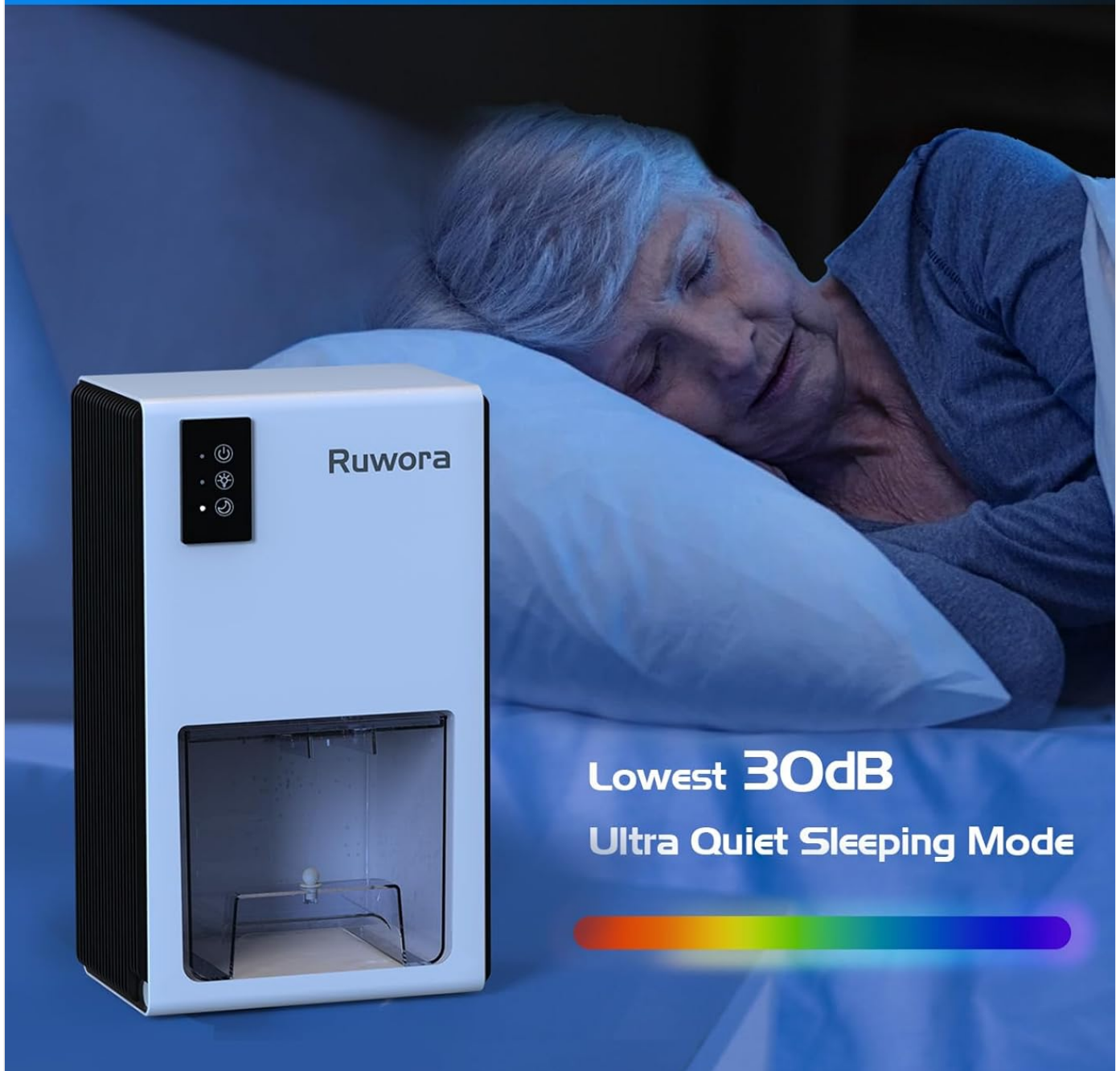
Figure 5.4: Examples of the 7 colorful atmosphere lights available on the dehumidifier.