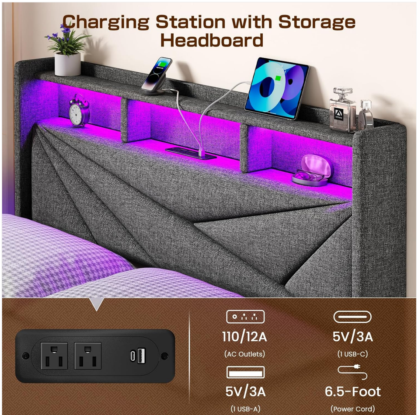
Image 5.1: Headboard LED lights in operation, showing remote control for various settings.