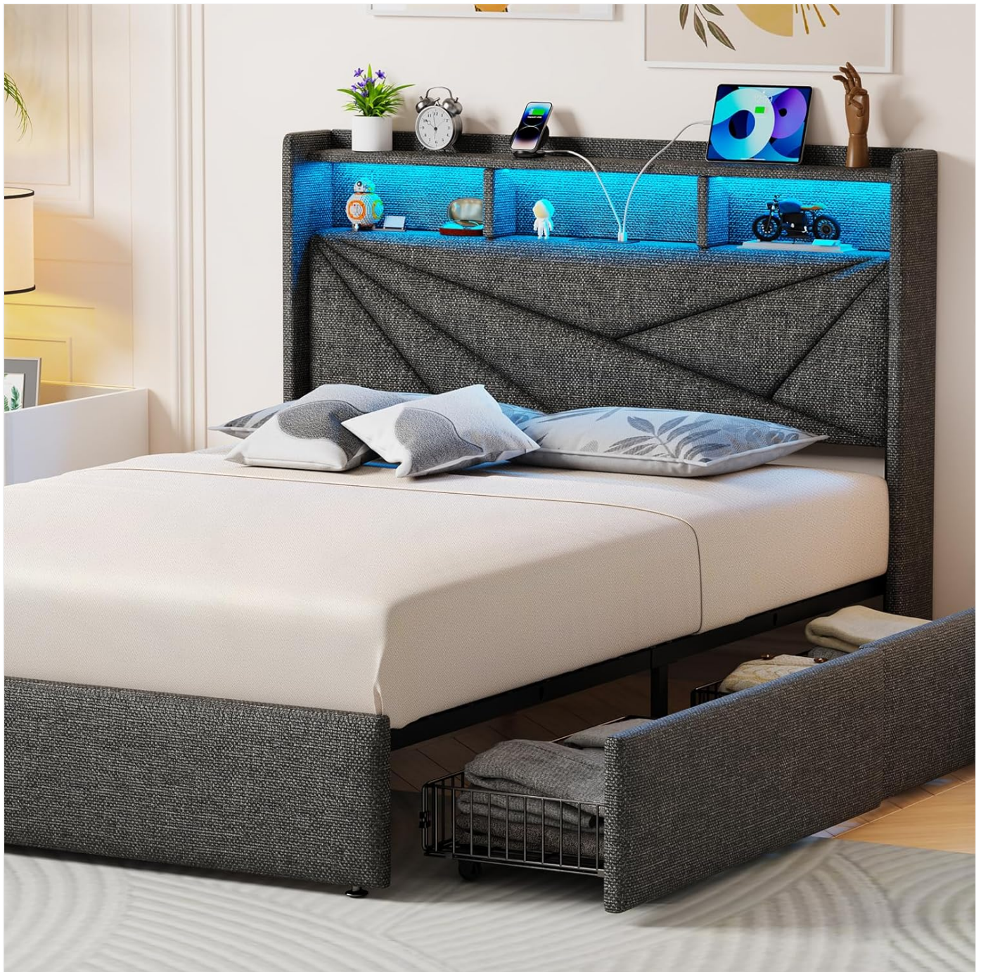
Image 1.1: Overview of the Driftalia Full Size Bed Frame with LED headboard, charging station, and storage drawers.