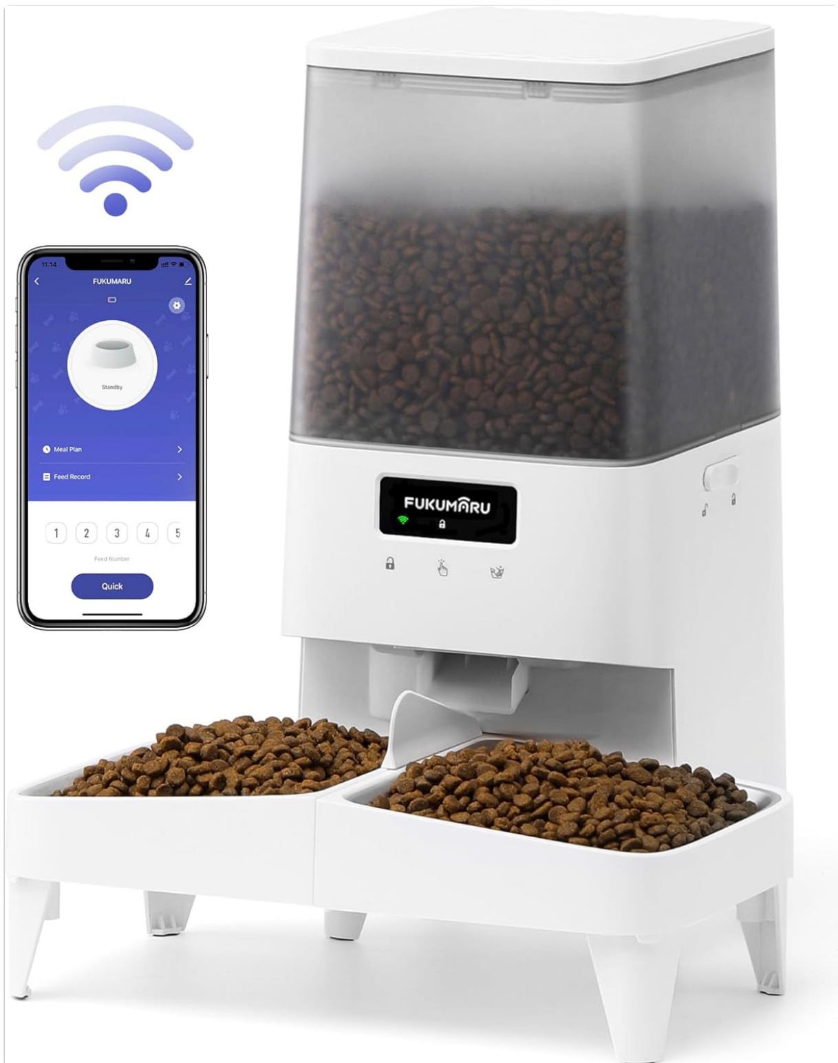
Image: FUKUMARU Automatic Pet Food Dispenser PTM-801 shown with dual bowls and a smartphone displaying the control app.