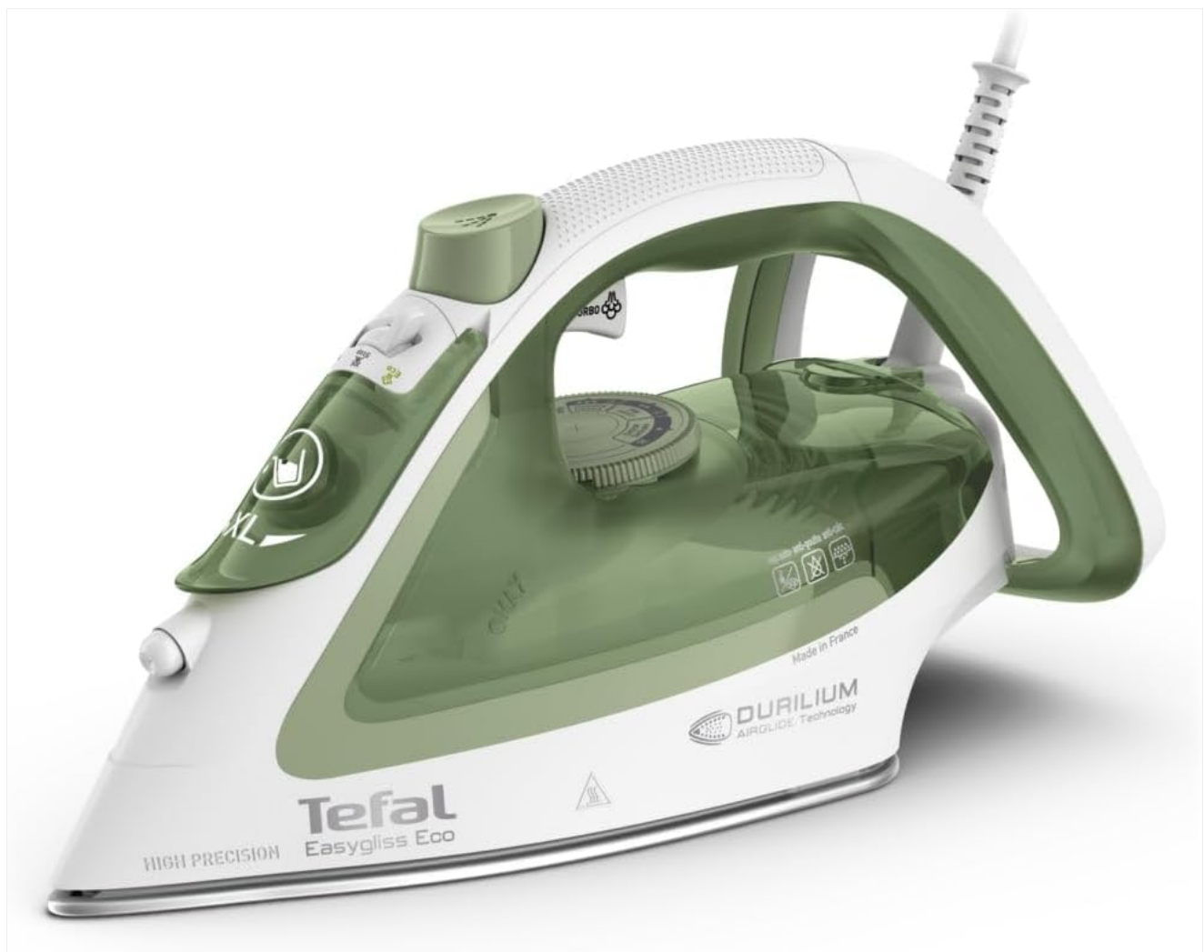
Figure 1: Front-side view of the Tefal FV 5781 Easygliss Eco Steam Iron, showcasing its white and green design, water tank, and control dial.