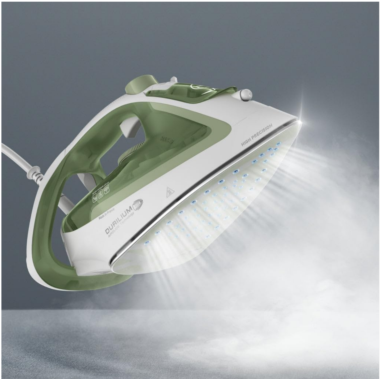
Figure 4: The iron in operation, emitting powerful steam from its soleplate, demonstrating its steam function.