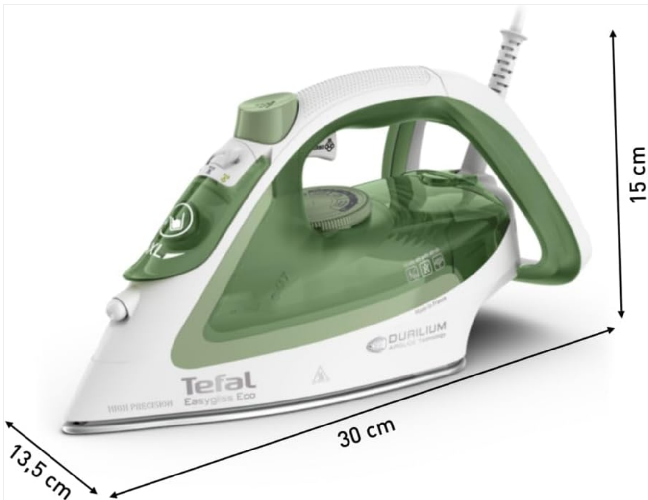
Figure 3: The iron shown with its approximate dimensions: 30 cm length, 15 cm height, and 13.5 cm width at the base.