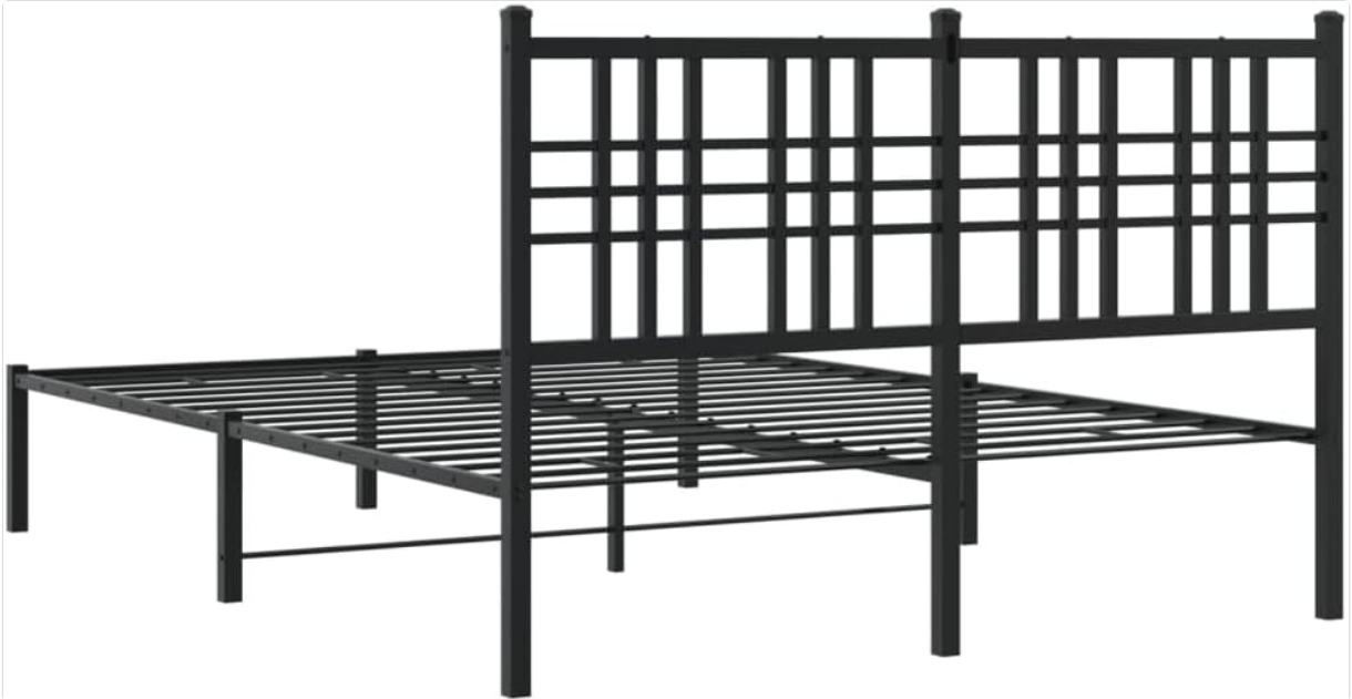
Image 5.1: The bed frame with all metal slats in place, ready for a mattress.