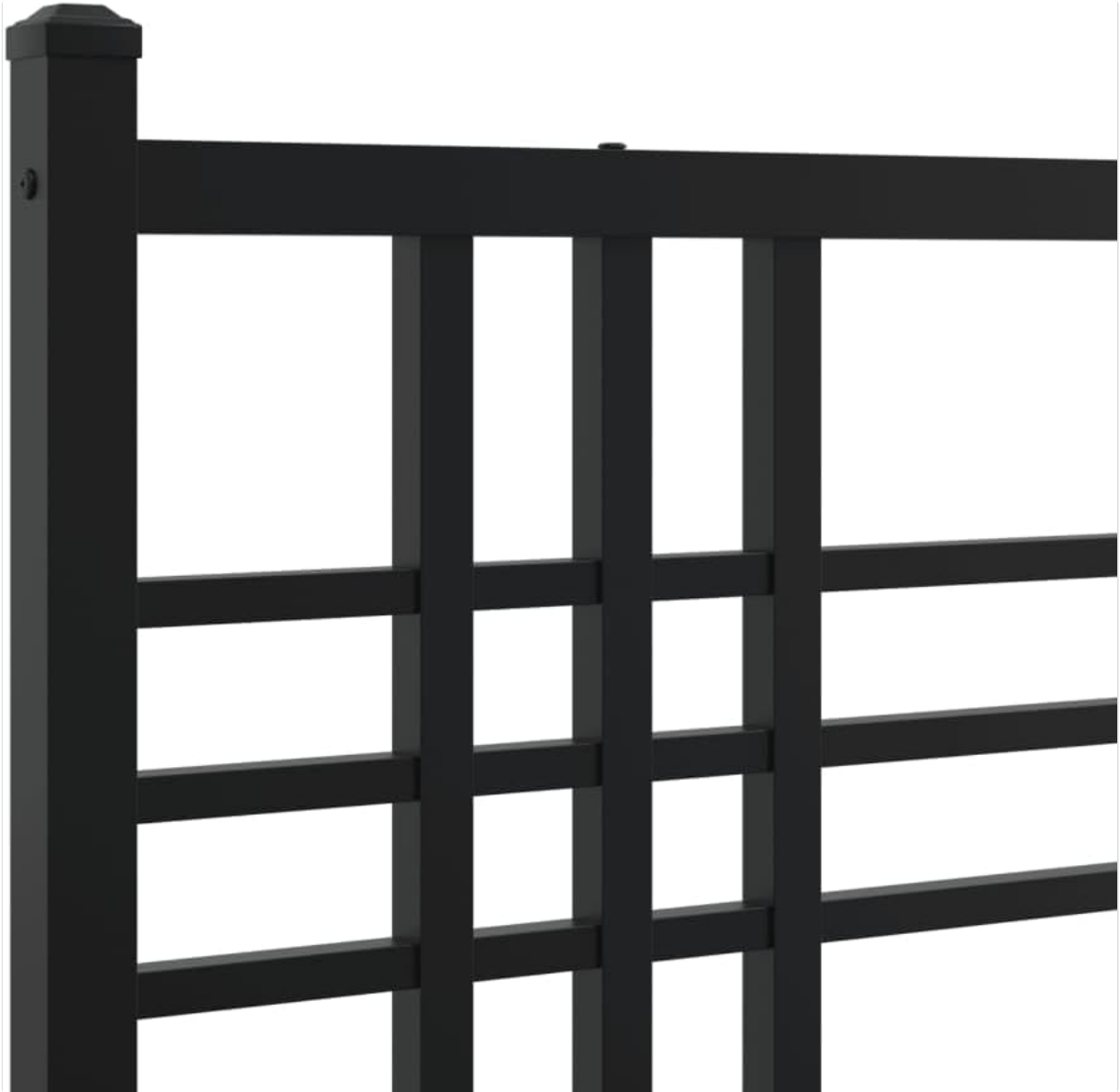
Image 7.1: Detail of the headboard design, showcasing the powder-coated finish.