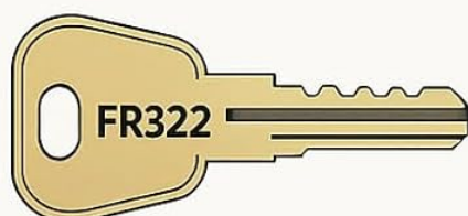
On the Key