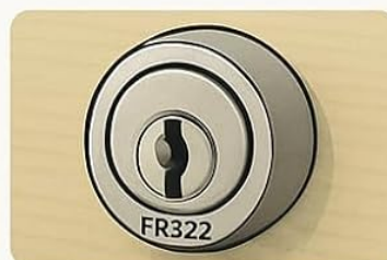
On the Lock Face