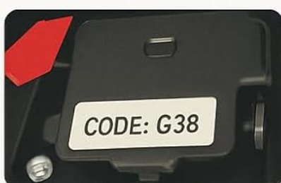
On a Label Inside/ Behind the Lock