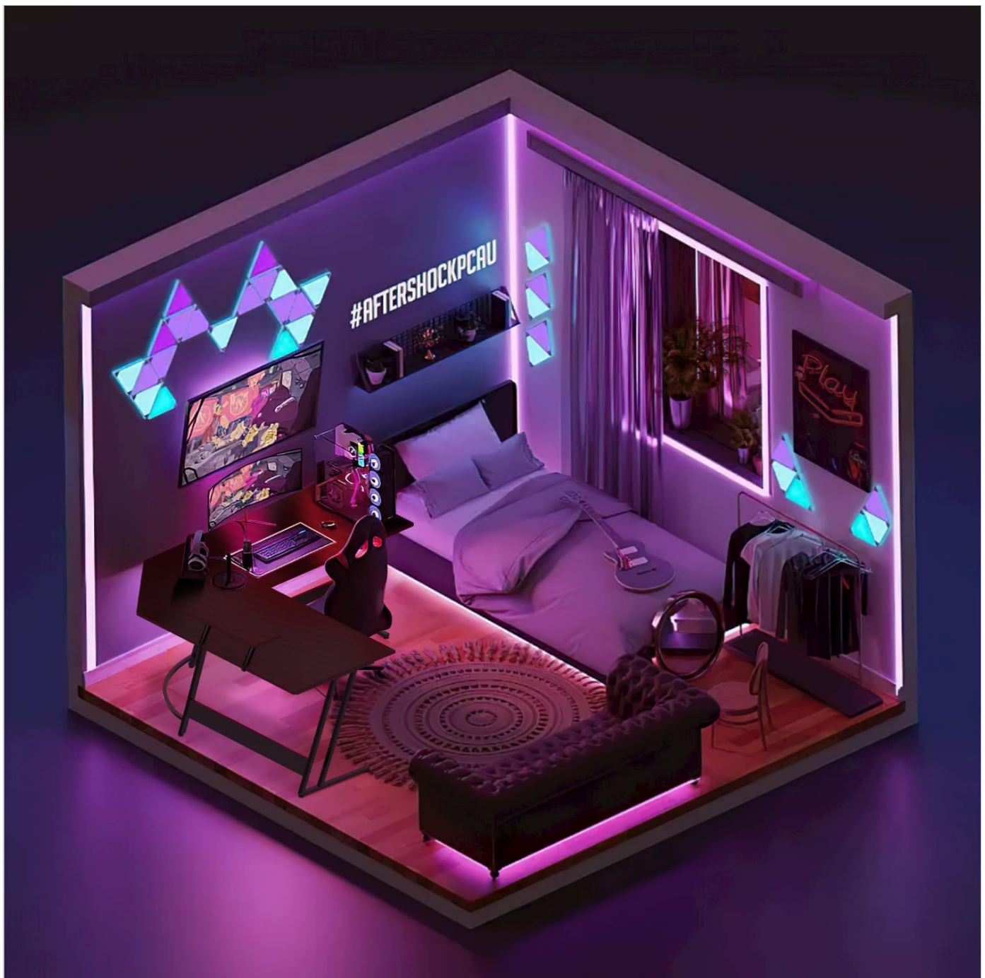
Image 1.1: The Devoko L-Shaped Gaming Desk in a typical gaming setup, showcasing its spacious design and monitor stand.