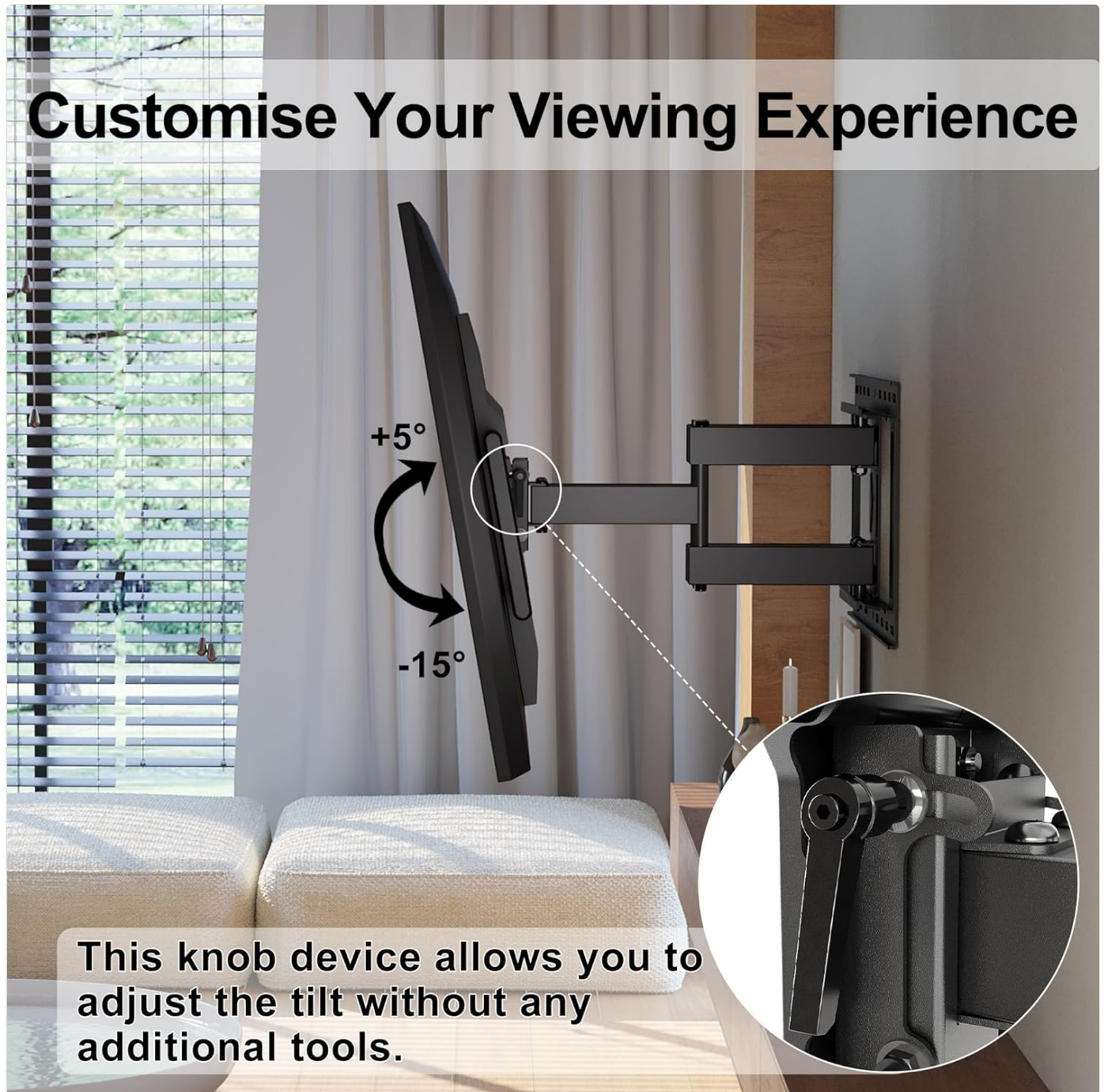
Image: A visual representation of the TV mount's tilt functionality, allowing adjustment from +5 degrees upwards to -15 degrees downwards. A detailed inset shows the knob device used for easy, tool-free tilt adjustment.