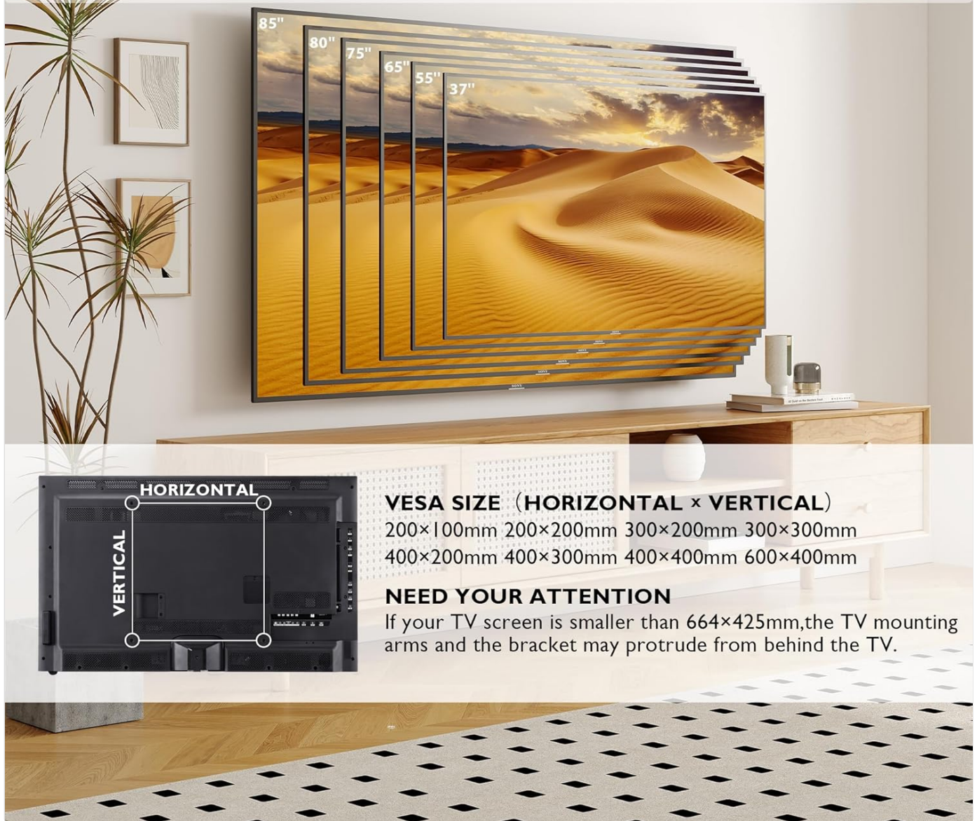
Image: A visual guide illustrating VESA compatibility for screens ranging from 37 to 85 inches. It highlights the horizontal and vertical VESA dimensions (200×100mm to 600×400mm) and advises checking TV port locations to avoid obstruction by the brackets.