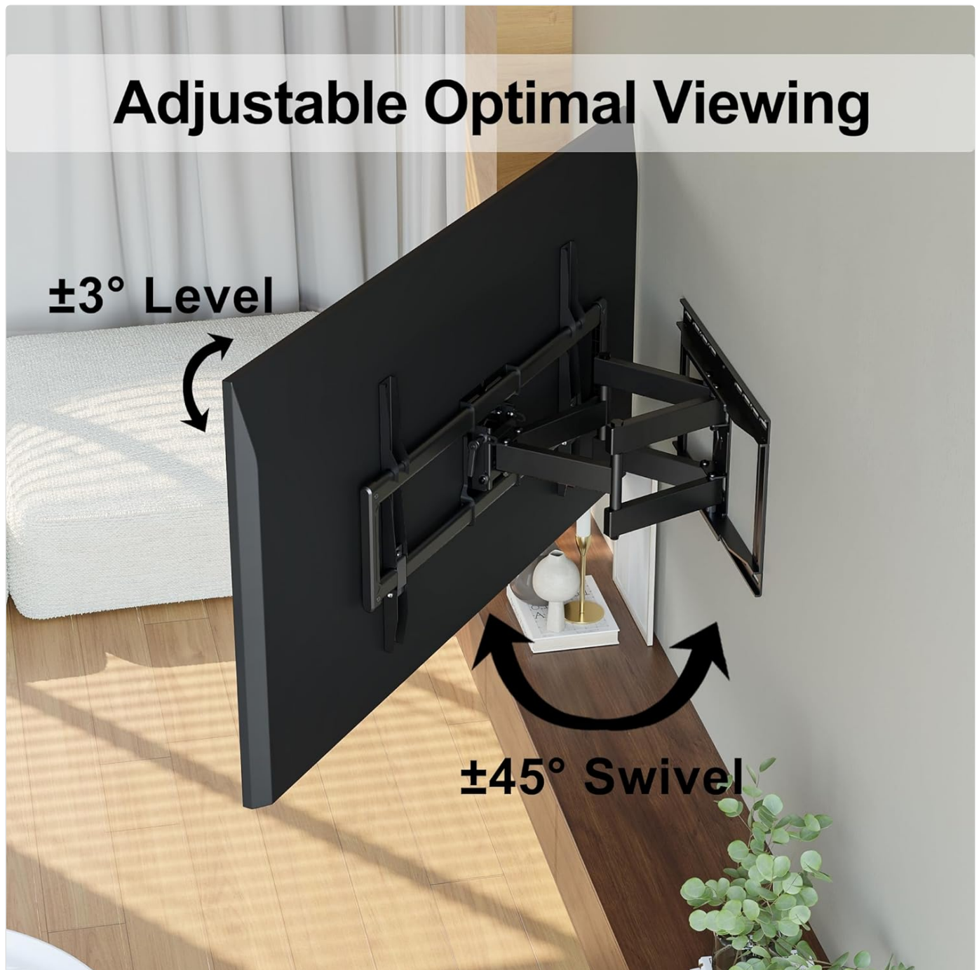
Image: This image illustrates the adjustable viewing capabilities of the TV mount, including a \pm 45^\circ degree swivel range for horizontal positioning and a \pm 3^\circ degree level adjustment for fine-tuning the screen's horizontal alignment.