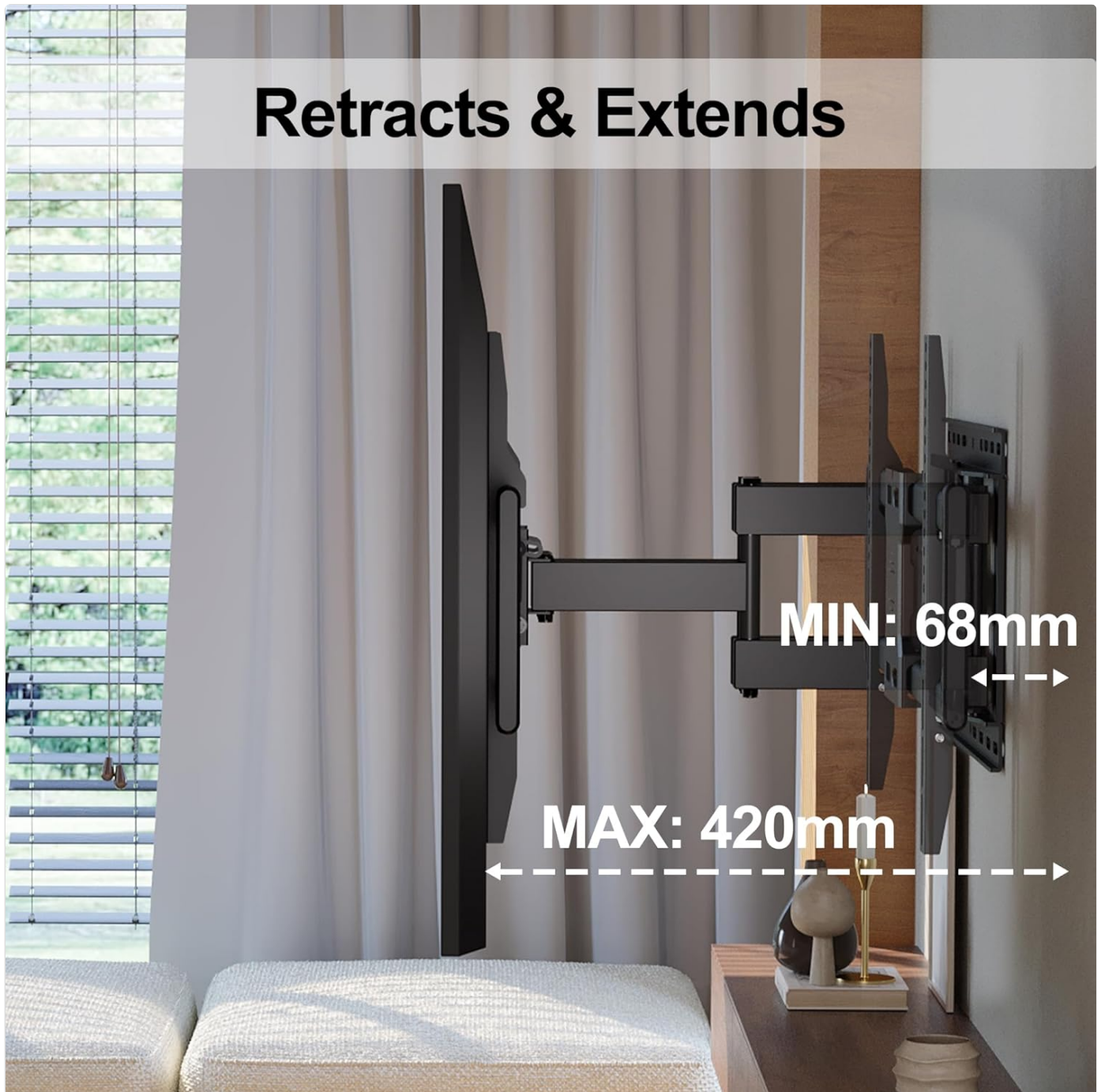
Image: A side view of the TV mount demonstrating its extension and retraction capabilities. It shows the mount retracting to a minimum distance of 68mm from the wall and extending to a maximum of 420mm, highlighting its space-saving and flexible design.