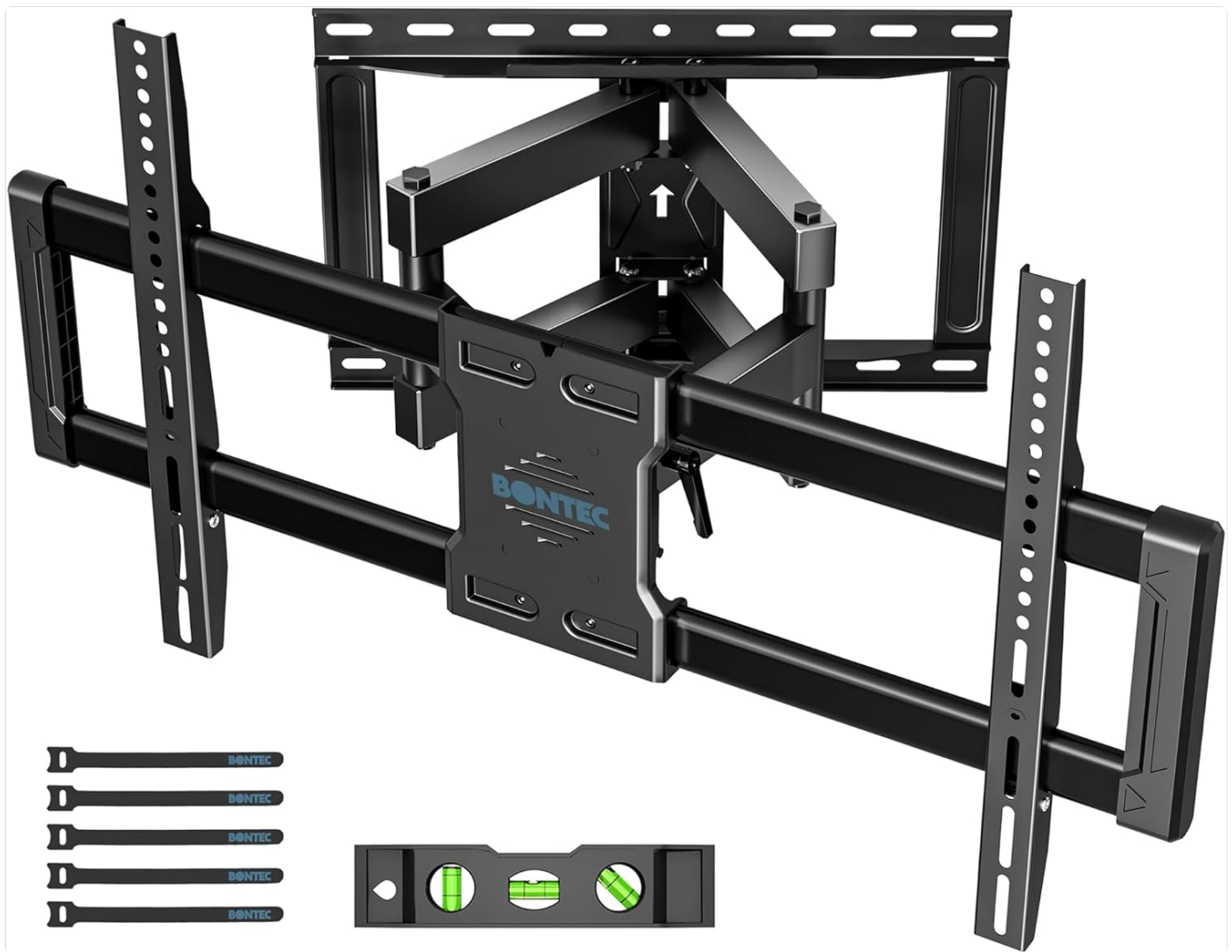
Image: The BONTEC Universal TV Wall Mount, showcasing its articulated arms, wall plate, and TV brackets. Also visible are cable ties and a spirit level, indicating included accessories for installation.