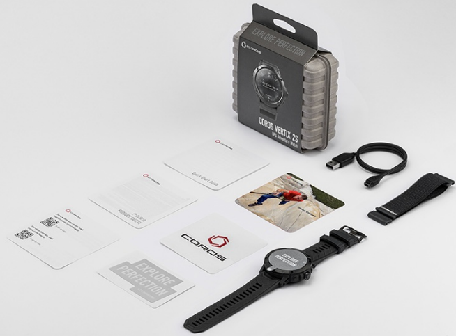
The COROS VERTIX 2S packaging and included accessories.

Compact packaging made from recycled materials that can be reused, or recycled, to store your charging cables, accessories, and more.