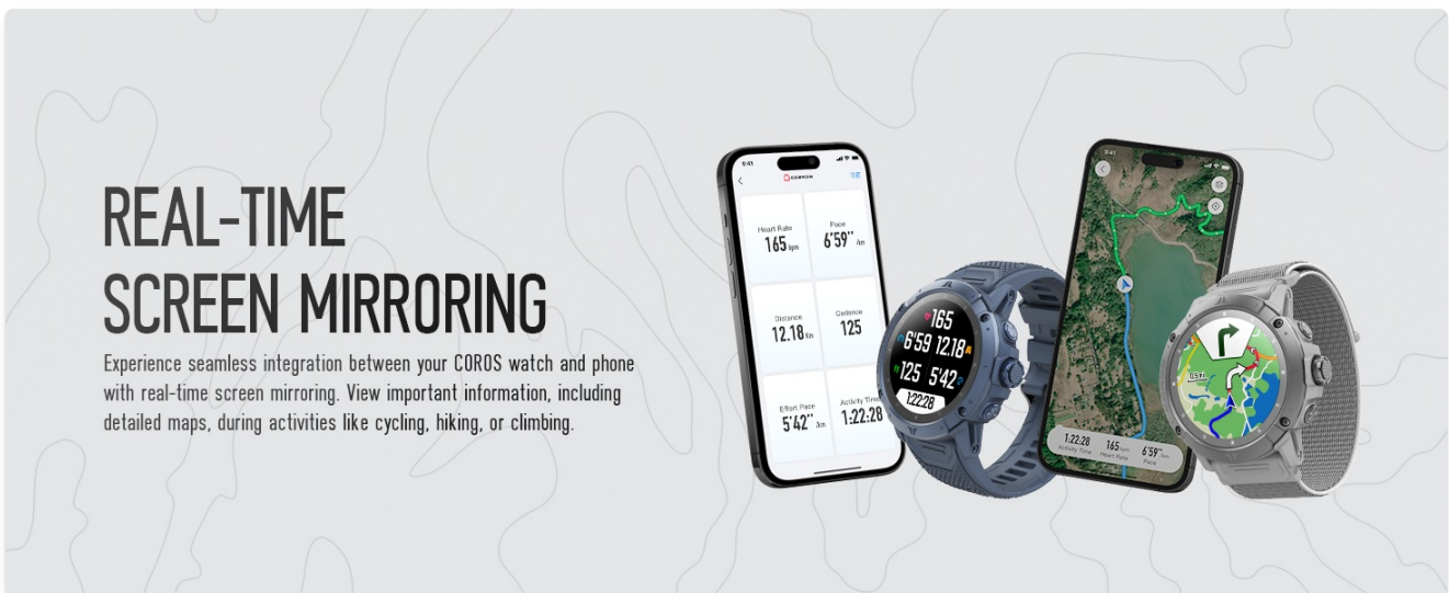
Real-time screen mirroring from the watch to a smartphone.

Experience seamless integration by mirroring your watch screen to your phone. View detailed maps and activity data during cycling, hiking, or climbing directly on your smartphone.