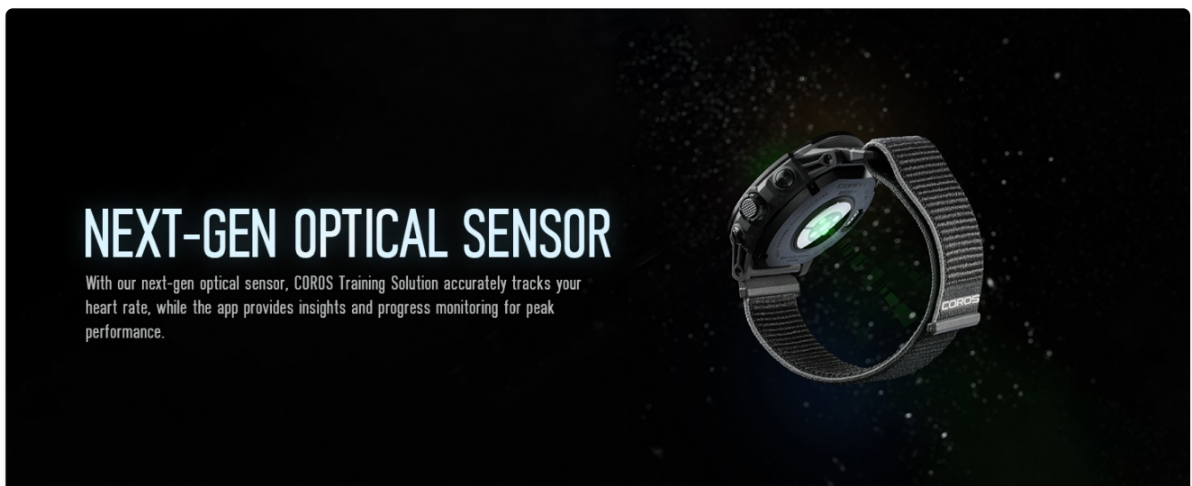
The optical heart rate sensor on the back of the watch.

The next-gen optical sensor provides accurate heart rate tracking for precise training and recovery data. Monitor your heart rate during activities and throughout the day for comprehensive fitness insights.