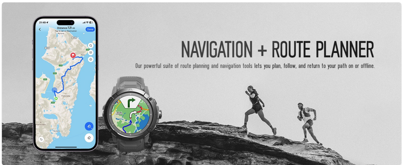
GPS navigation and route planning features on the watch and companion app.