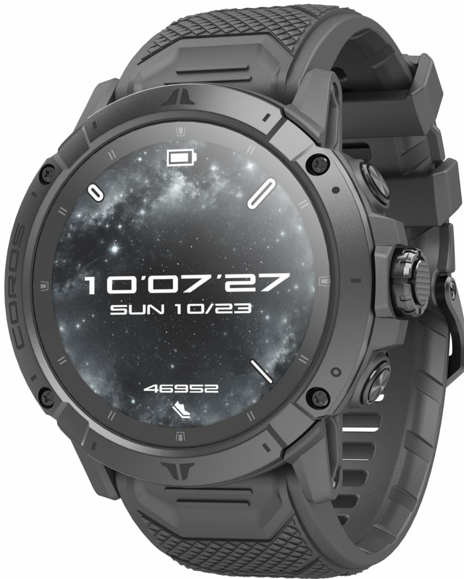
The COROS VERTIX 2S Adventure GPS Watch, designed for durability and advanced tracking.