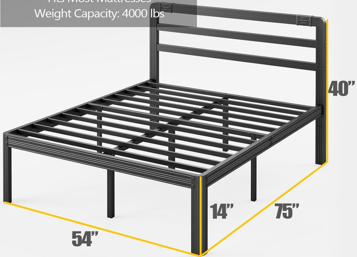
Image: A detailed diagram illustrating the dimensions of the BOSR11 Full Size Bed Frame, including length, width, height, and headboard height, along with its 4000 lbs weight capacity.