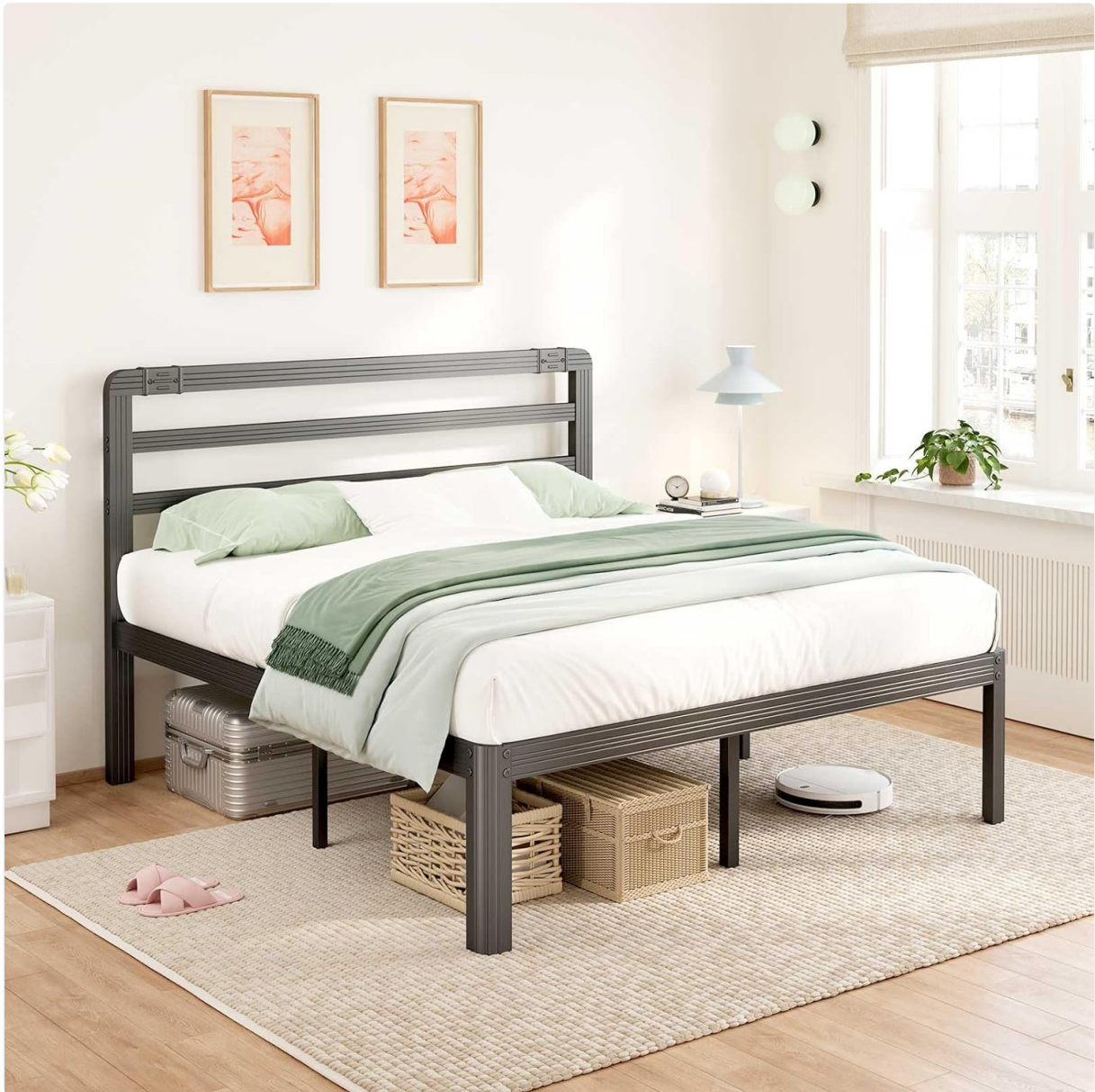
Image: The BOSR11 Full Size Bed Frame, fully assembled, featuring a black metal design with a headboard, shown in a modern bedroom with a mattress and bedding.