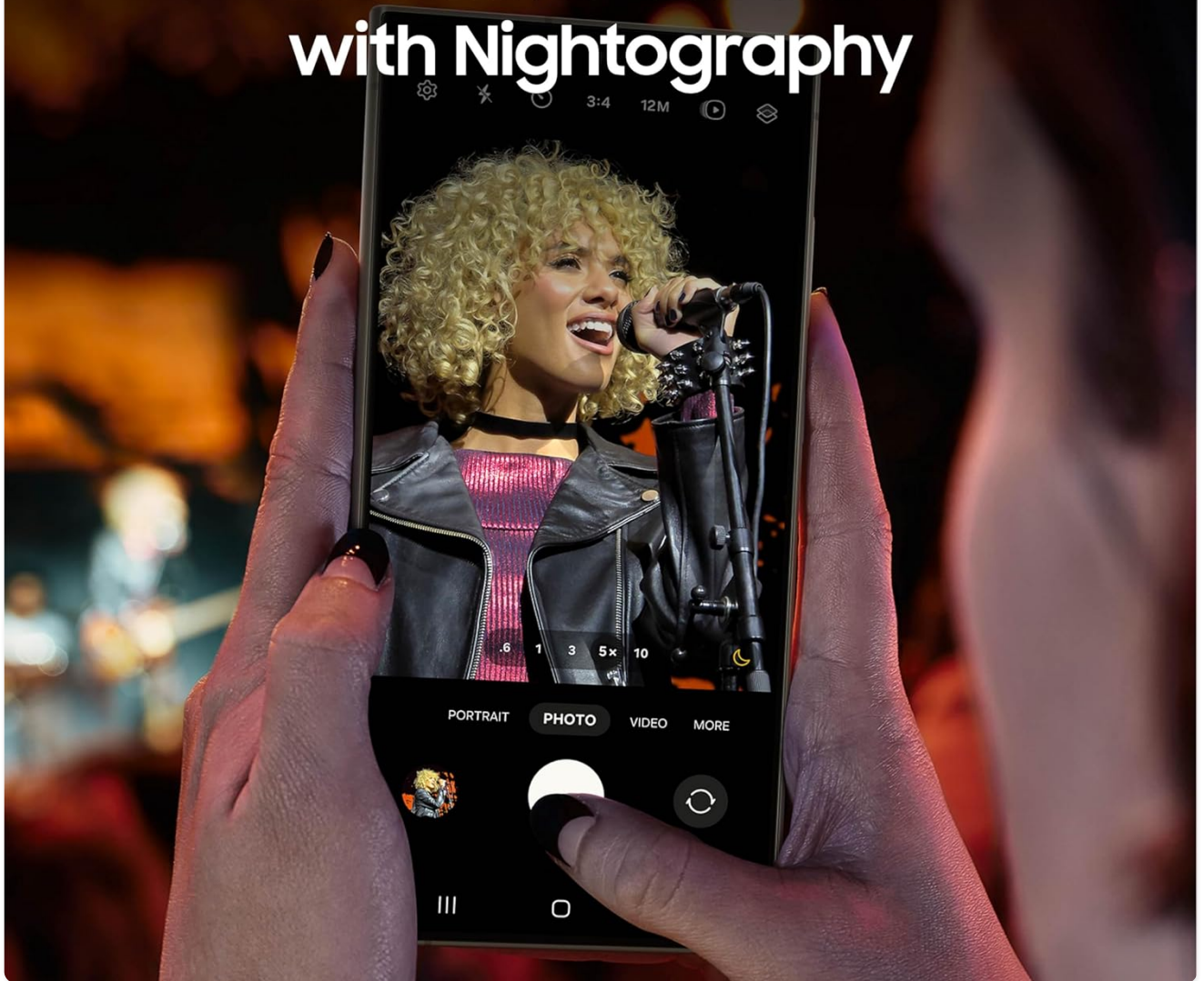
Image: A user holding the Samsung Galaxy S24 Ultra, capturing a low-light scene using the Nightography feature, highlighting its camera capabilities.