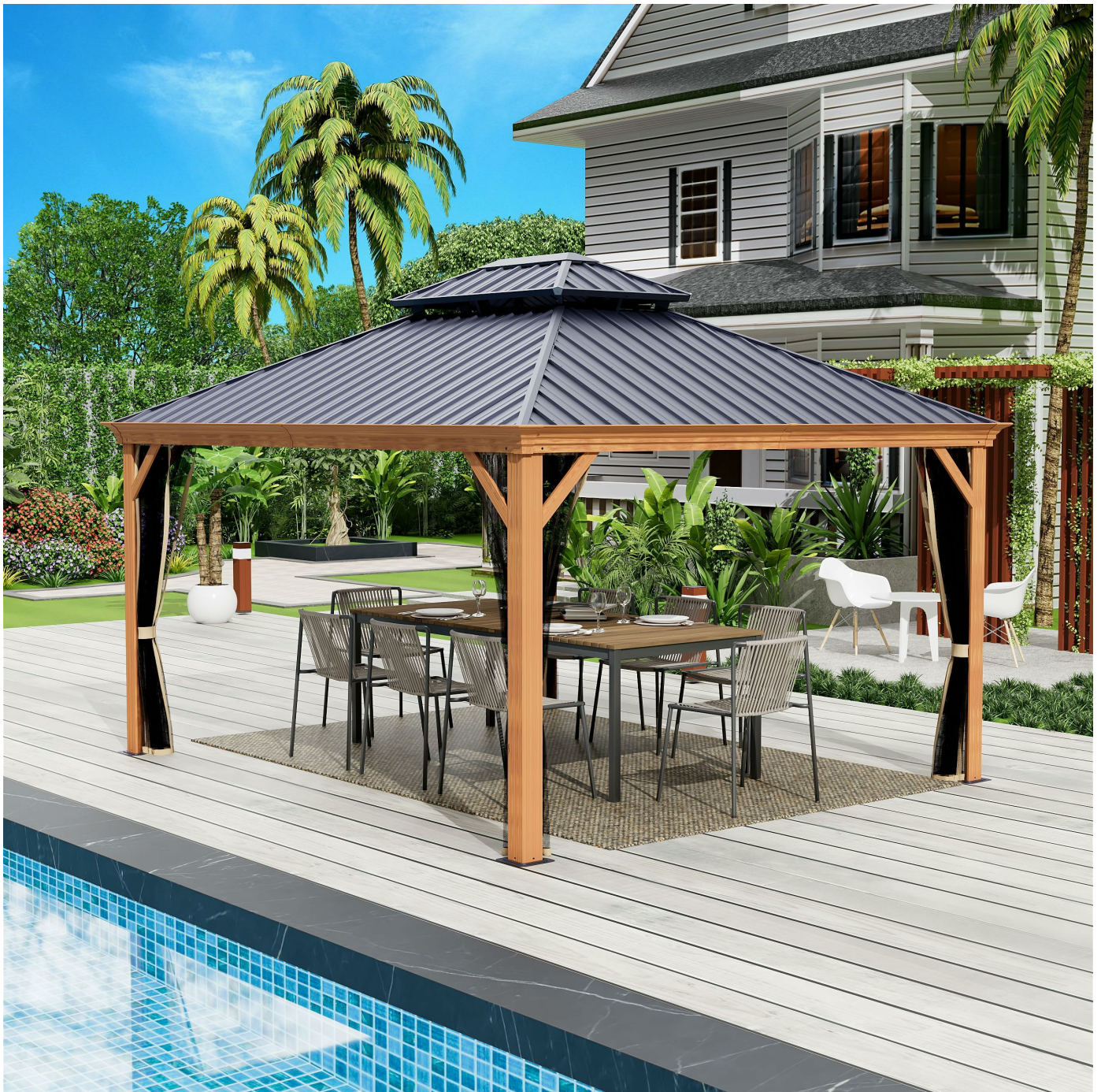
Figure 1.1: The Kozyard Apollo 12'x14' Hardtop Gazebo provides a spacious outdoor living area.