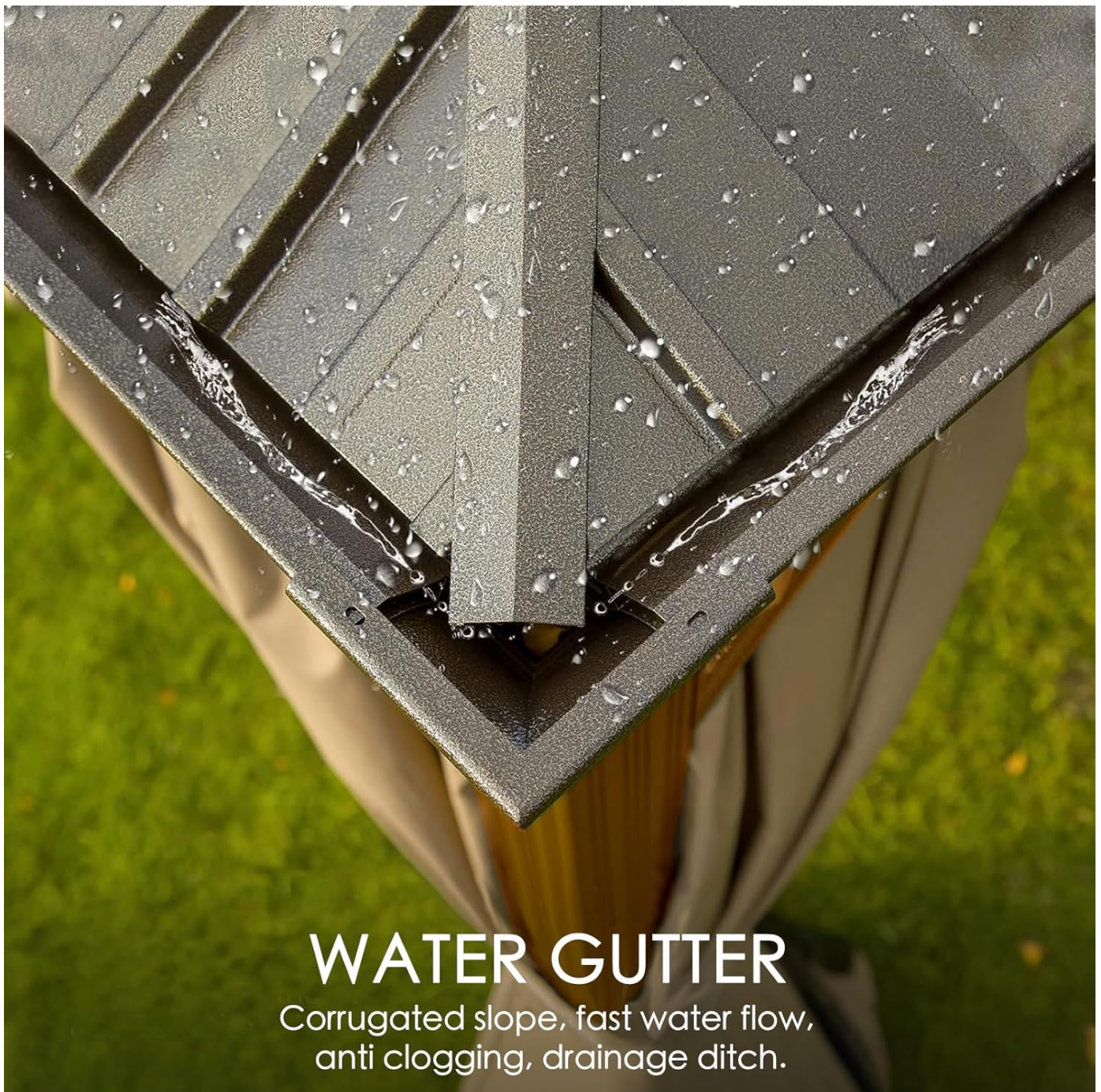
Figure 4.3: The water gutter system efficiently directs rainwater away from the structure.