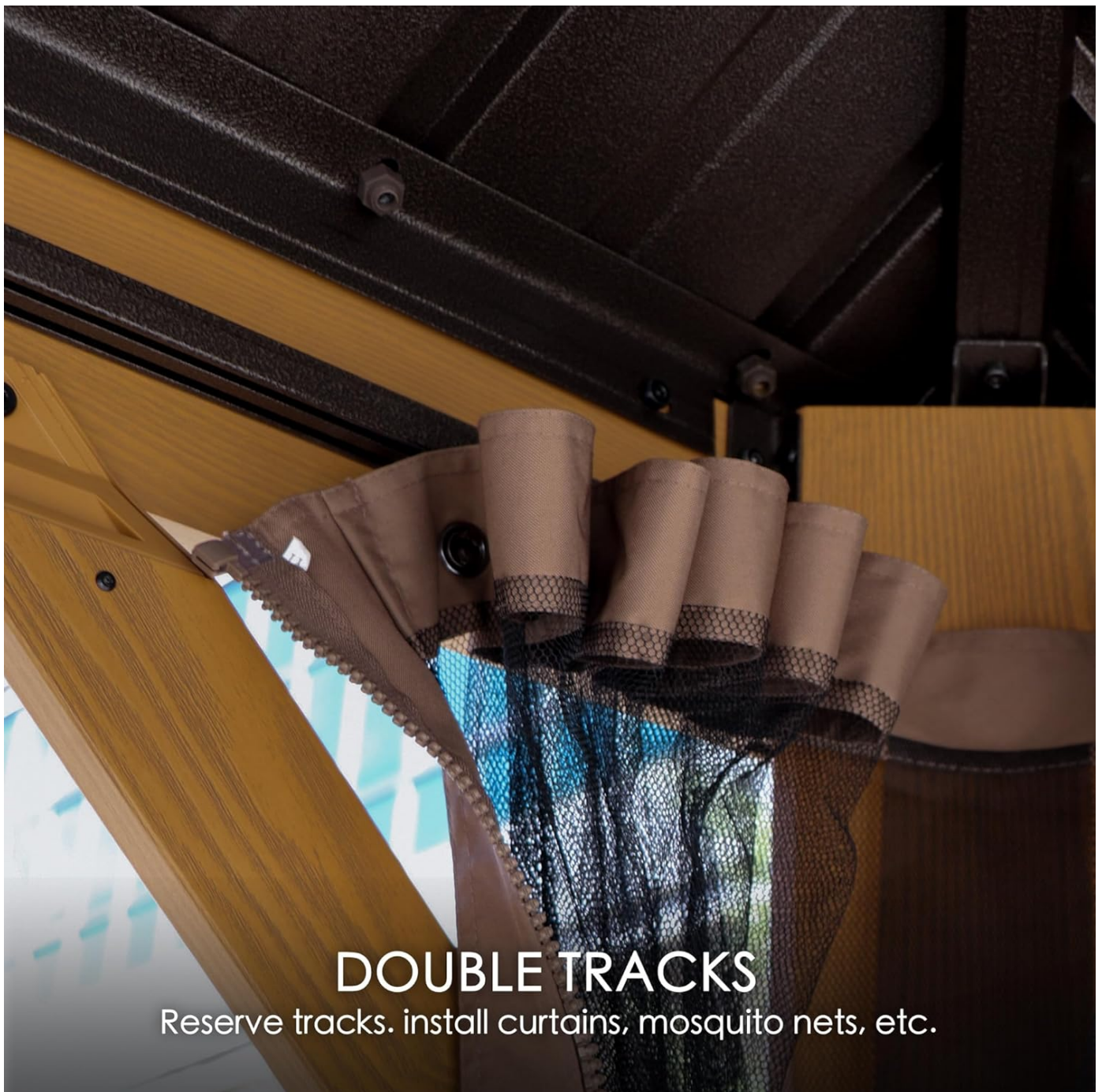
Figure 5.1: The double track system allows for simultaneous use of mosquito nets and optional privacy curtains.