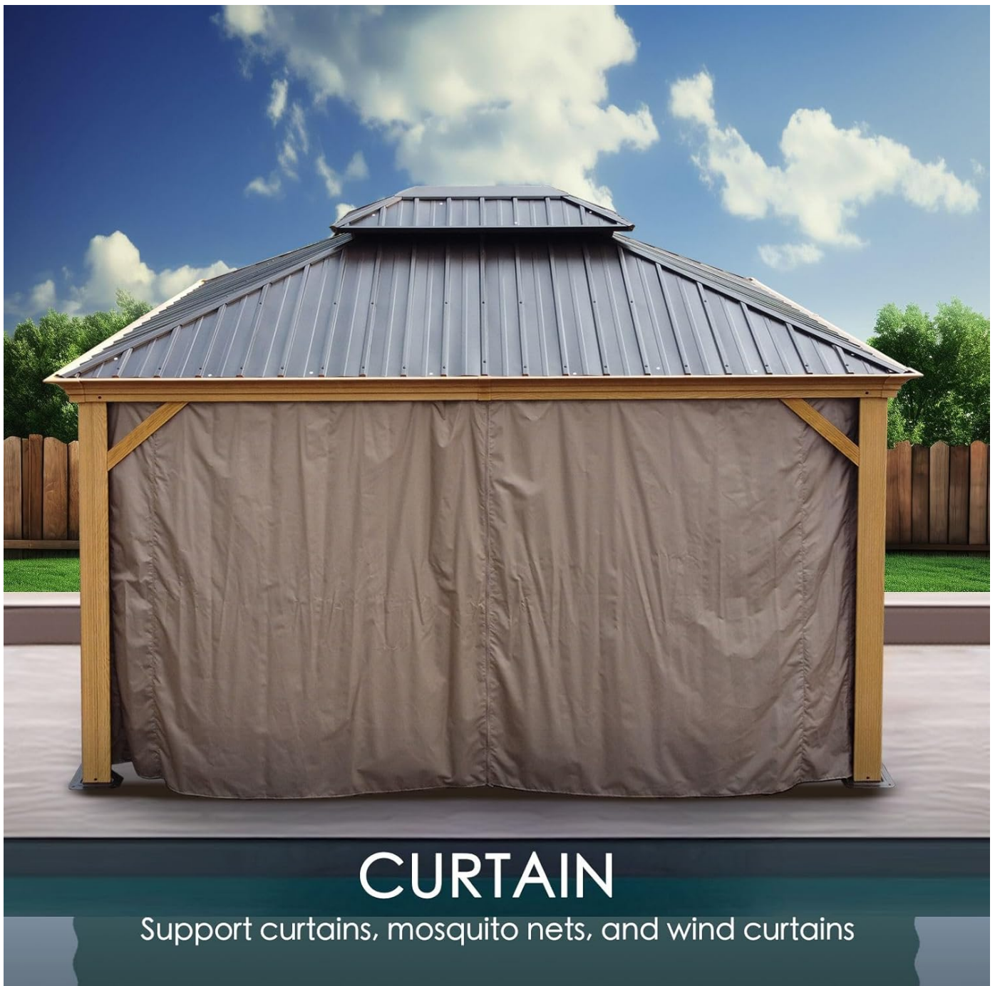
Figure 5.2: The gazebo supports the installation of privacy curtains for enhanced comfort.