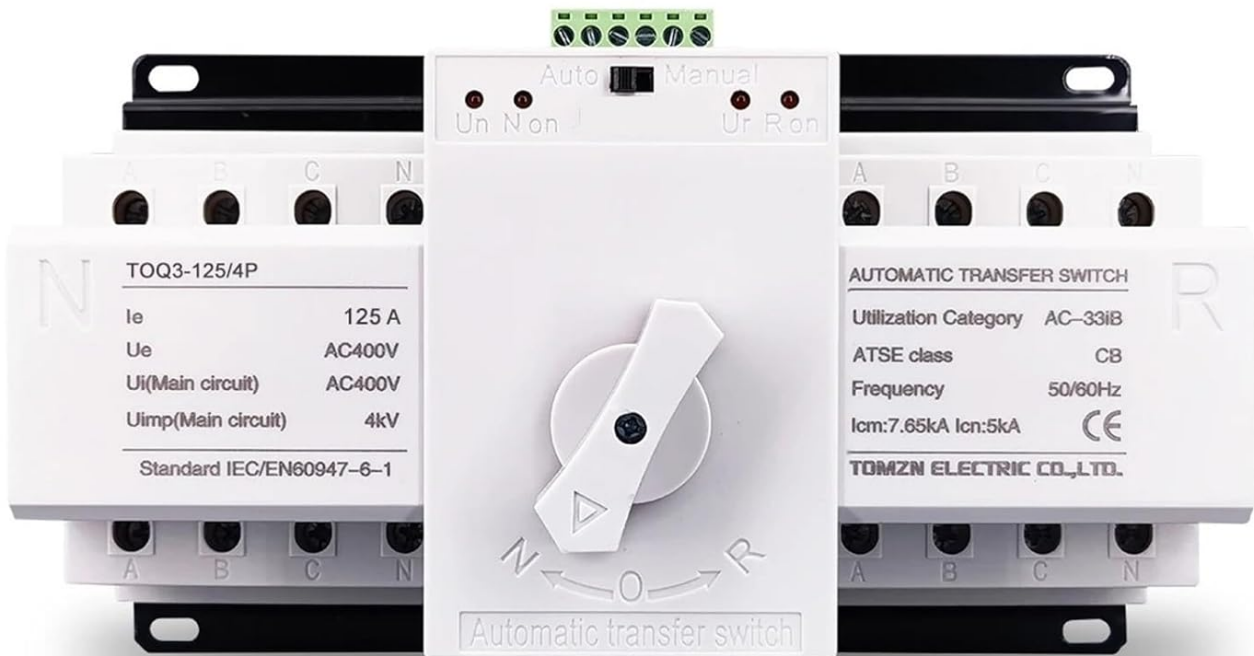
Figure 2: Front view of the ATS, highlighting the central rotary switch for power selection and the Auto/Manual selector switch at the top.