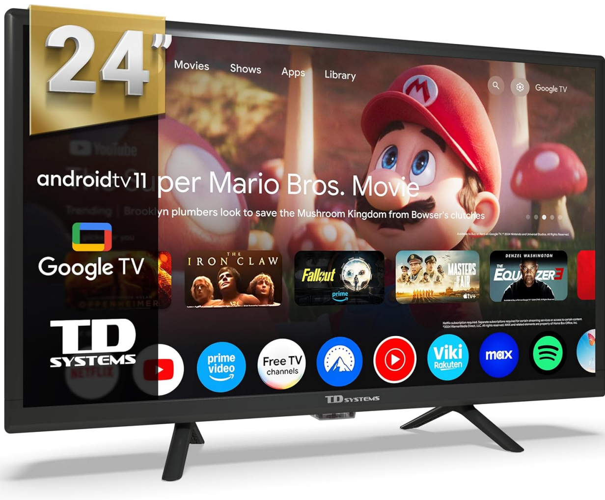
Image: The TD Systems 24-inch Smart TV, showcasing its sleek design and included stand.