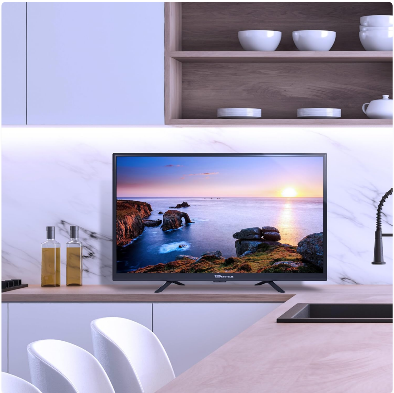
Image: The 24-inch TD Systems Smart TV seamlessly integrated into a modern kitchen environment, demonstrating its compact size and versatile placement options.