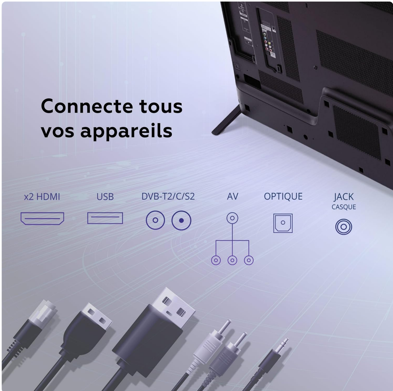
Image: A visual representation of the various input and output ports available on the TD Systems Smart TV, including HDMI, USB, DVB-T2/C/S2, AV, Optical, and Headphone Jack.