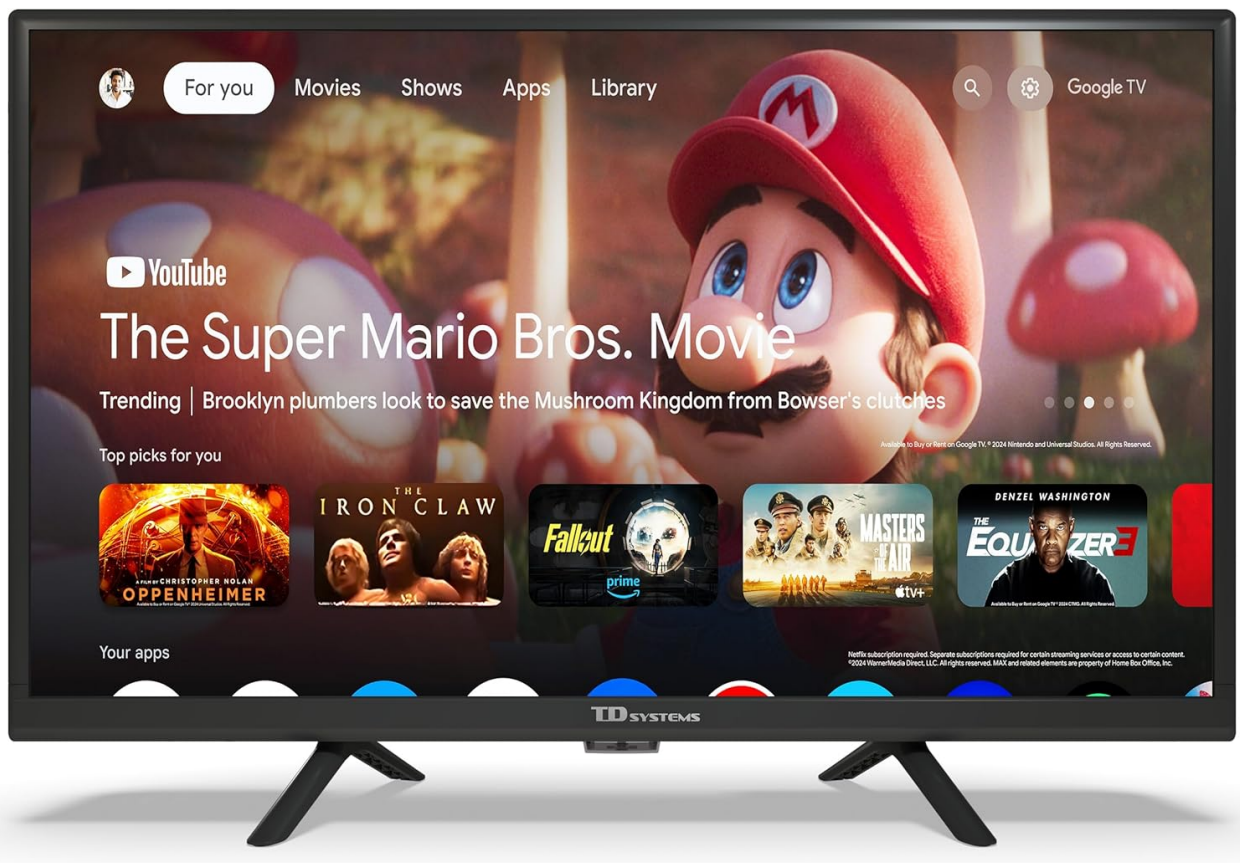
Image: The vibrant Google TV interface displayed on the TD Systems Smart TV, showing various streaming app icons and content recommendations.