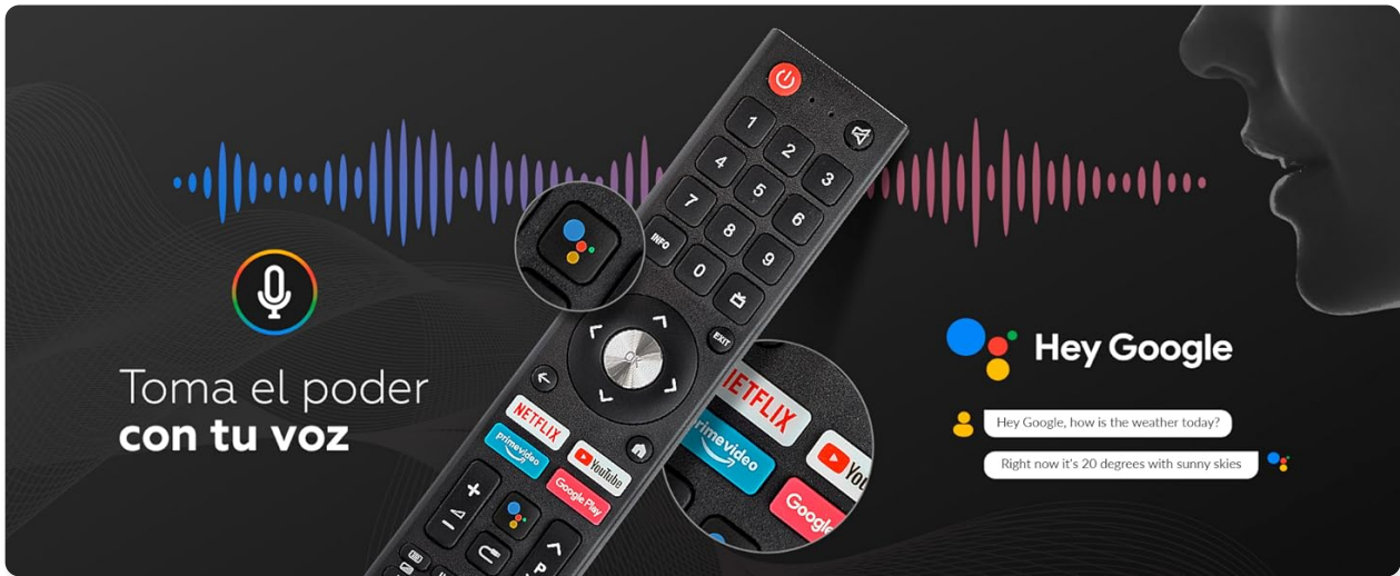
Image: The TD Systems remote control with a microphone icon and sound waves, demonstrating the voice control capability powered by Google Assistant.

Use your voice to control the TV, search for content, get answers, and manage smart home devices. Simply press the Google Assistant button on your remote and speak your command.