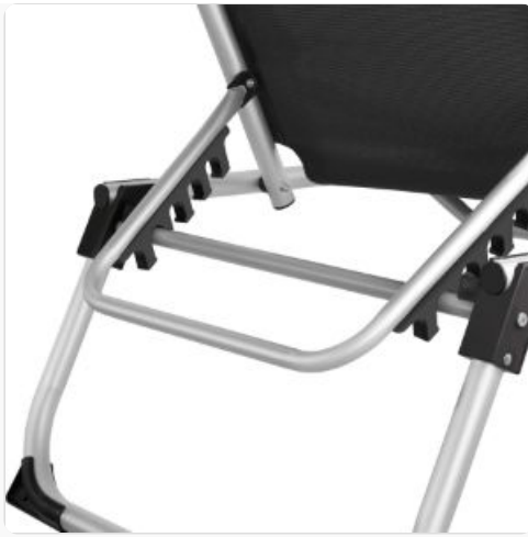
Image: A diagram illustrating the 6-step backrest adjustment mechanism, allowing users to easily change the recline angle from lying to sitting positions.