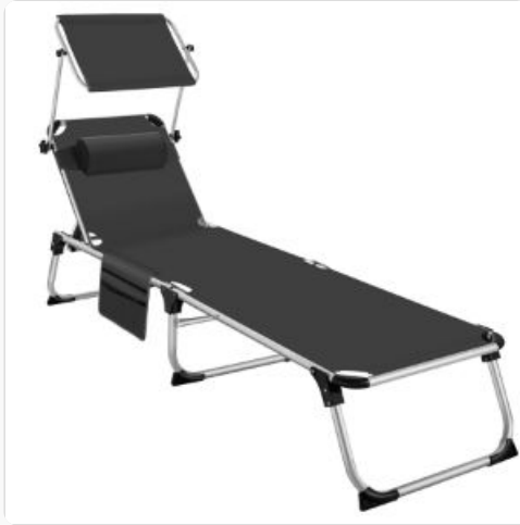
Image: A detailed view highlighting the comfortable head pillow and the practical side pocket, designed for storing personal items within easy reach.