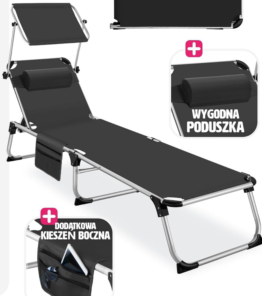
Image: The tectake Aurelie Folding Garden Lounger, showcasing its design with an adjustable sun canopy and a comfortable head pillow.

100% stabilności dzięki antypoślizgowym nóżkom