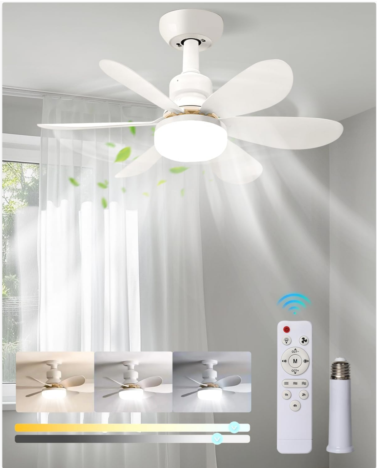
Image: The Elenhome Socket Fan Light installed in a room, showcasing its adjustable light color temperatures and fan operation, along with the remote control and a socket extender.