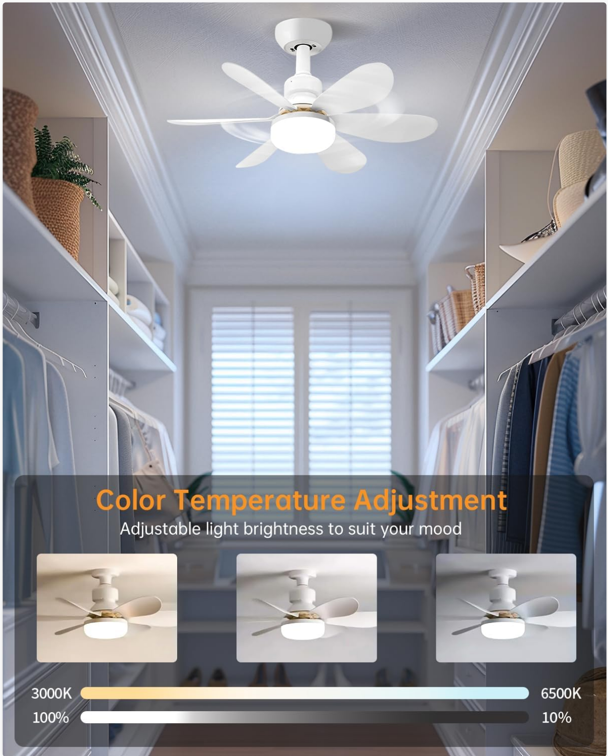
Image: The Elenhome Socket Fan Light installed in a closet, illustrating the color temperature adjustment feature from warm (3000K) to cool (6500K) light, with brightness control.