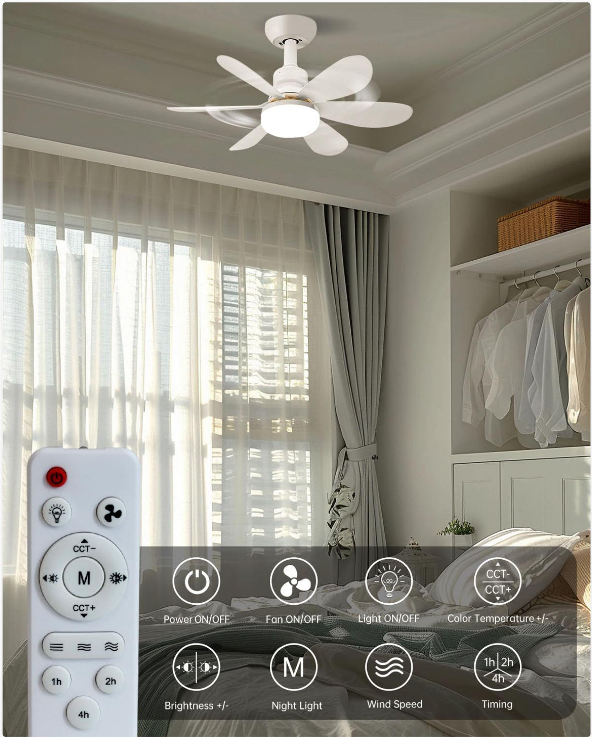
Image: The remote control for the Elenhome Socket Fan Light, with various buttons clearly labeled for power, light, fan, brightness, color temperature, night light, wind speed, and timing functions.