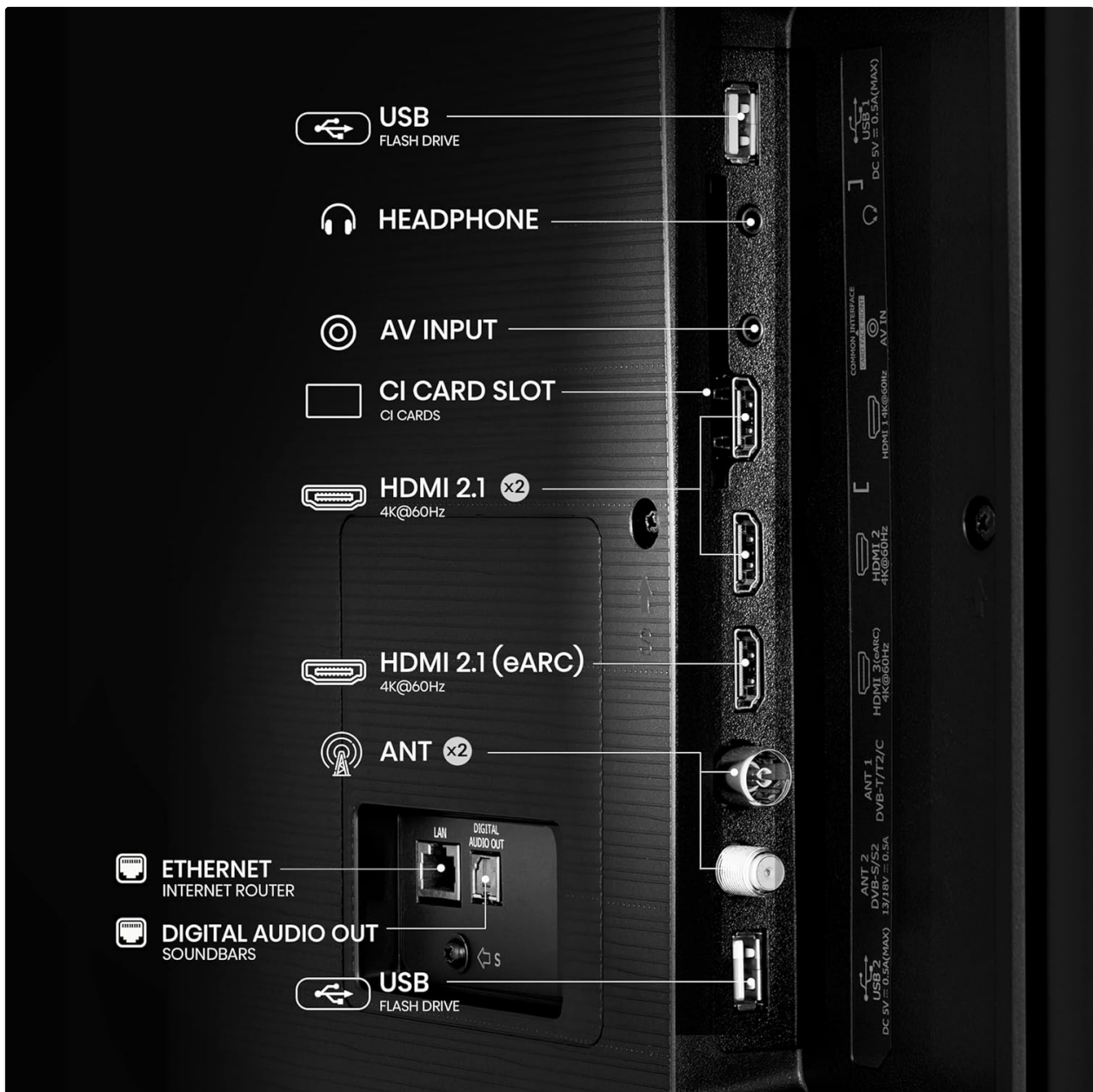
Image 3.1: Detailed view of the rear connectivity ports on the Hisense 43E63NT TV, including HDMI, USB, Ethernet, and antenna inputs.