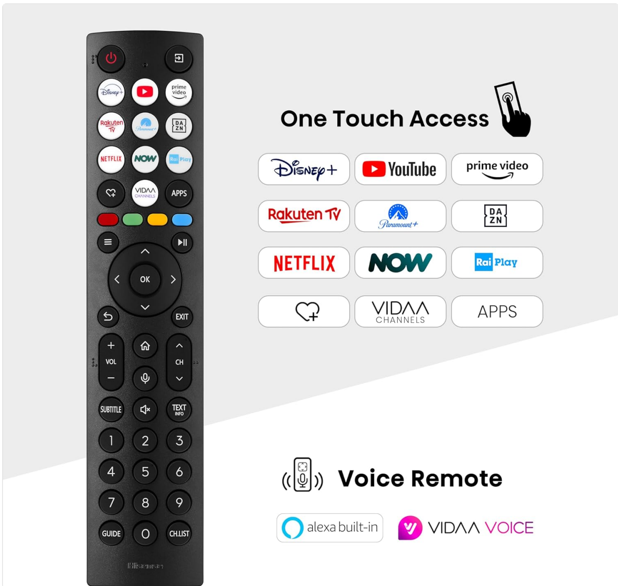
Image 4.1: The Hisense Smart TV remote control, highlighting dedicated buttons for popular streaming services and voice control.